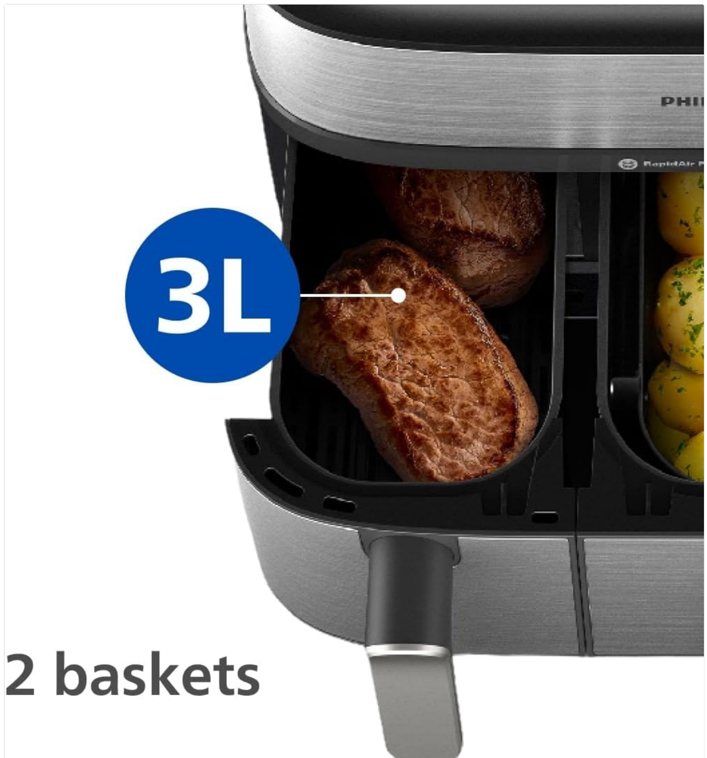
Figure 4: RapidAir Plus Technology ensures even cooking by circulating hot air rapidly.

The appliance also features 12 convenient ingredient presets to simplify cooking. The HomeID app provides over 10,000 tailored recipes.