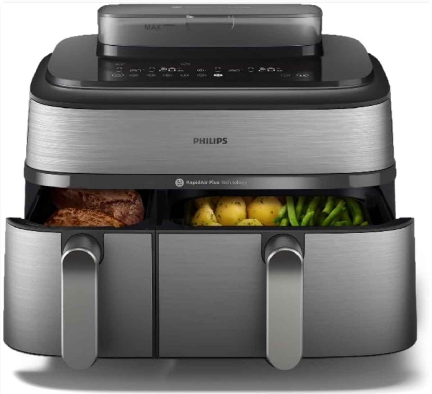
Figure 1: Front view of the Philips Airfryer 5000 Series Dual Basket with Steam, showcasing its two independent cooking baskets.