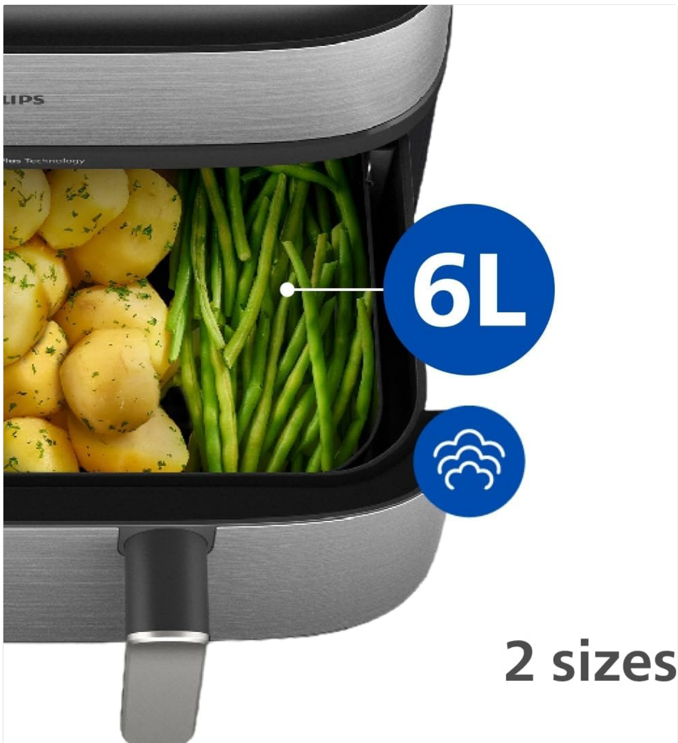
Figure 3: The dual baskets allow for cooking different foods simultaneously, ensuring both are ready at the same time.

Your browser does not support the video tag.