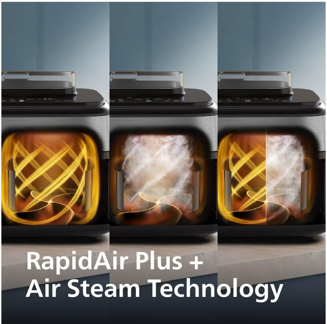
Figure 2: Illustration of RapidAir Plus Technology for air frying and Air Steam Technology for steaming within the appliance.