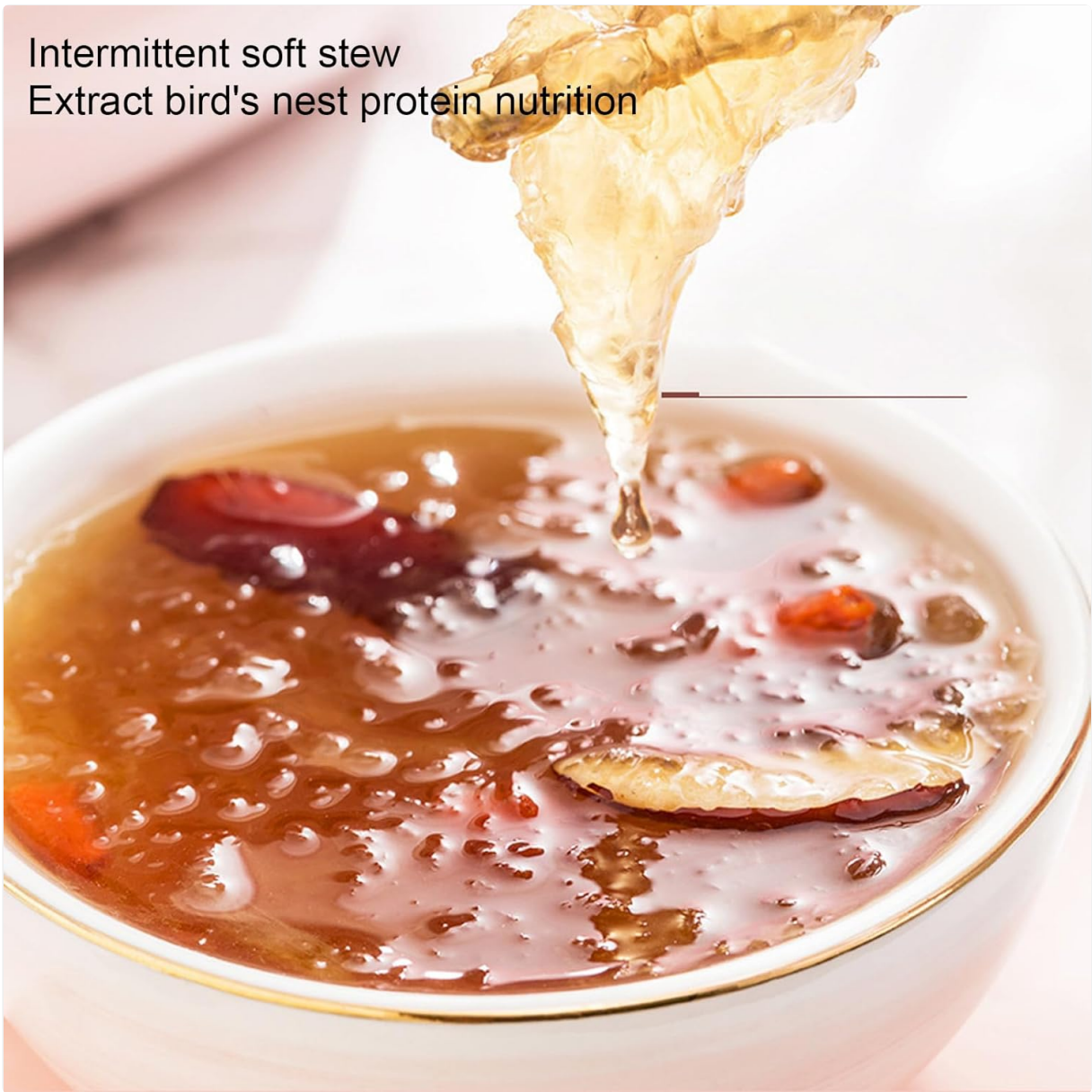
Figure 5: Illustrating the extraction of bird's nest protein nutrition

Intermittent soft stew Extract bird's nest protein nutrition