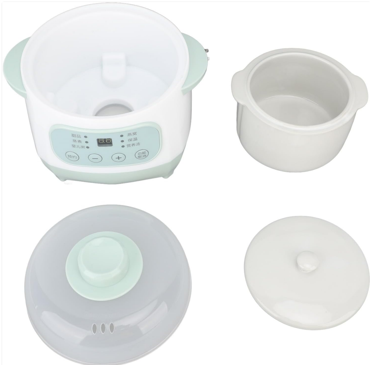
Figure 2: Main components of the slow cooker