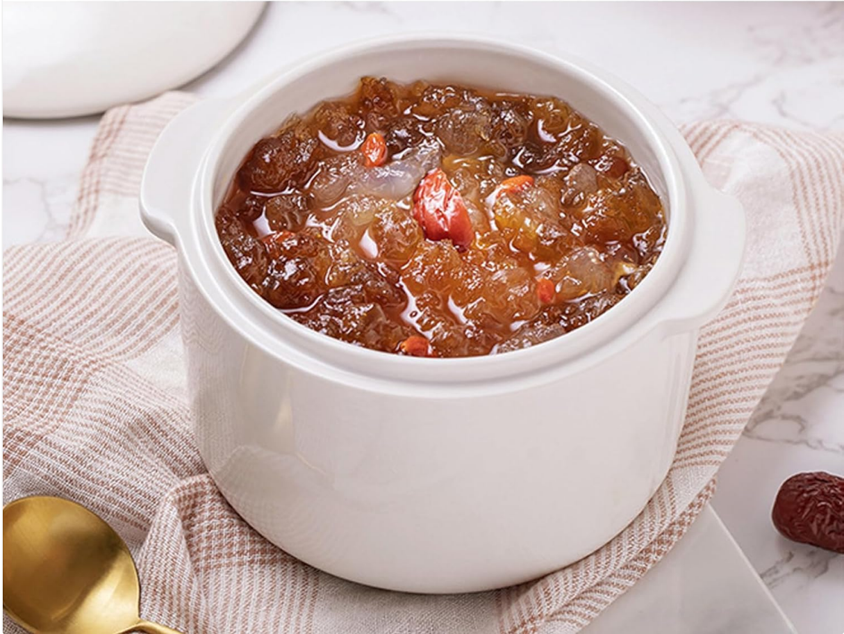
Figure 4: Example of a prepared dish (Bird's Nest Soup)