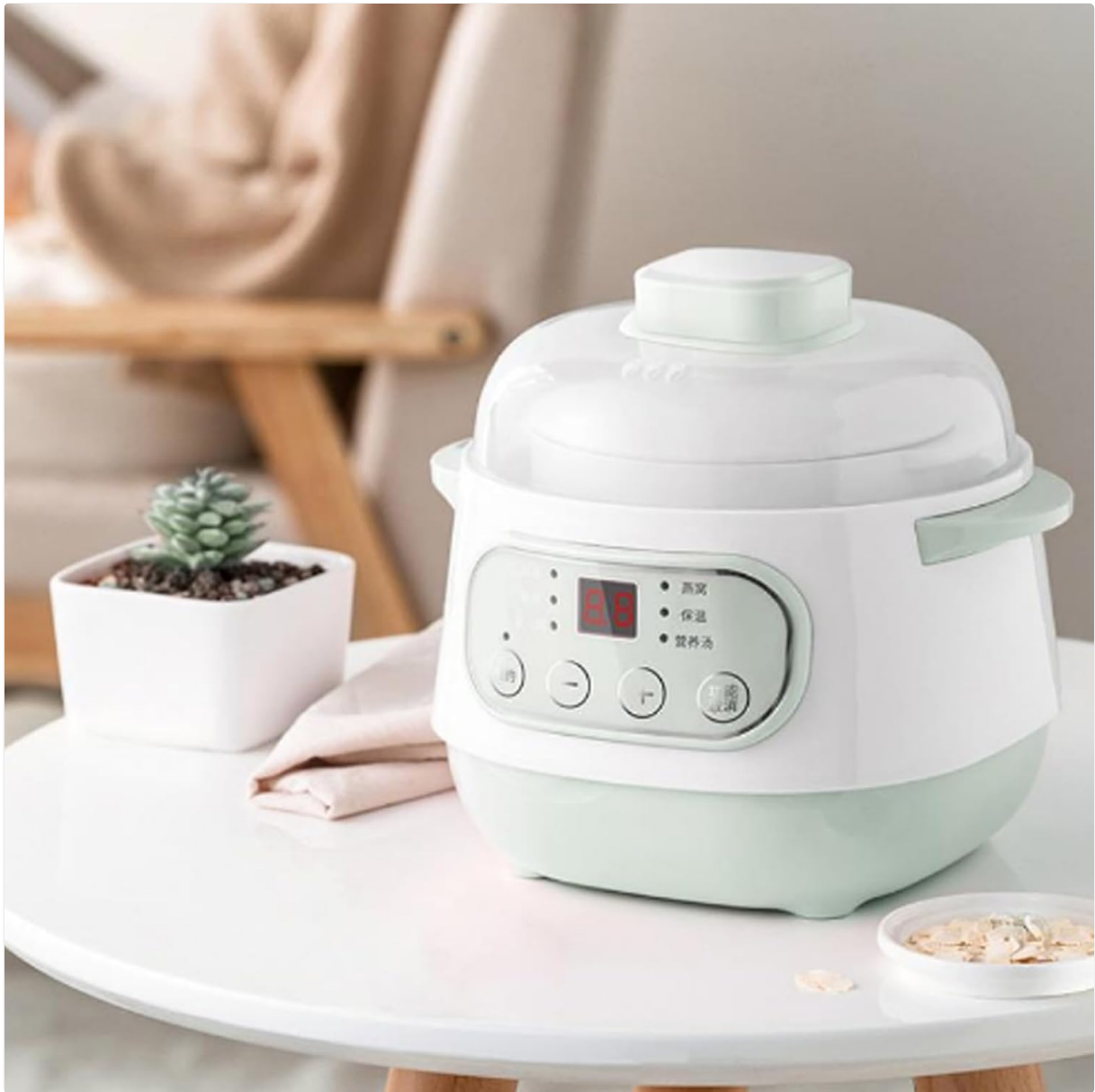
Figure 1: ZJchao 1L Ceramic Slow Cooker