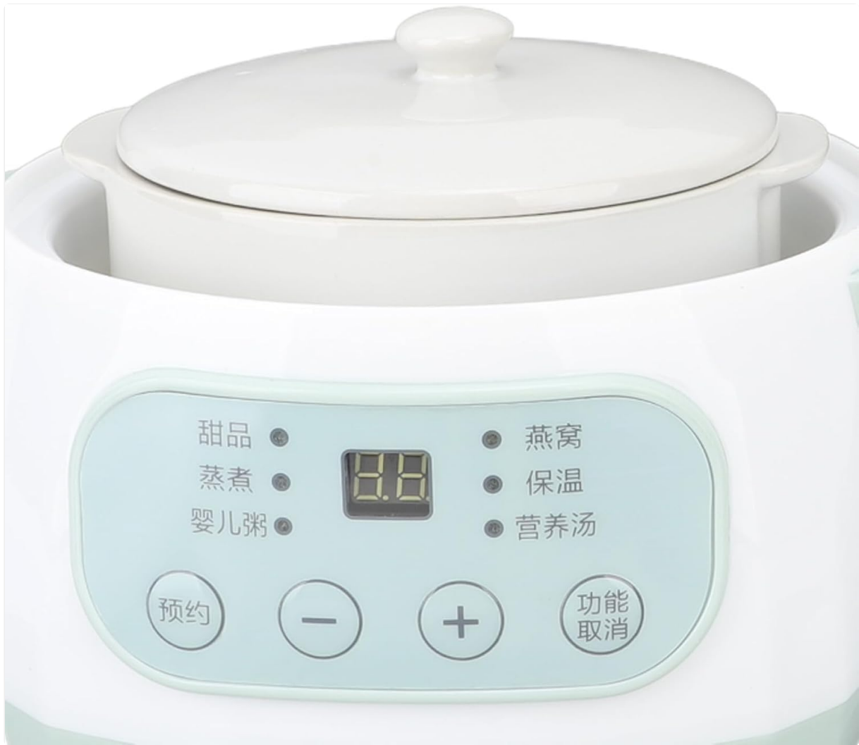
Figure 3: Control Panel