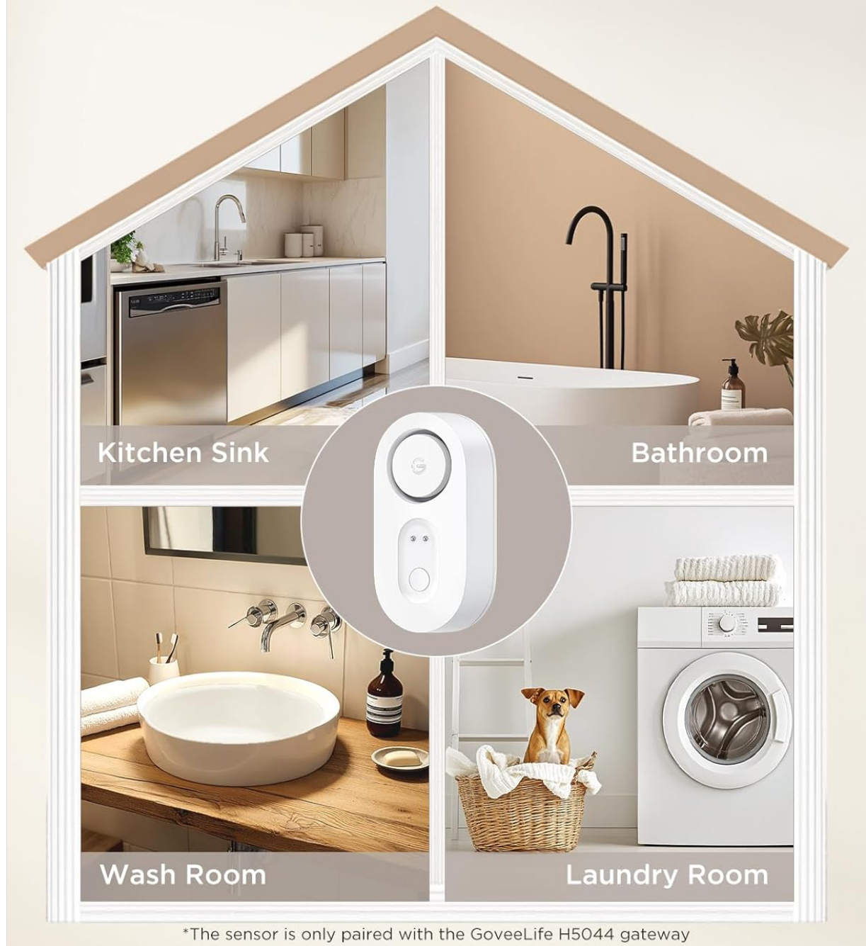
Figure 2.6: Its compact size allows for placement in various risk zones, including under sinks, near washing machines, and in basements.

Slips under sinks, behind washers – fits anywhere water lurks