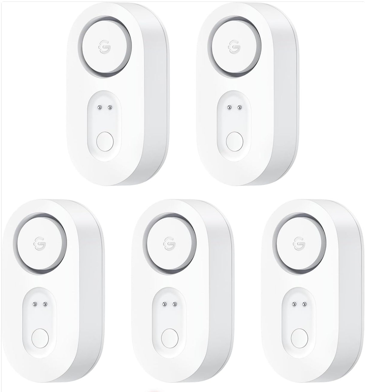
Figure 2.1: GoveeLife Water Leak Detector (5-Pack).