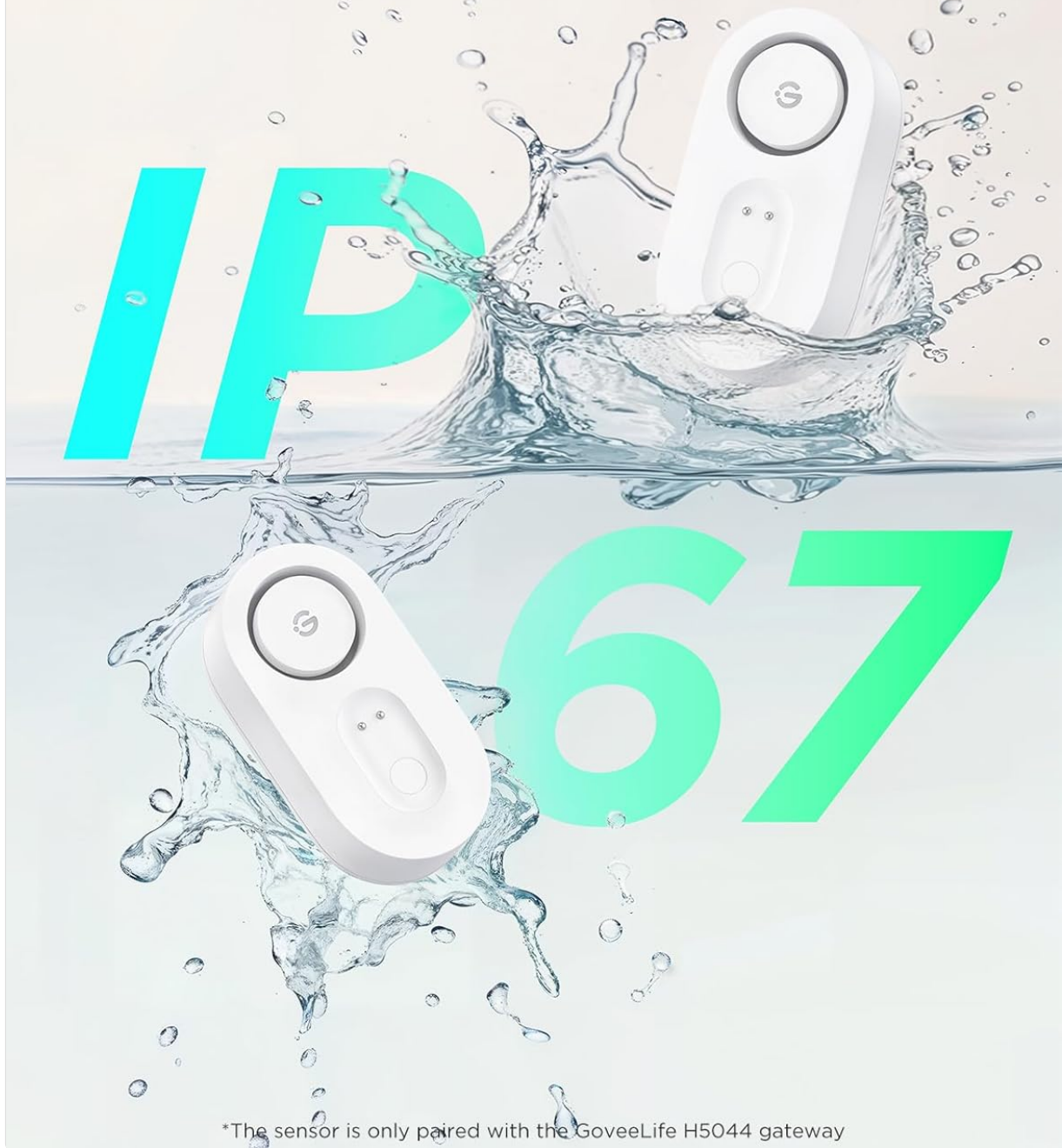
Figure 2.5: The IP67 waterproof design ensures durability and reliability in wet conditions.