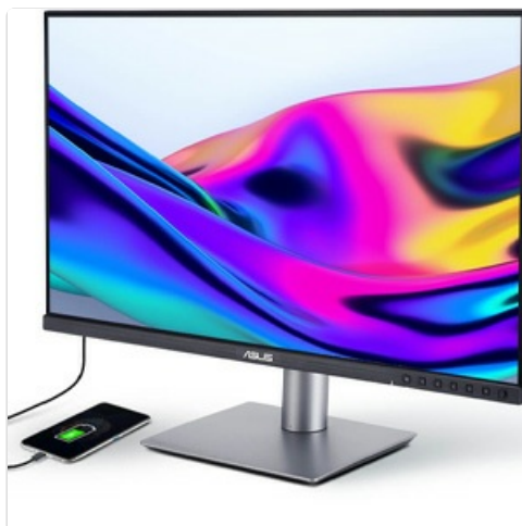
Image: A smartphone connected to the USB port of the ASUS ProArt PA248QFV monitor, demonstrating its capability to charge external devices.

The integrated USB hub provides four USB-A 3.2 Gen 1 ports for connecting peripherals or charging devices. Ensure the USB-B to USB-A upstream cable is connected to your computer for this functionality.