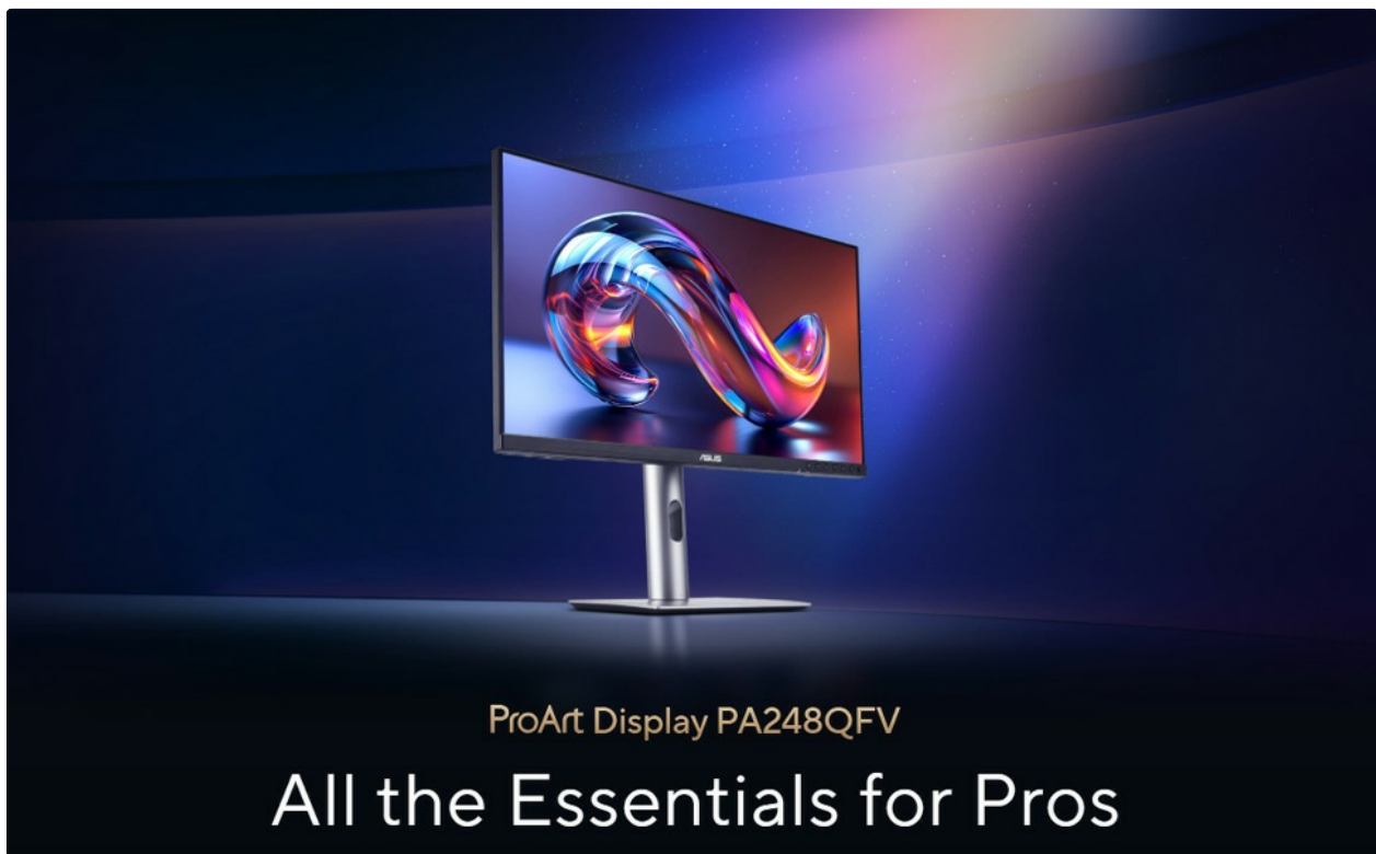
Image: The ASUS ProArt PA248QFV monitor, showcasing its design and vibrant display capabilities, emphasizing its suitability for professional use.