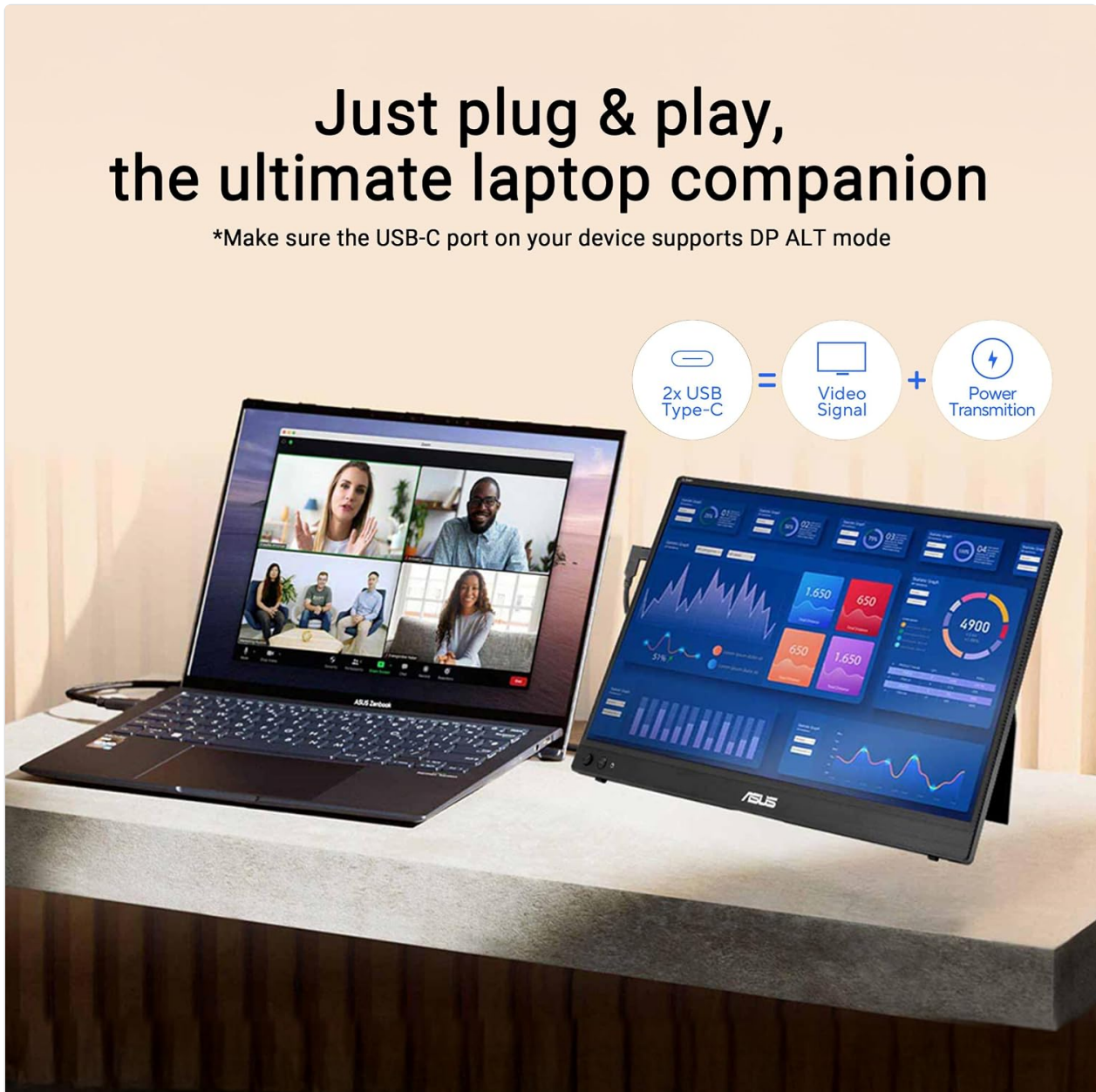
Image: The ASUS ProArt PA248QFV monitor set up alongside a laptop, illustrating its use as an extended display for enhanced productivity.