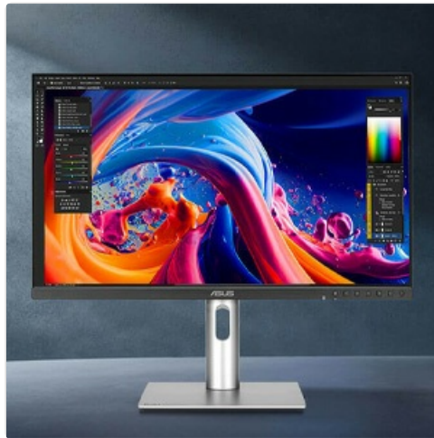
Image: The ASUS ProArt PA248QFV monitor displaying various creative software icons, illustrating its compatibility and utility for professional content creation.

and other functions without using the OSD buttons.