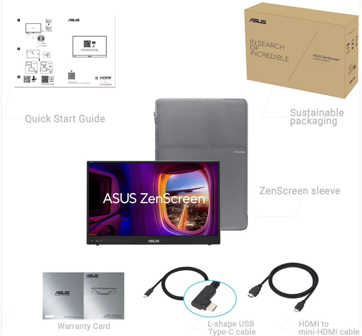
Image: An overview of the items included in the ASUS ProArt PA248QFV monitor packaging, showing the monitor, cables, and user guides.