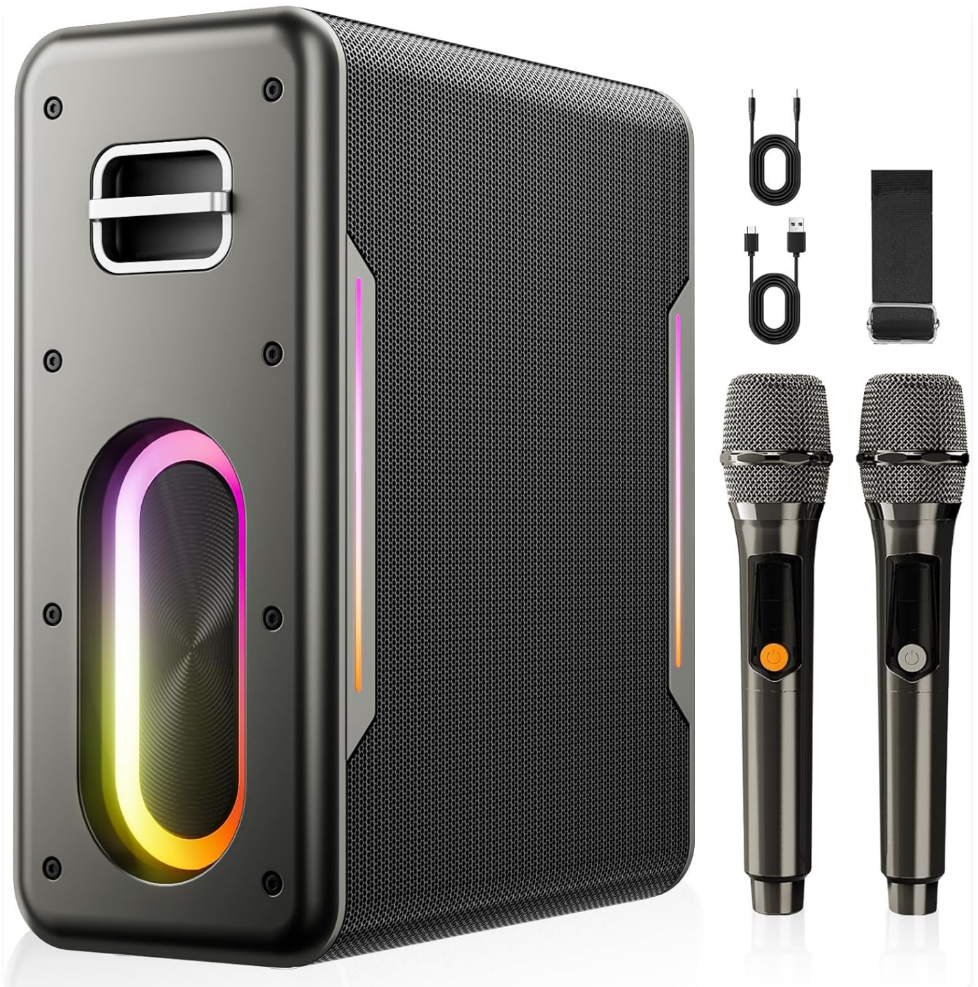
Image: Contents of the Myscenetang Karaoke Machine package, including the main speaker unit, two wireless microphones, charging cables, and a carrying strap.