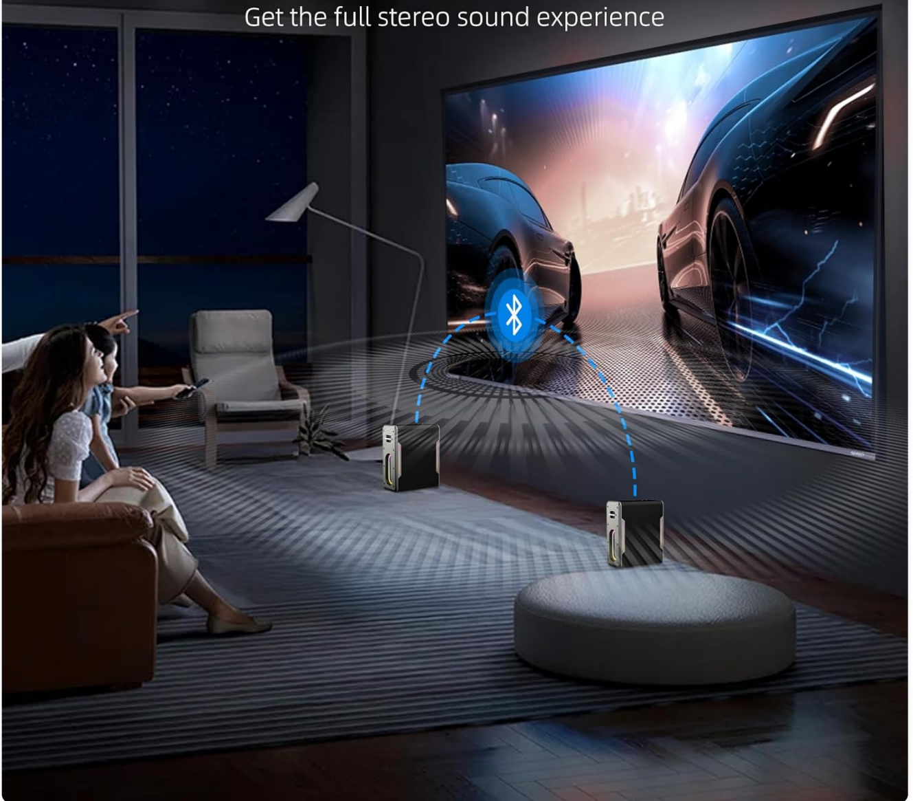
Image: Two Myscenetang karaoke machines set up to demonstrate True Wireless Stereo (TWS) functionality, providing a wider soundstage for an enhanced audio experience.