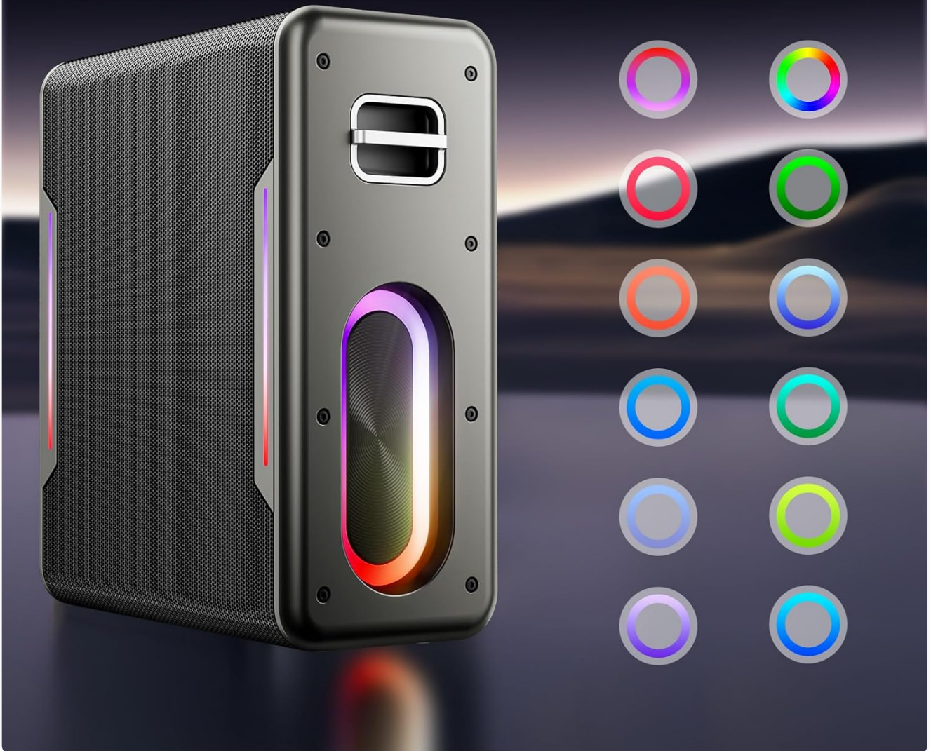
Image: The karaoke machine displaying its dynamic LED light effects, which can synchronize with music to create a party atmosphere.

Transform your space with our disco light effects