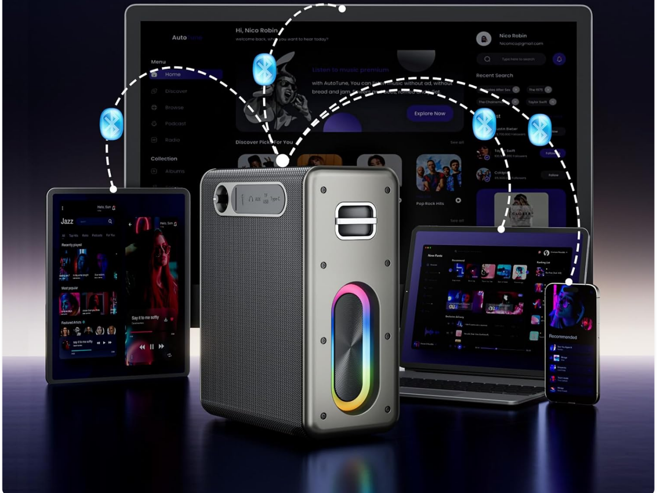
Image: The karaoke machine wirelessly connected to multiple devices, illustrating its fast and stable Bluetooth transmission and portability for various uses.