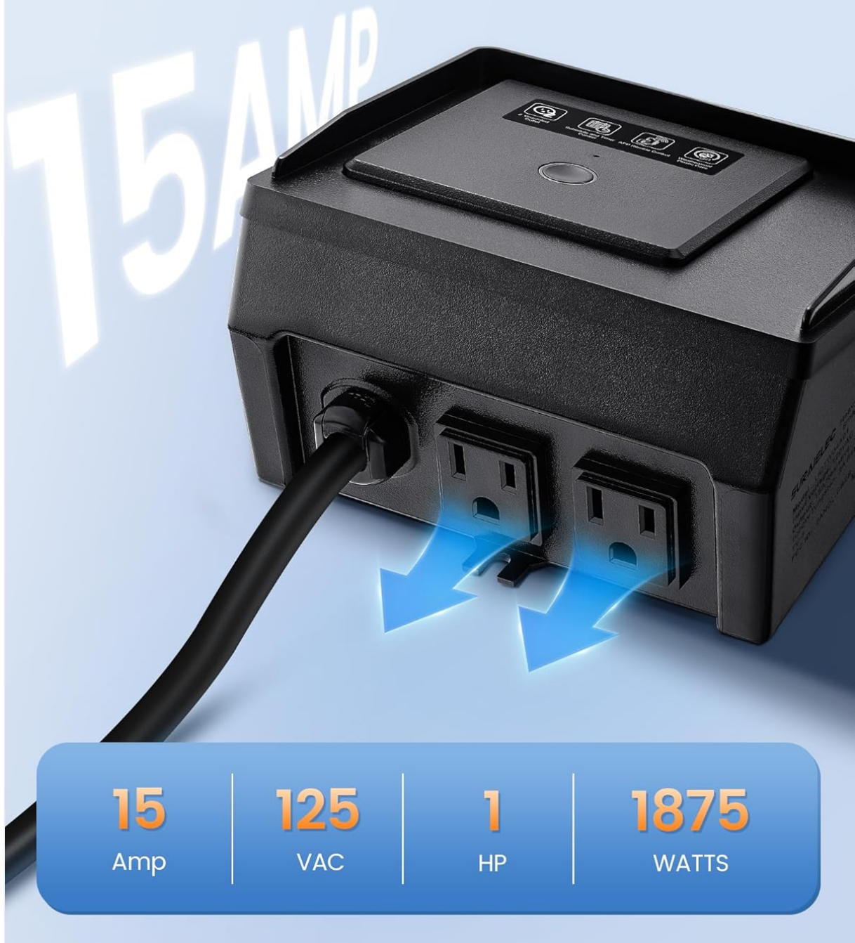
Figure 2: Dual Outlets and Power Ratings