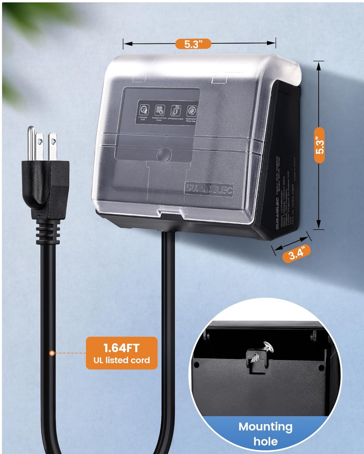
Figure 3: Timer Dimensions and Mounting