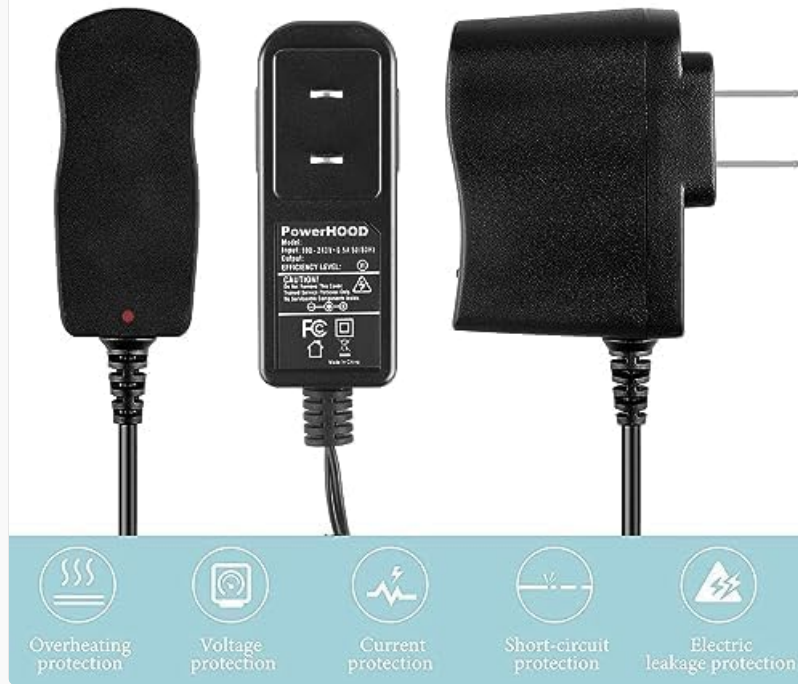
Image: Three distinct views of the PowerHOOD AC/DC adapter, highlighting its compact design and the product label with electrical specifications.