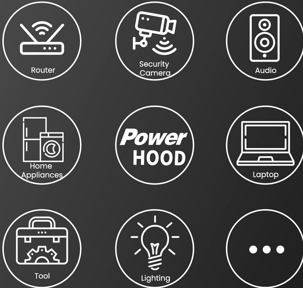
Image: A graphic illustrating the broad compatibility of PowerHOOD adapters with various electronic devices such as routers, security cameras, audio equipment, home appliances, laptops, tools, and lighting.