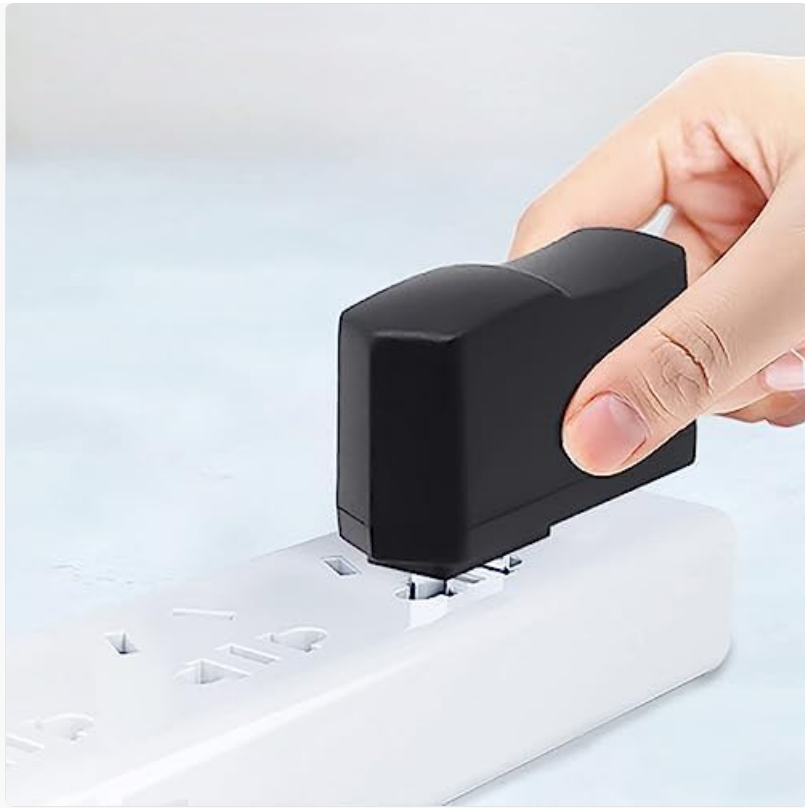
Image: A hand demonstrating the action of plugging the PowerHOOD AC/DC adapter into a multi-outlet power strip.