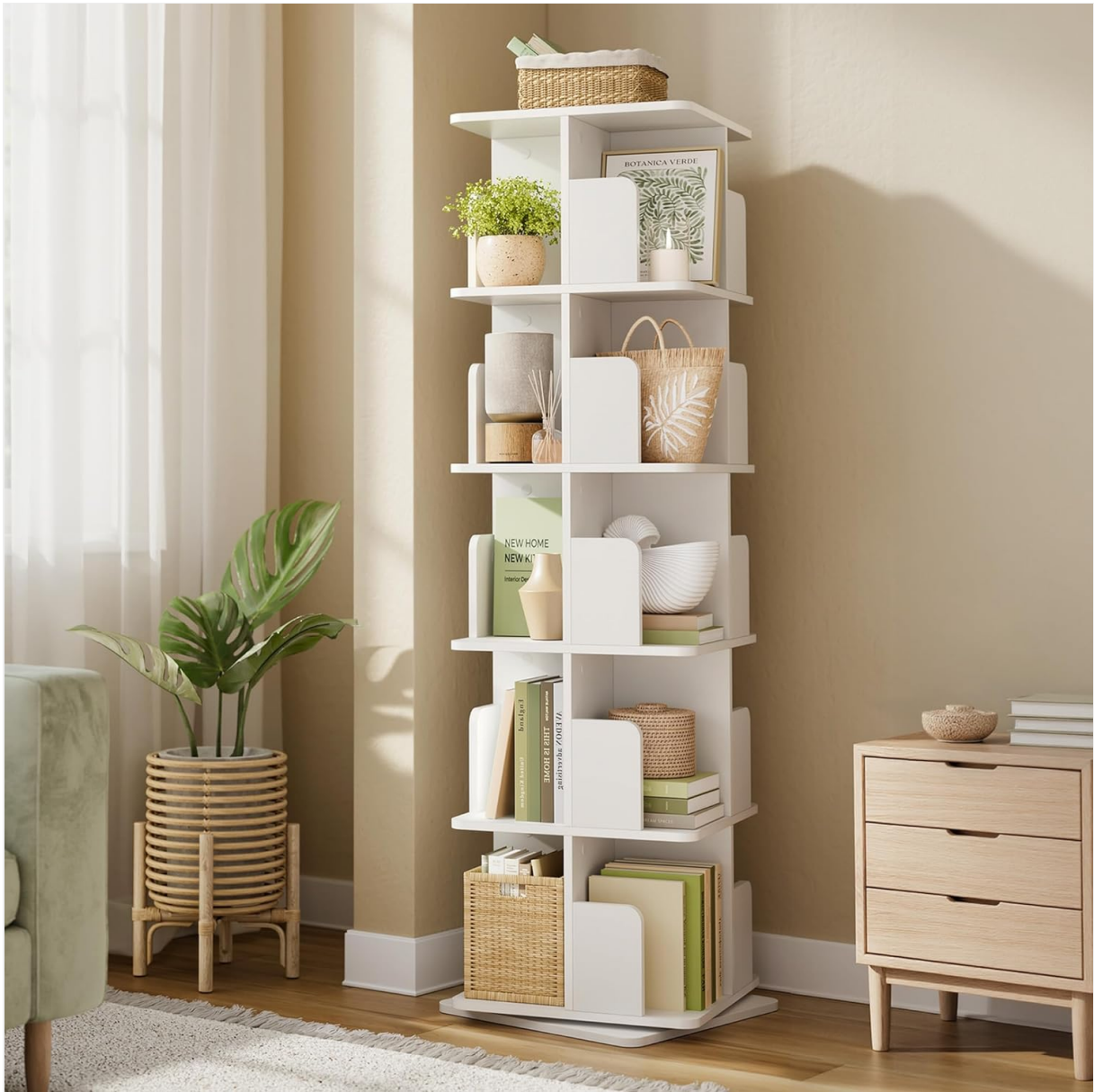
Figure 1: EUGAD 5-Tier Rotating Bookshelf in a living room.