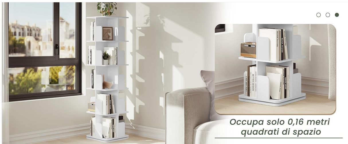
Figure 3: Available sizes and dimensions of the rotating bookshelf.