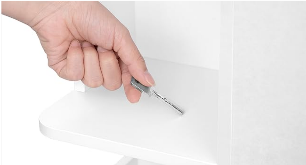
Figure 5: Material quality and ease of cleaning.