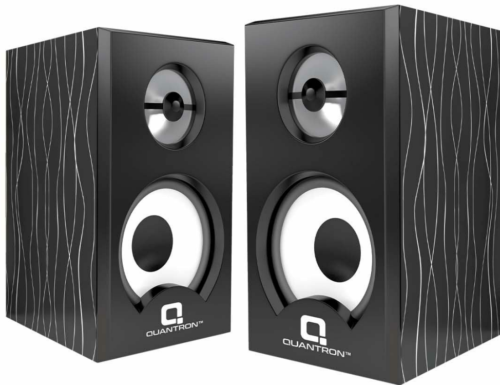
Image: Quantron QWS-1205 Computer Speakers, front view.