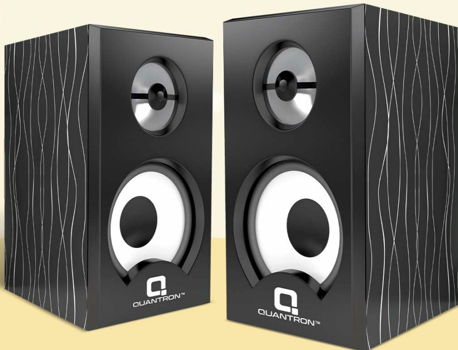
Image: Diagram illustrating key features: Heavy Bass, Stereo Sound, USB 2.0, 3.5mm Audio Jack, 2x3 Watt output, and 4 Ohm Impedance.