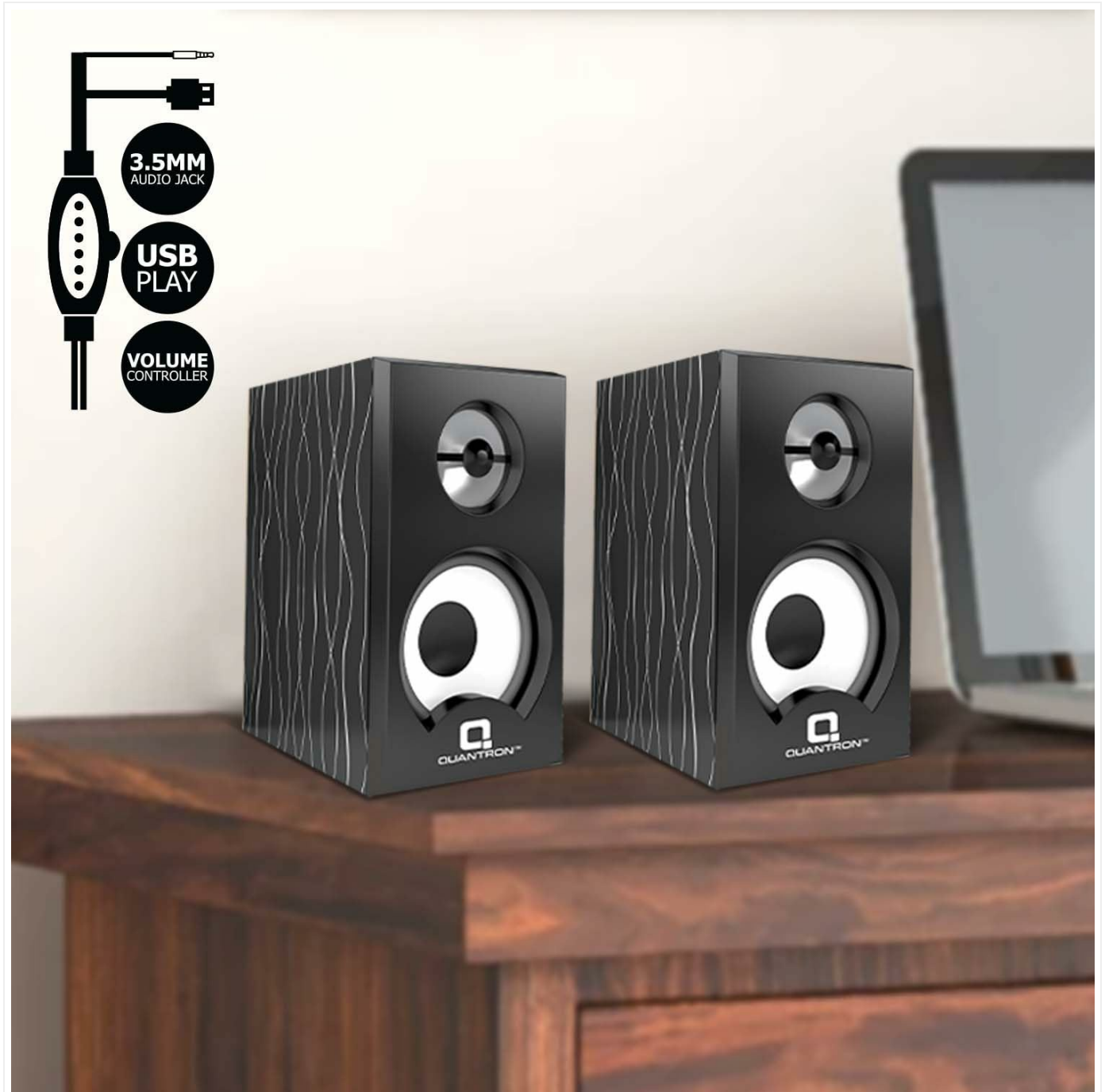
Image: Diagram showing the 3.5mm audio jack, USB connector, and inline volume controller for the speakers.