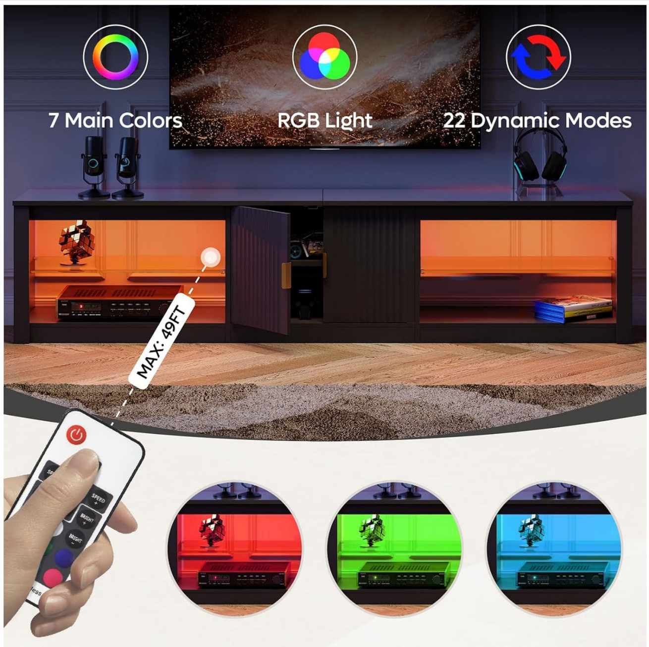
Figure 3: LED Lighting Features. This image displays the remote control used to operate the LED lights, illustrating the 7 main colors and 22 dynamic modes available to customize the ambiance of your entertainment area.