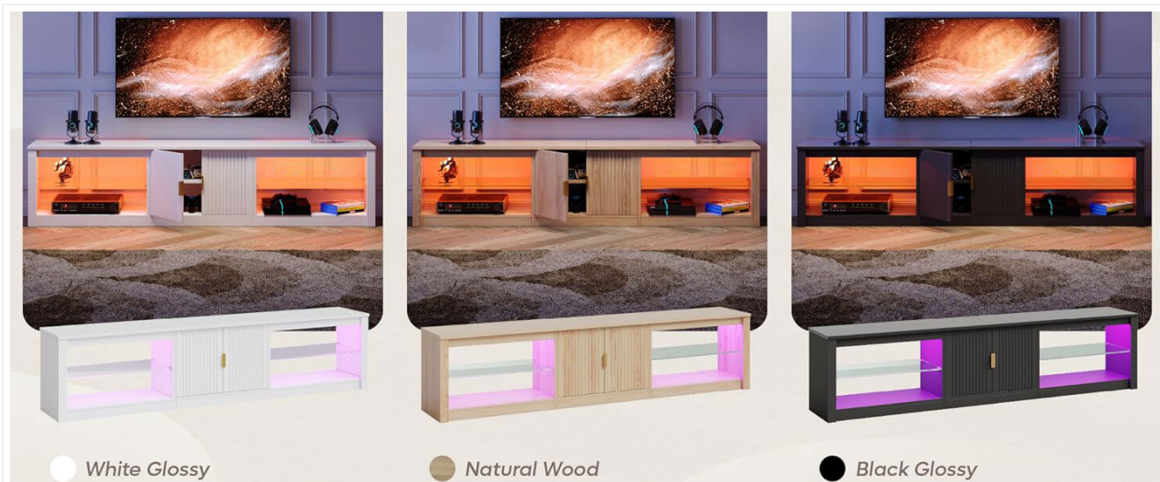
Figure 2: Tabletop Capacity and Finish. This image emphasizes the robust tabletop capacity of 176 lbs (80 kg) and showcases the