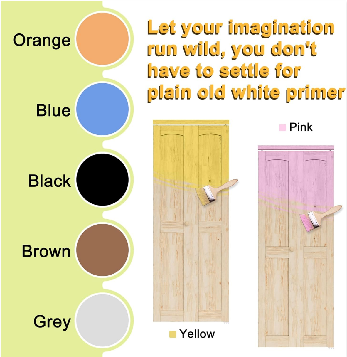
Image: An unfinished pine wood door panel, illustrating its paintable surface and the potential for customization to match various interior designs.