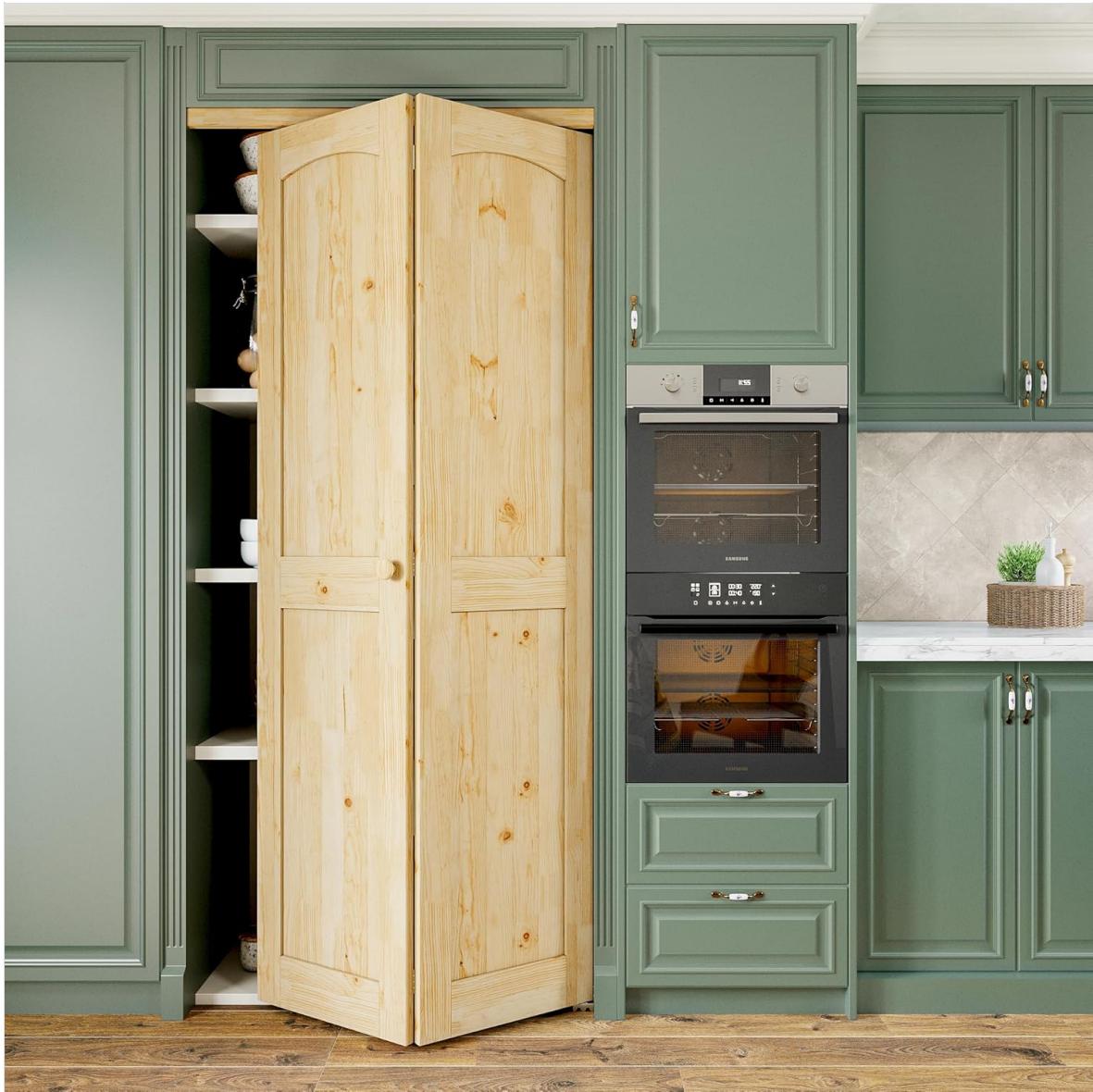
Image: The AINLARRY 36" x 80" Solid Core Pine Wood Bifold Closet Door in a closed position, showcasing its natural pine finish and classic design.