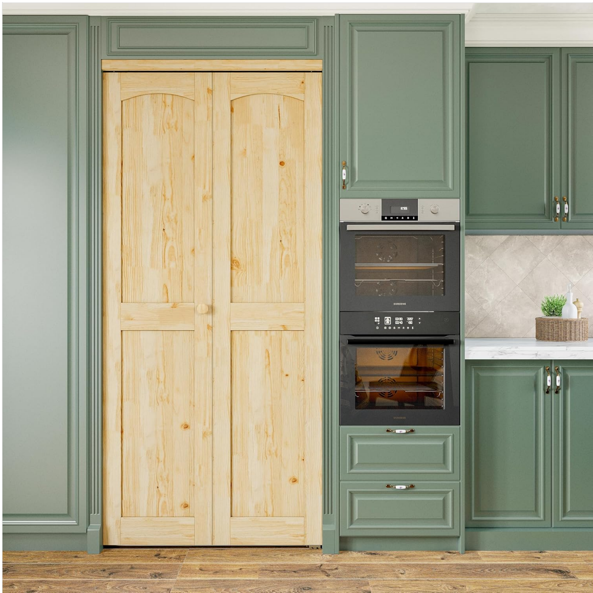
Image: A front view of the AINLARRY bifold door, showing its full dimensions and design, useful for visual reference during installation.