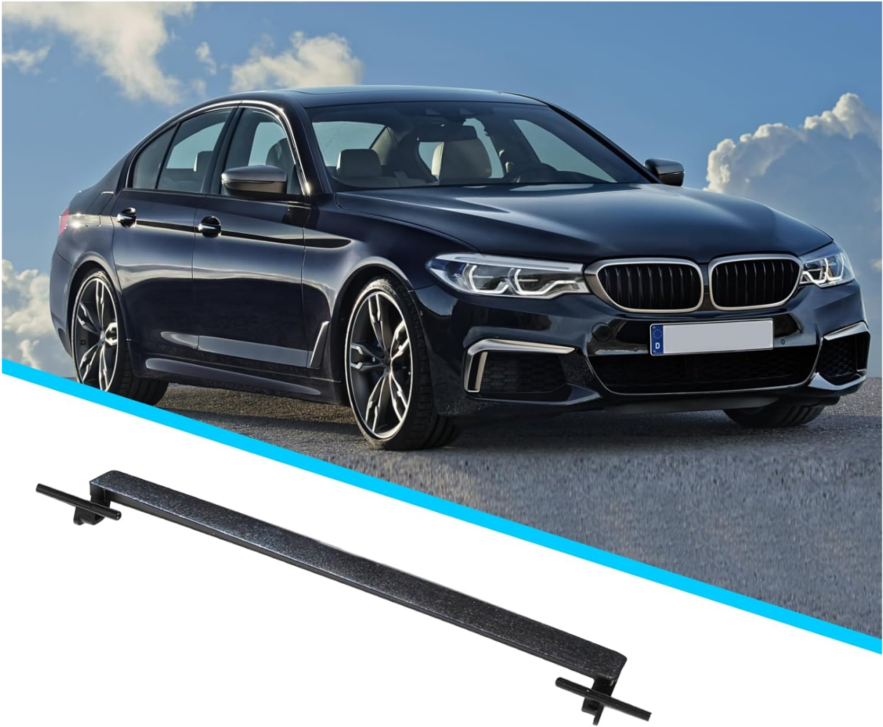
Image: Product compatibility with BMW 5 Series models.

Compatible with BMW 5 Series G30/G31/F90 M5 2018-2023