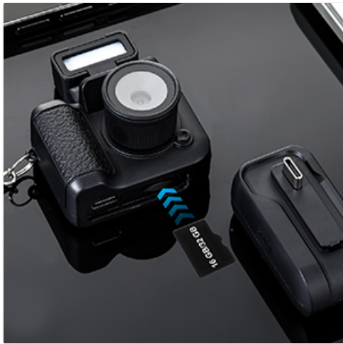
Image: A close-up showing a 16GB memory card being inserted into the camera's designated slot, with an arrow indicating the correct direction.