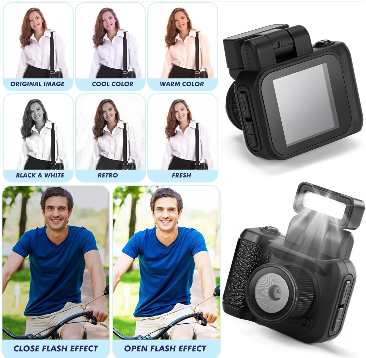
Image: A detailed view of the camera's side, highlighting the action buttons for mode switching and filter selection, and the 1.44-inch screen.