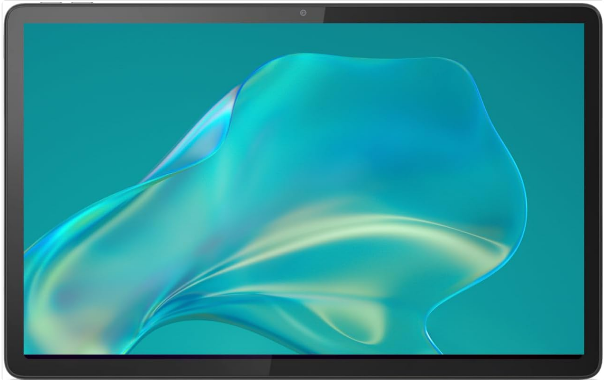
Image: A clear front view of the Lenovo Tab M11, showcasing its 11-inch WUXGA (1920x1200) IPS display with vibrant colors, demonstrating the tablet's visual clarity.