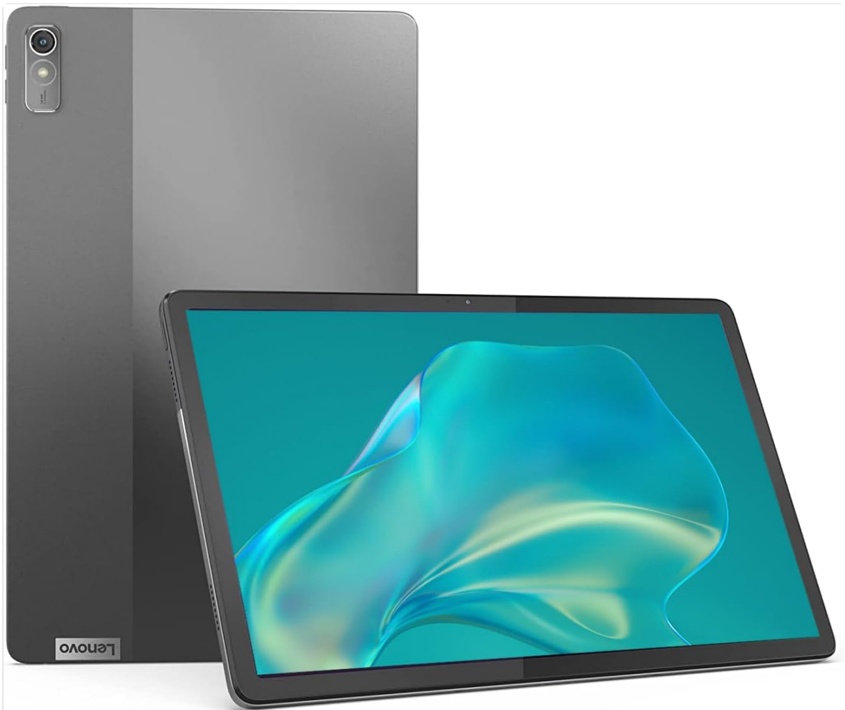
Image: The back of the Lenovo Tab M11 tablet, showcasing its sleek design and the placement of the rear 8.0MP camera module, along with the Lenovo brand logo.