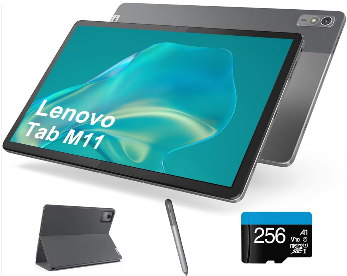
Image: The Lenovo Tab M11 tablet displayed with its bundled accessories, including the Lenovo Tab Pen, a protective folio case, and a 256GB microSD card, illustrating the complete package contents.