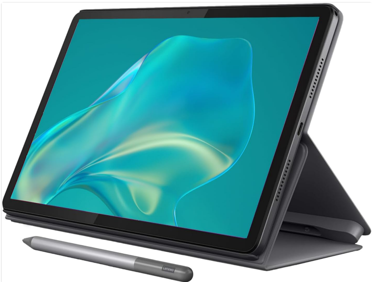
Image: The Lenovo Tab M11 tablet securely placed within its folio case, positioned to stand upright, with the Lenovo Tab Pen visible in the foreground, demonstrating its use as a protective cover and stand.

The folio case provides protection and can act as a stand. Align the tablet with the case and gently press it into place. The case typically has magnetic closures and can be folded to prop up the tablet for viewing.