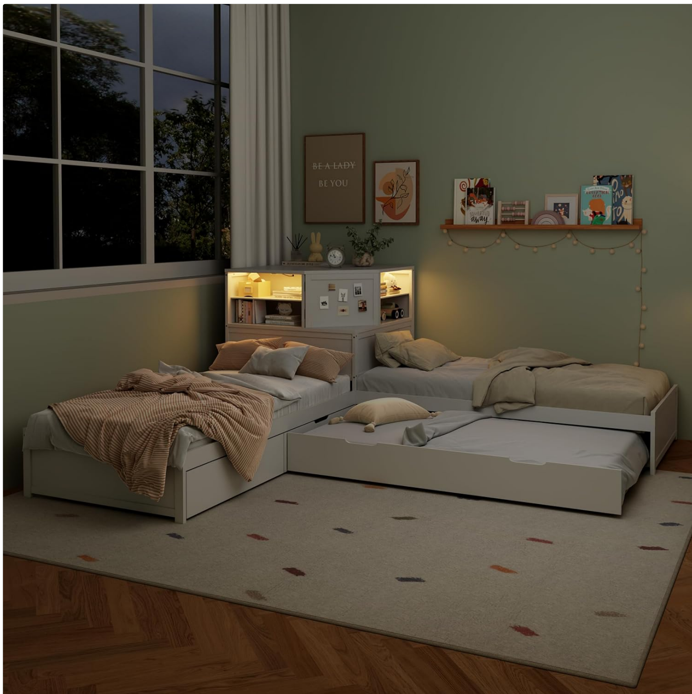
Image: The Linique L-Shaped Twin Bed in a room setting, showcasing its configuration with two twin beds, a pull-out trundle, and integrated storage with LED lighting.