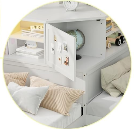
4 open shelves + 1 closed cupboard

The unique corner platform serves as both a nightstand and a functional desk . It provides space for placing your alarm clock, plants, or personal items, and can also be used as a small workspace for reading or studying.