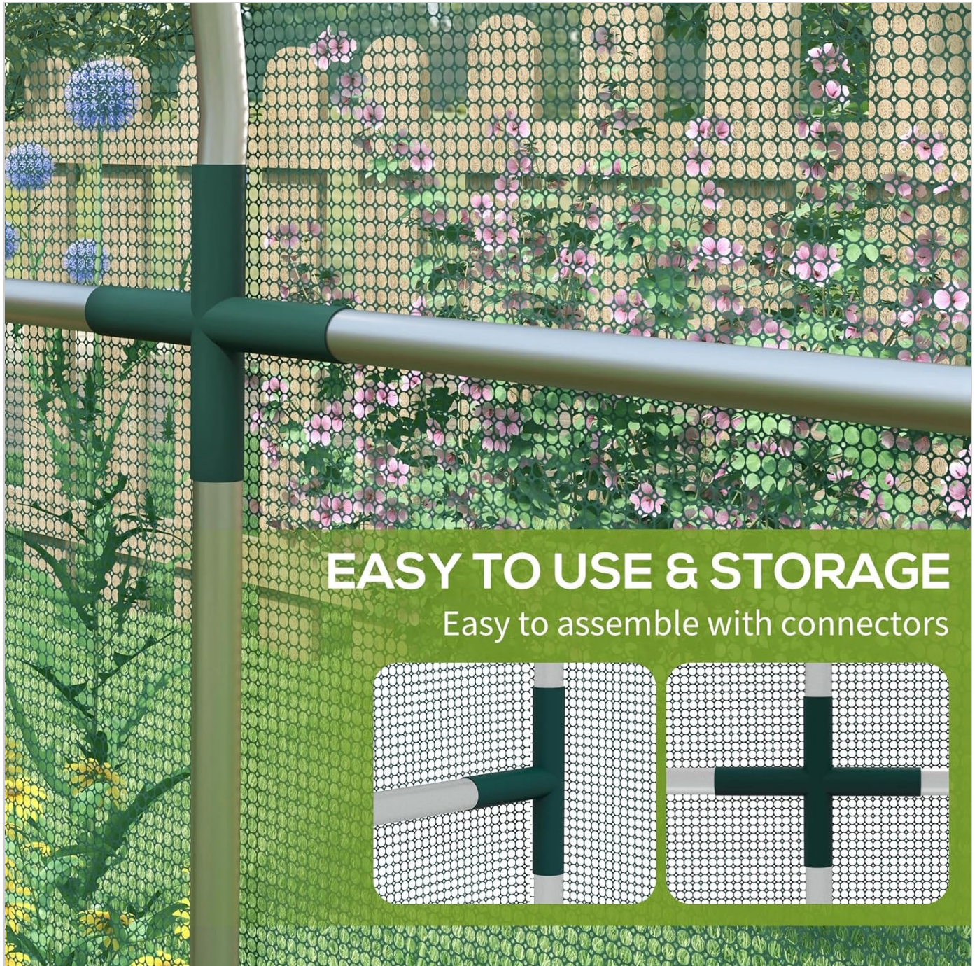
Image: Detail of the frame connectors, illustrating the ease of assembly for the galvanized steel frame.