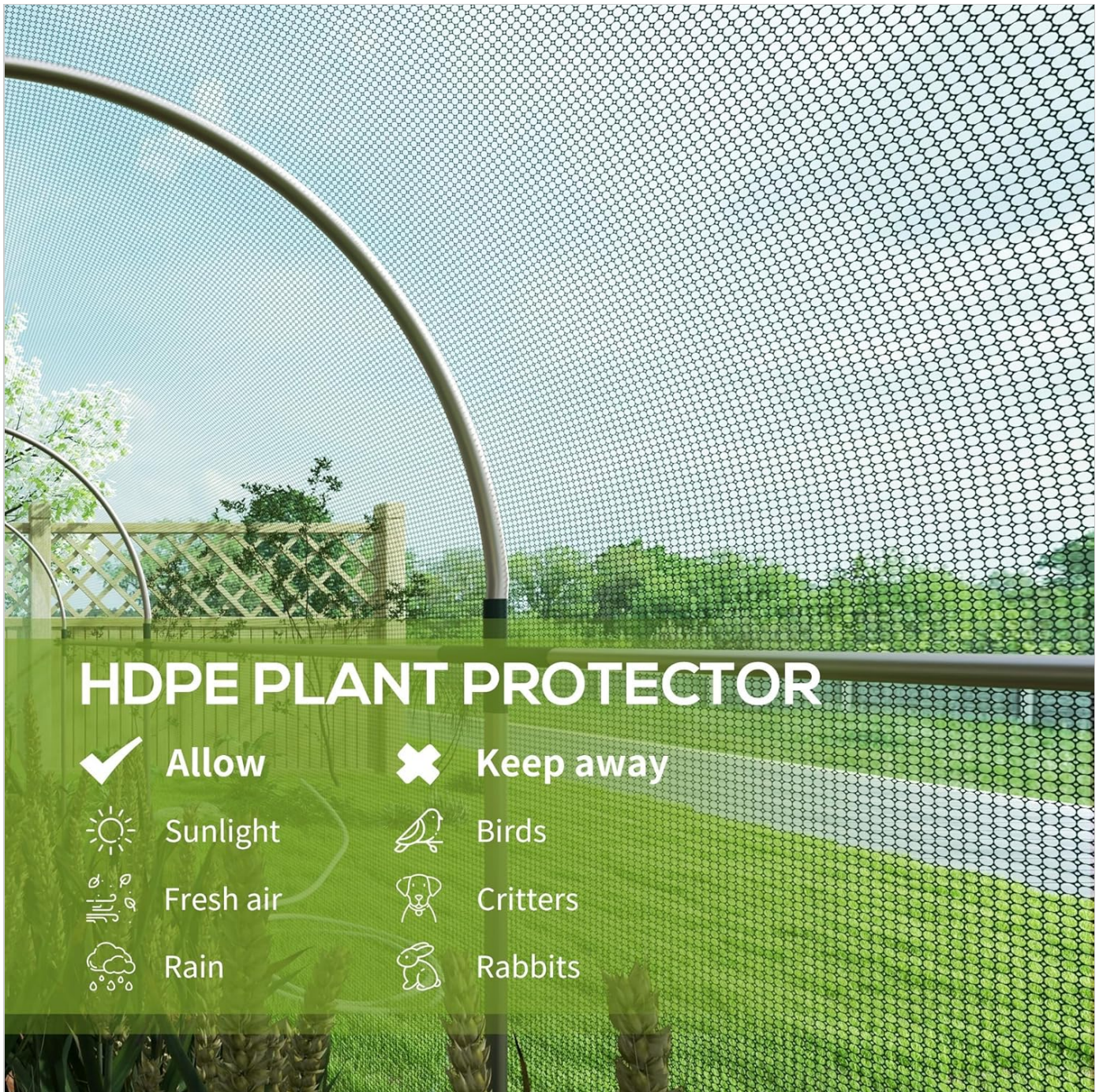
Image: A detailed view of the HDPE plant protector mesh, highlighting its ability to allow sunlight, fresh air, and rain while keeping pests out.