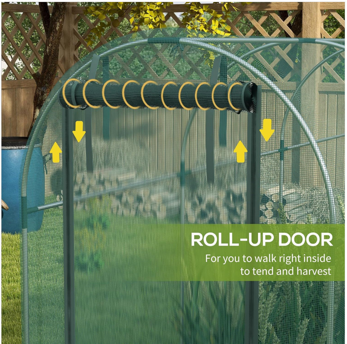
Image: The roll-up zippered door of the crop cage, designed for convenient walk-in access to tend and harvest plants.