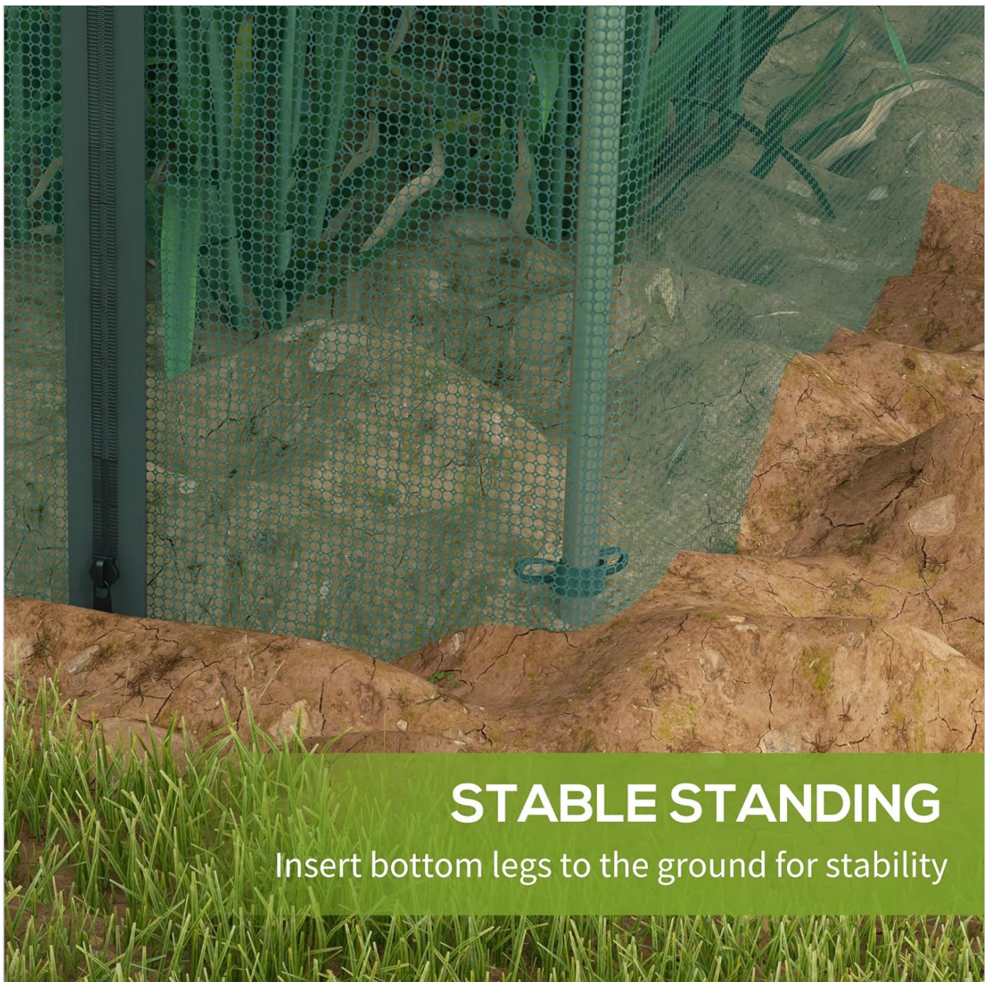
Image: A close-up view showing a crop cage leg inserted into the ground, demonstrating how to achieve stable standing.