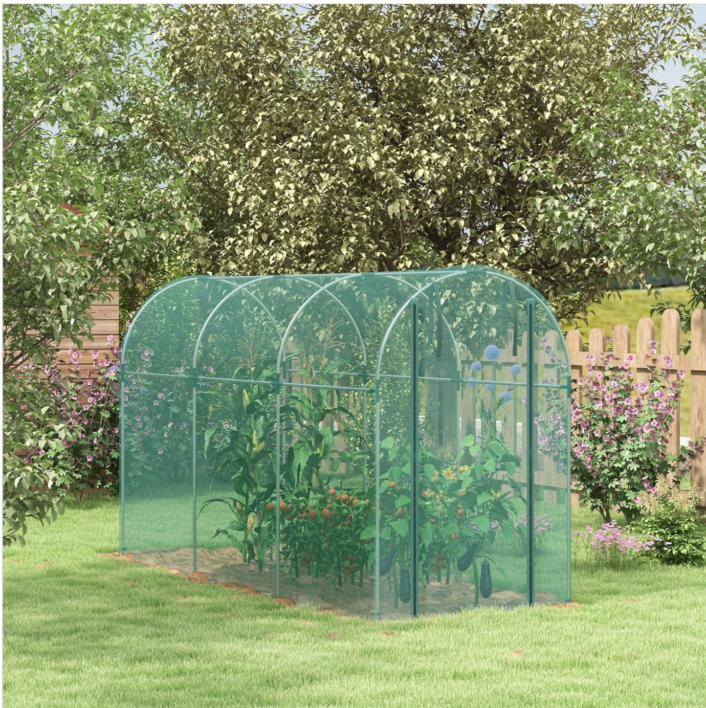
Image: The Outsunny 4' x 12' Crop Cage fully assembled in a garden setting, protecting various plants.