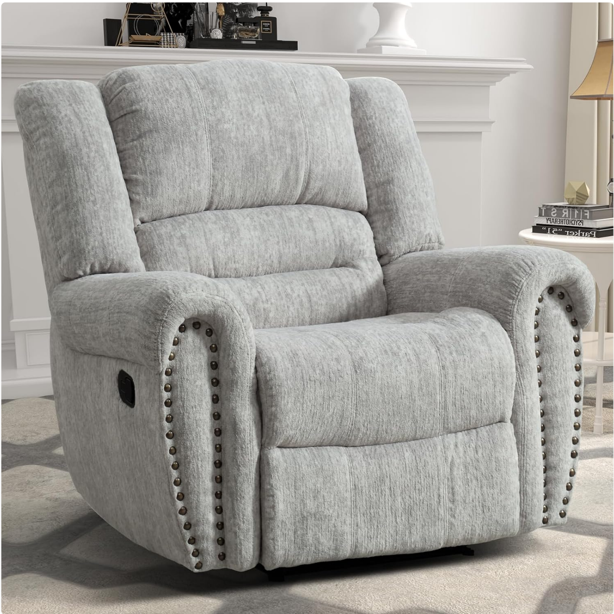
Image Description: A front view of the fully assembled CANMOV Manual Recliner Chair, upholstered in a white-grey fabric, positioned in a living room setting.