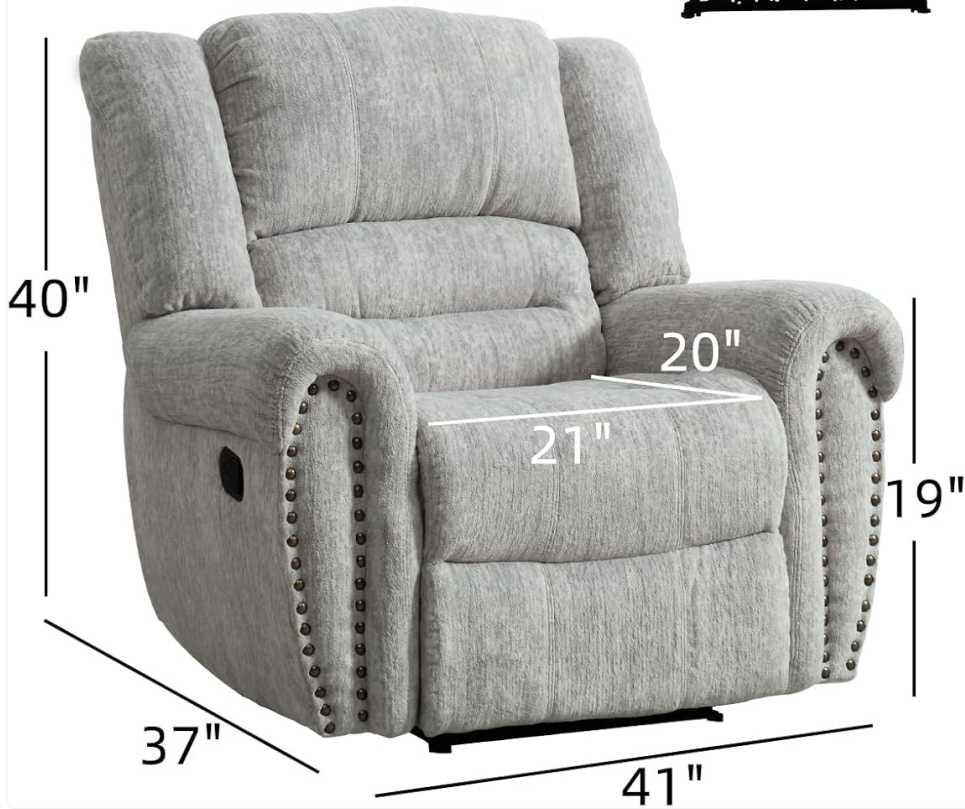
Image Description: A visual representation of the recliner's dimensions, including overall width (41"), depth (37"), height (40"), expanded length (65"), seat width (21"), seat depth (20"), and seat height (19").