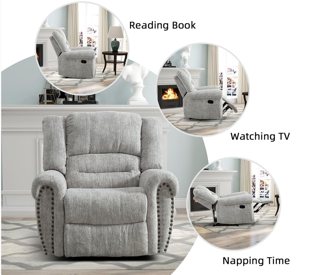
Image Description: A collage of images demonstrating the recliner in various usage positions: upright for reading, partially reclined for watching television, and fully reclined for napping.