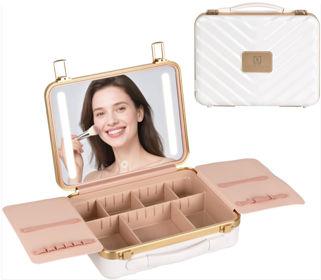
Figure 4.2.1: Organized Interior. The image shows the makeup bag fully open, revealing the LED mirror, organized compartments with various cosmetics, and brush holders on the side flaps.