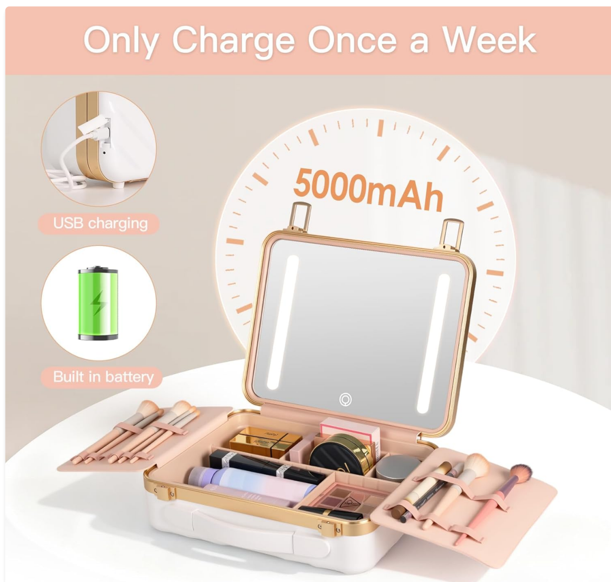
Figure 3.2.1: USB-C Charging Port. The image displays the makeup bag with an arrow pointing to the USB-C charging port, indicating where to connect the charging cable. A battery icon and 'USB charging' text are also visible, illustrating the charging function.

The charging indicator light will illuminate during charging and turn off or change color when fully charged. A full charge provides approximately 30 hours of illumination.