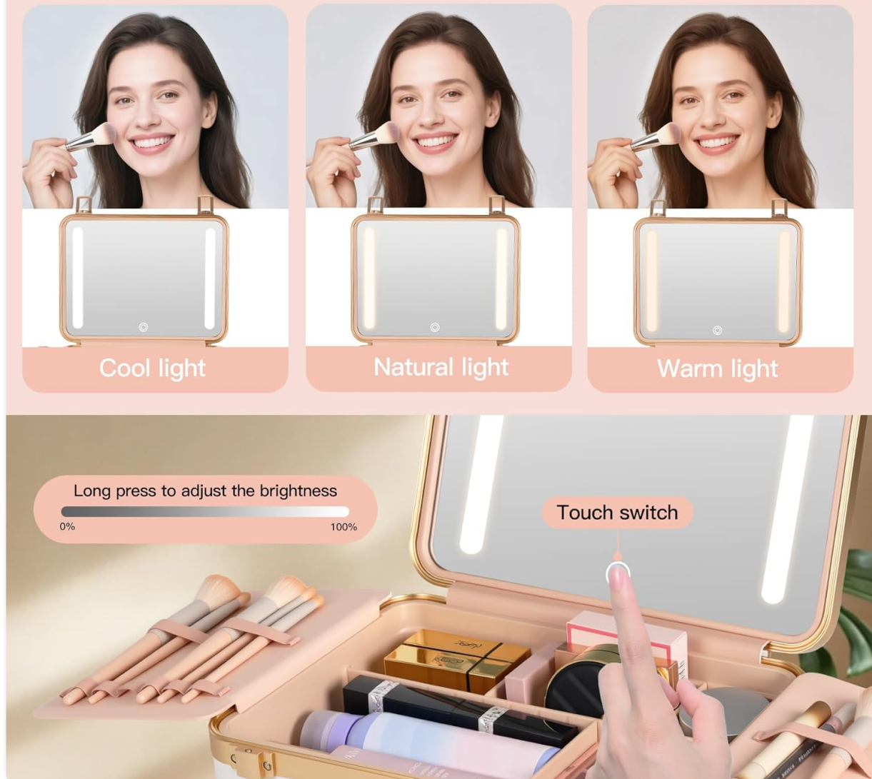
Figure 4.1.1: LED Mirror Functions. This image displays the LED mirror with examples of Cool, Natural, and Warm light modes. It also shows how to long-press the touch switch to adjust brightness and highlights the touch switch location.