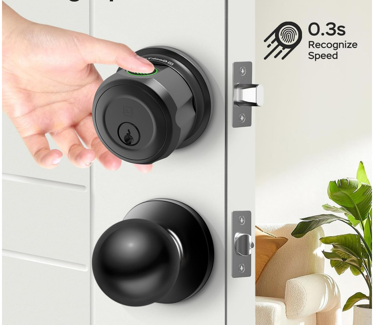
Image: A hand placing a finger on the deadbolt's sensor, demonstrating the quick fingerprint unlock feature with a 0.3-second recognition speed.