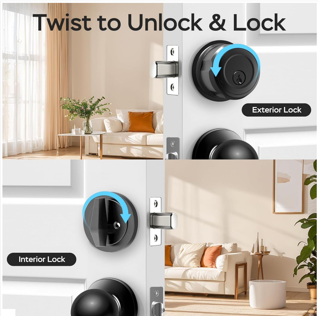
Image: A split image showing the exterior knob being twisted to unlock and the interior panel being twisted to lock the door, highlighting the intuitive mechanism.