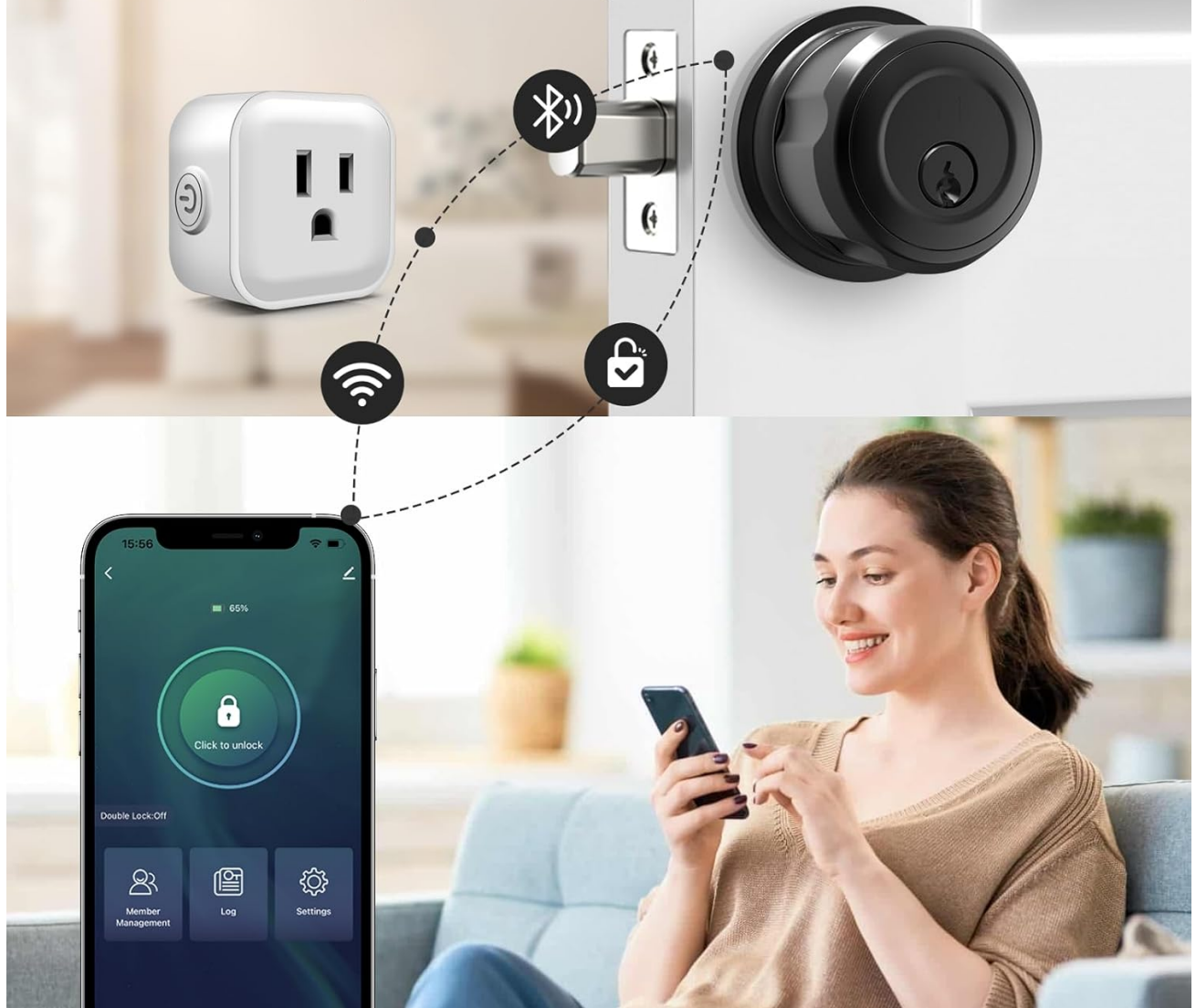
Image: A diagram illustrating the connection between the smart deadbolt, a gateway device (plugged into an outlet), and a smartphone, enabling remote unlocking and control.