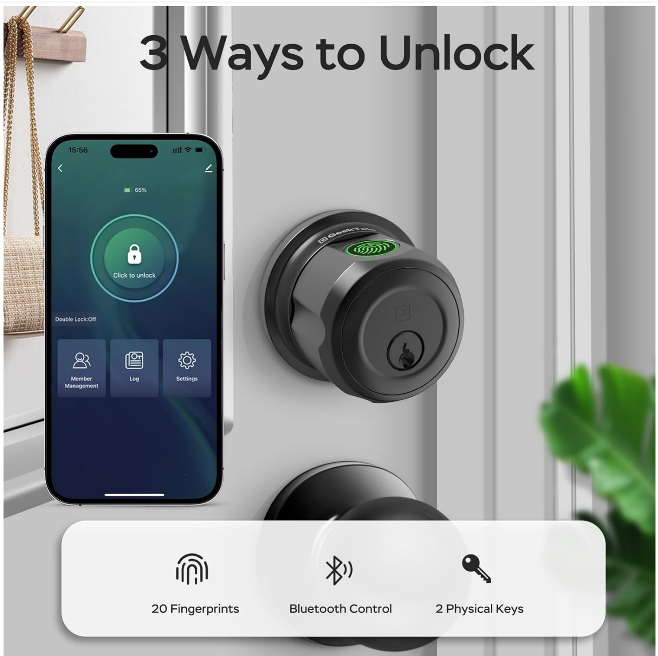
Image: A visual guide showing the three primary methods to unlock the deadbolt: fingerprint recognition (up to 20 fingerprints), Bluetooth control via the app, and traditional physical keys.