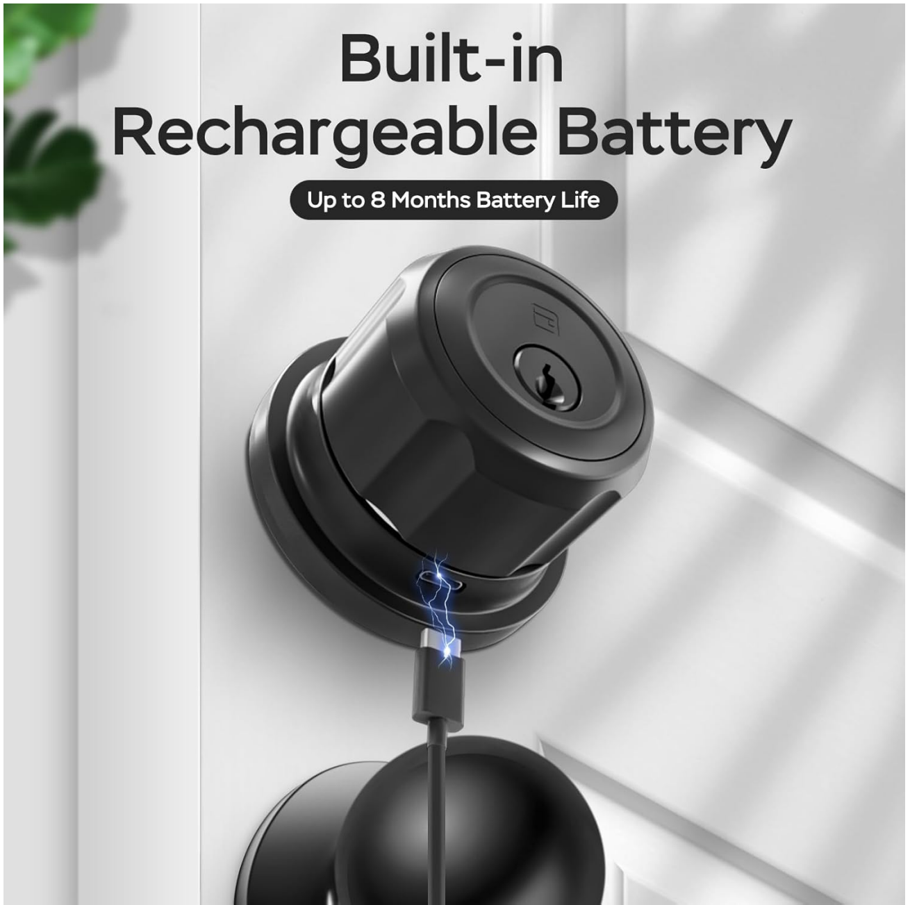
Image: The GeekTale deadbolt connected to a USB-C charging cable, illustrating the built-in rechargeable battery feature.