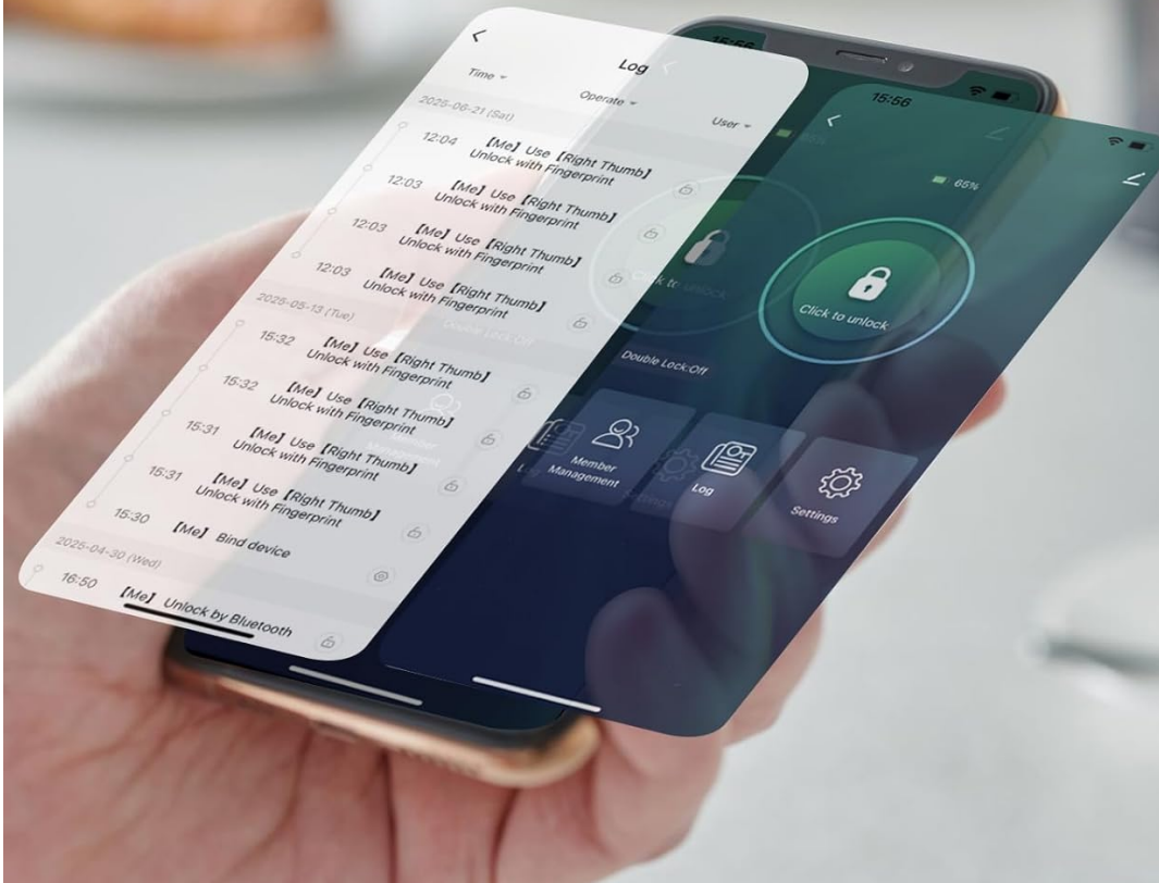
Image: A smartphone displaying the lock's mobile app interface, which allows users to manage access, view historical logs, and receive low battery alerts.