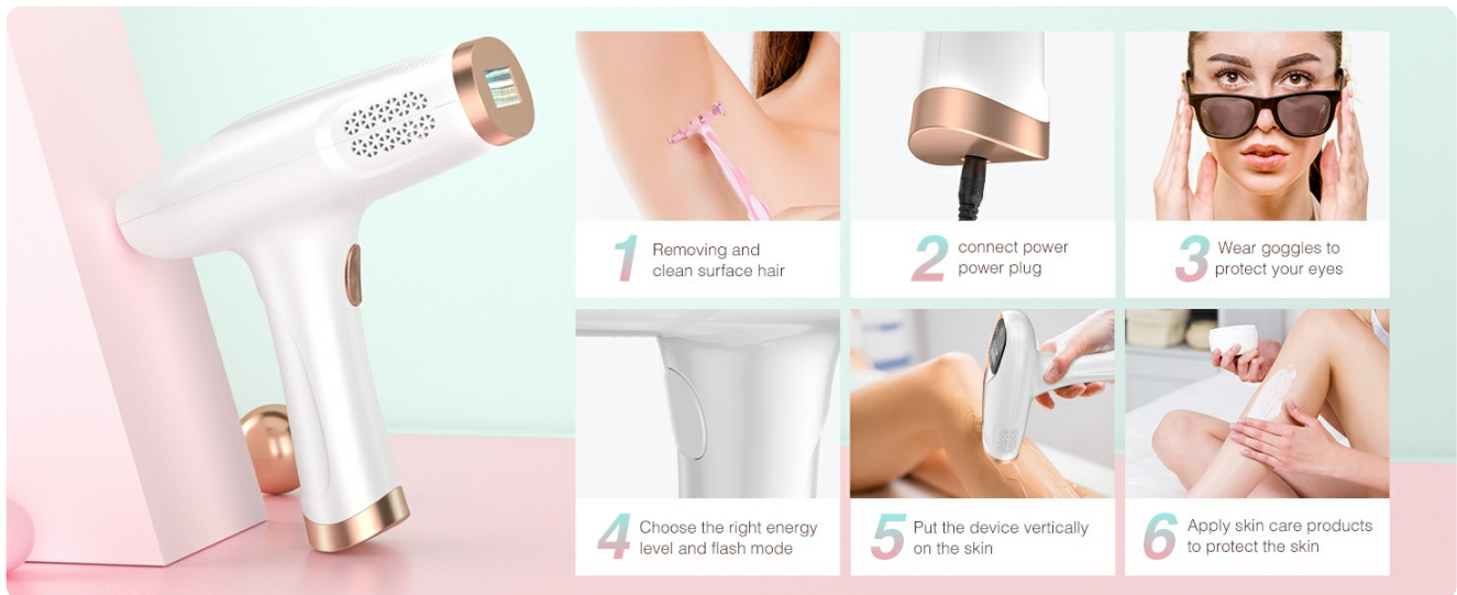
Key steps for safe and effective use of the IPL device.