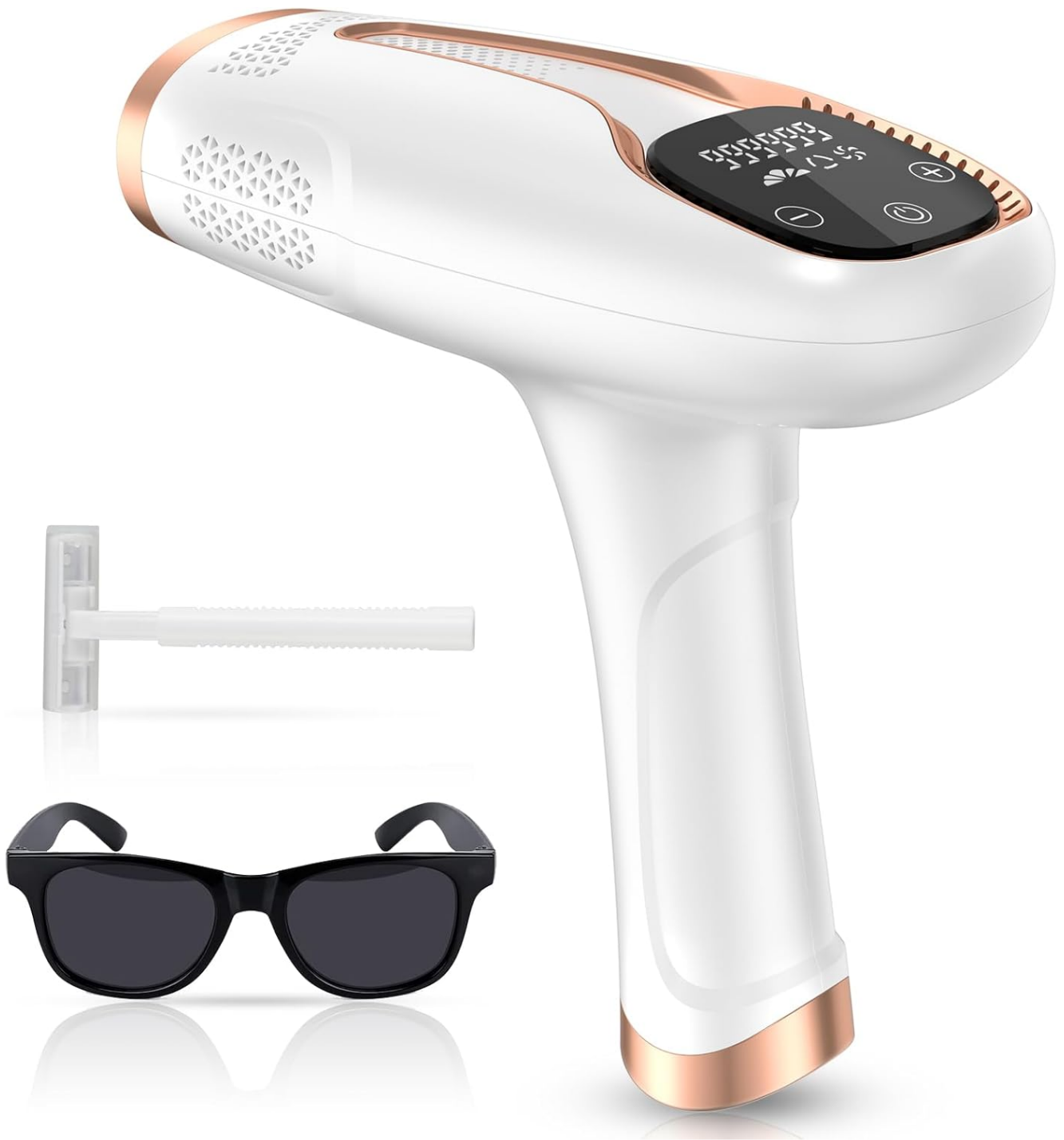
The TYHGSF IPL Laser Hair Removal Device, shown with included protective glasses and a razor.