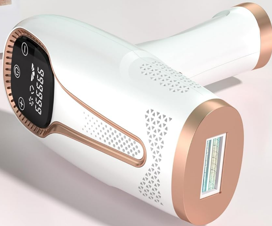
Overview of the IPL device's core features.