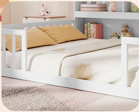
Wide Entrance for Easy Access