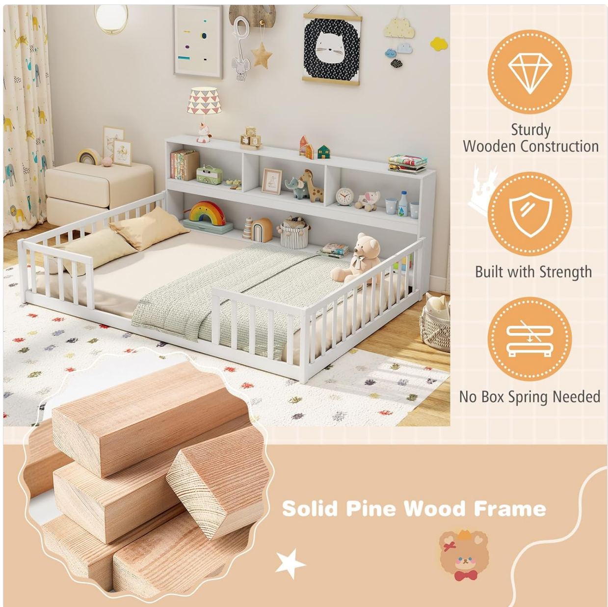
Figure 3: Illustration of the solid pine wood frame construction.