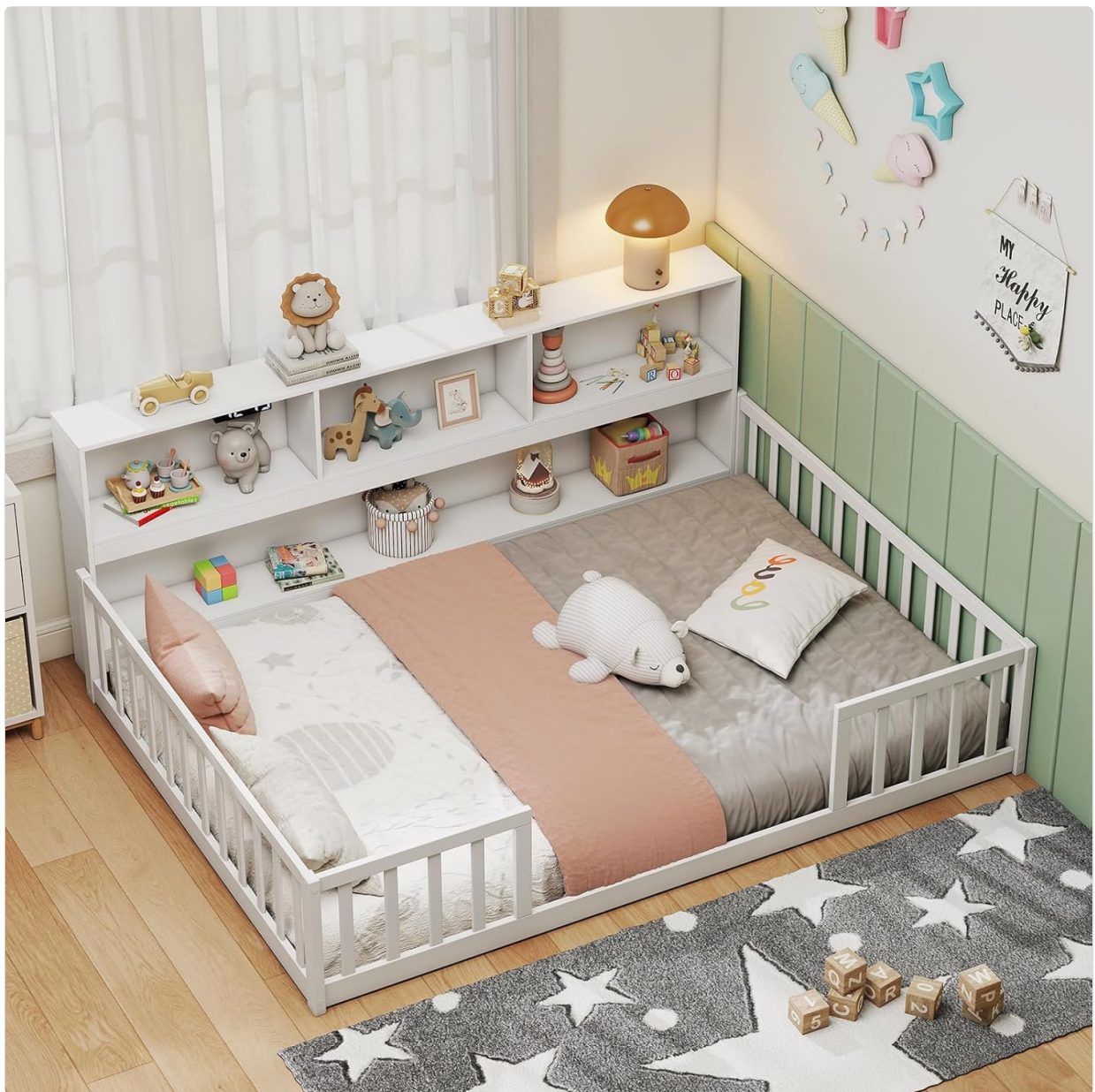
Figure 1: Overview of the Giantex Full Size Montessori Floor Bed.