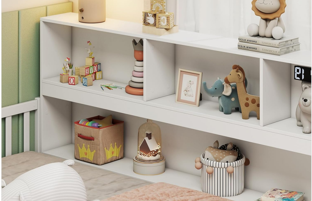
Figure 5: Close-up of the integrated bookshelf providing storage and display space.