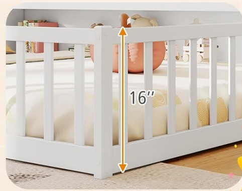
Fence Rails for Added Security