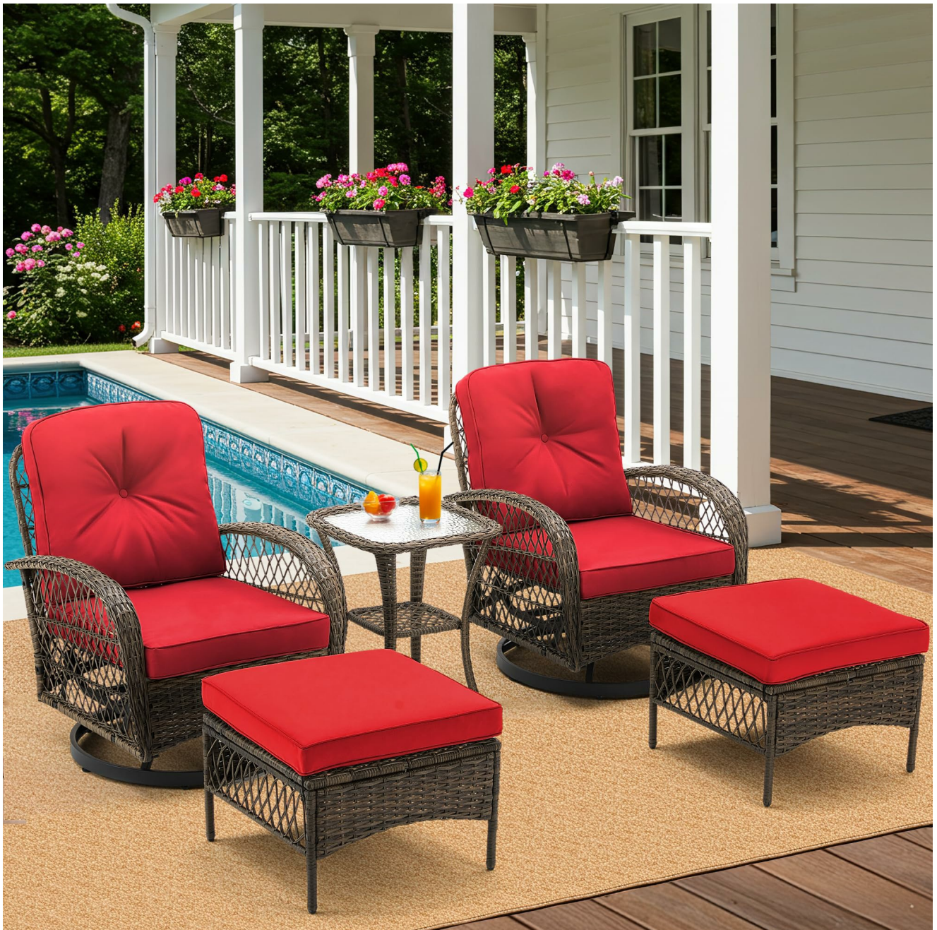
Image: The complete MELLCOM 5-Piece Patio Furniture Set, featuring two swivel rocking chairs, two ottomans, and a glass coffee table, all in a wine red color with brown wicker.