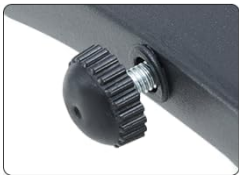
Adjustable Sofa Feet