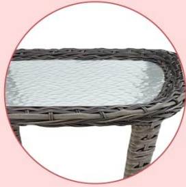
Tempered glass tabletop