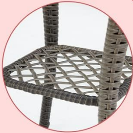
Extra storage shelf