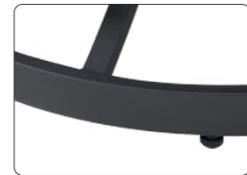
Stainless Steel Frames

Image: Detailed view of the product features, including anti-rust screws, high-quality hand-woven PE rattan, soft curved armrests, adjustable sofa feet, and stainless steel frames.