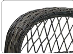
Soft Curved Armrest