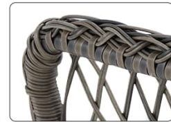
Hand-woven PE Rattan