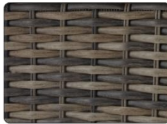
High Quality Wicker