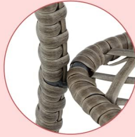
Sturdy steel frame