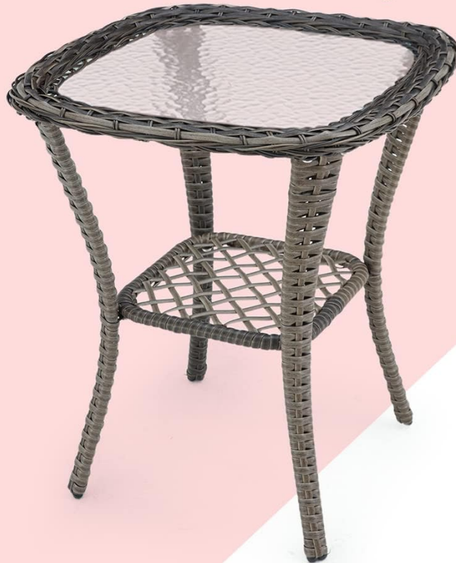
Image: Close-up details of the coffee table, showcasing its tempered glass tabletop, sturdy steel frame, anti-slip frosted glass, and an extra storage shelf.

Your browser does not support the video tag.