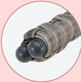
Anti-slip table feet