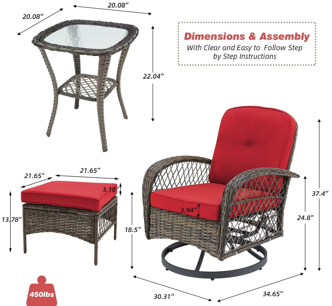
Image: A diagram illustrating the dimensions of the rocking chair, ottoman, and coffee table, along with a note about easy assembly with clear instructions.