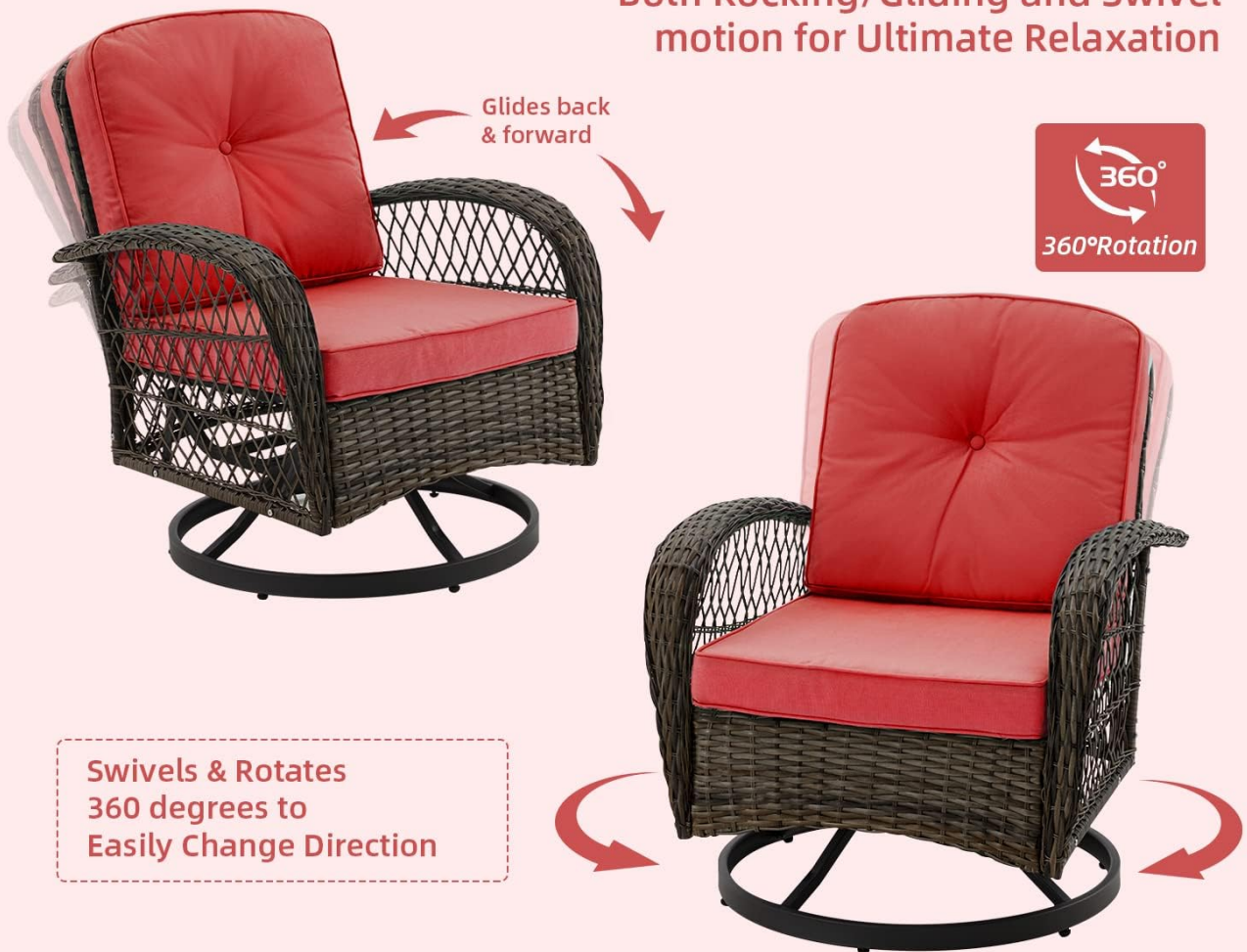
Image: A visual representation of the chair's ability to glide back and forth and swivel 360 degrees, highlighting its dual functionality.

Added Functionality of Both Rocking/Gliding and Swivel motion for Ultimate Relaxation