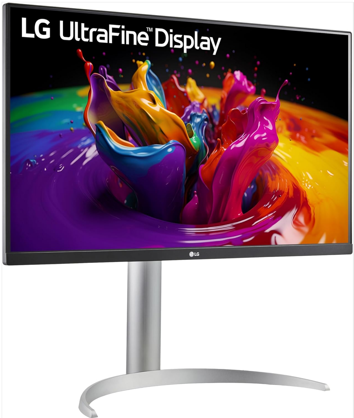
Side view of the LG 27UP850K-W monitor, illustrating its slim profile and stand.