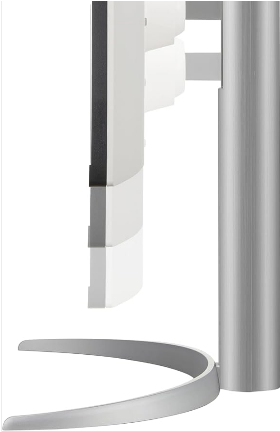
Side view of the monitor demonstrating the tilt adjustment capability of the stand.