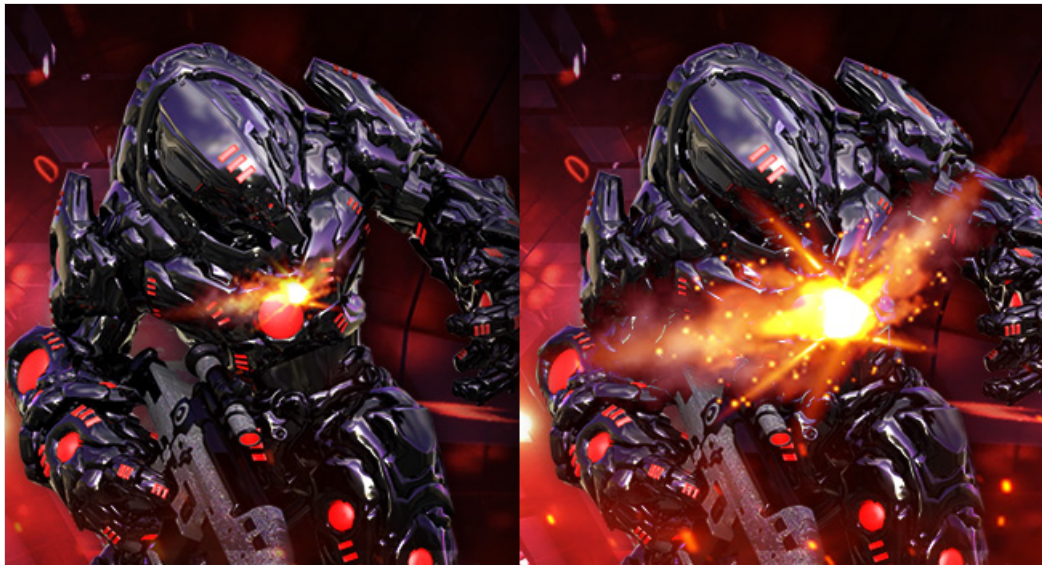
Comparison image demonstrating the effect of Black Stabilizer, making dark areas more visible in games.