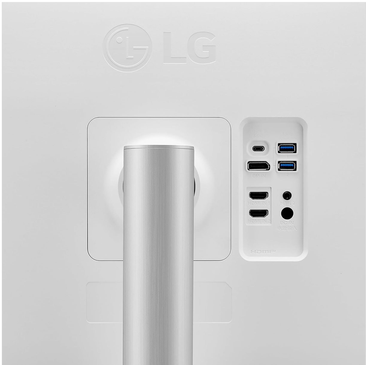
Close-up view of the monitor's input and output ports, including USB-C, DisplayPort, HDMI, and USB 3.0.