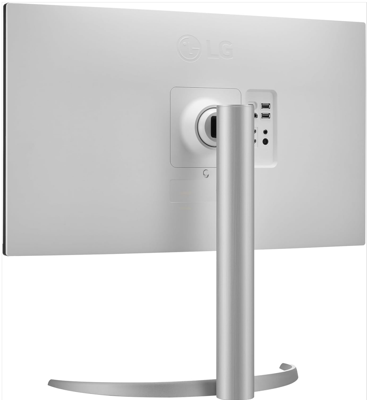
Illustrations showing the monitor's ability to adjust height and pivot for vertical orientation.