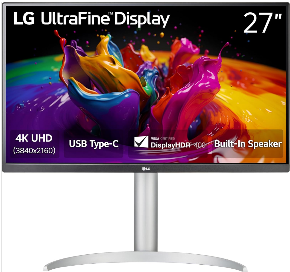
Front view of the LG 27UP850K-W 27-inch Ultrafine 4K UHD Monitor.