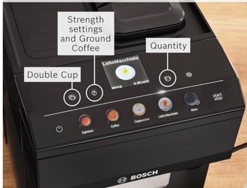
Figure 4: Adjusting coffee strength, quantity, and selecting double cup via the control panel.