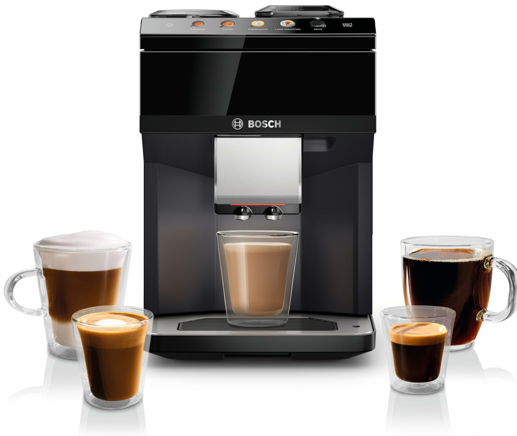
Figure 1: Bosch 500 Series VeroCafe Espresso Machine with key dimensions and components labeled.

Video 1: An overview of the Bosch TPU40109 500 Series Fully Automatic Espresso Machine, highlighting its design and key functionalities.