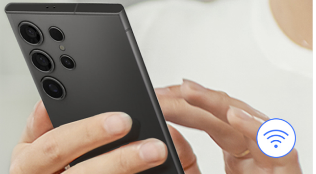
Image: Smartphone showing the SmartThings app interface for controlling the refrigerator.

Convenience at your fingertips: Monitor and control your refrigerator, anywhere anytime.