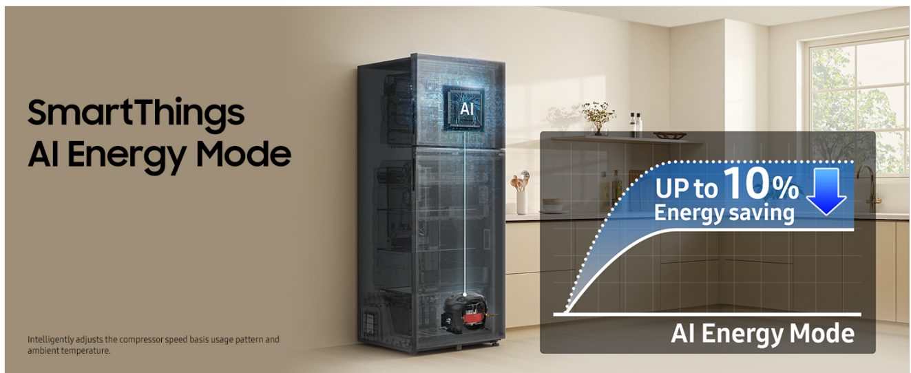
Image: Illustration of AI Energy Mode functionality and energy savings.

Activate AI Energy Mode via the SmartThings app to optimize energy consumption. This mode monitors your usage patterns and intelligently adjusts the compressor speed and freezer temperature to save up to 10% energy.