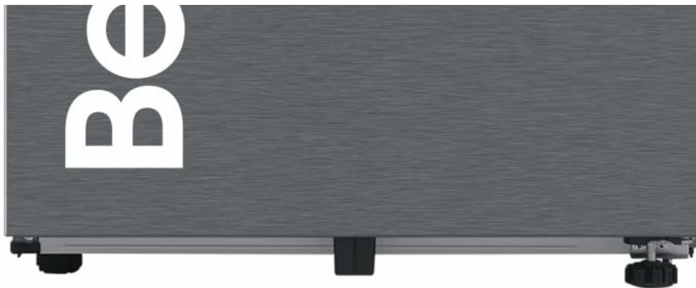
Image: Refrigerator dimensions, energy label, and easy clean back feature.