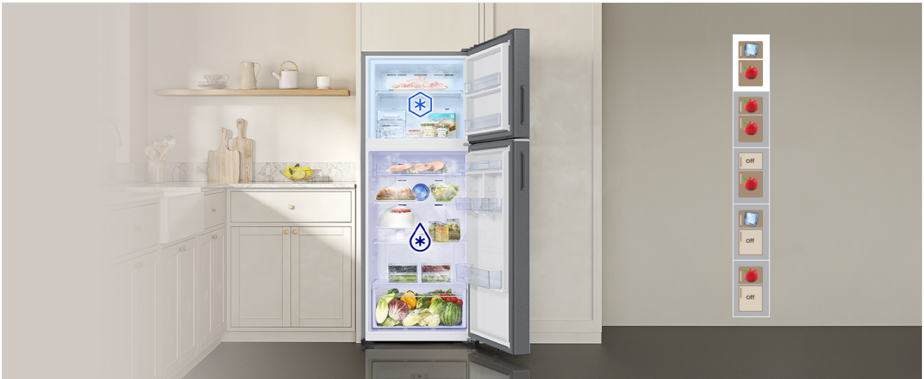
Image: Visual representation of the 5-in-1 Convertible modes.