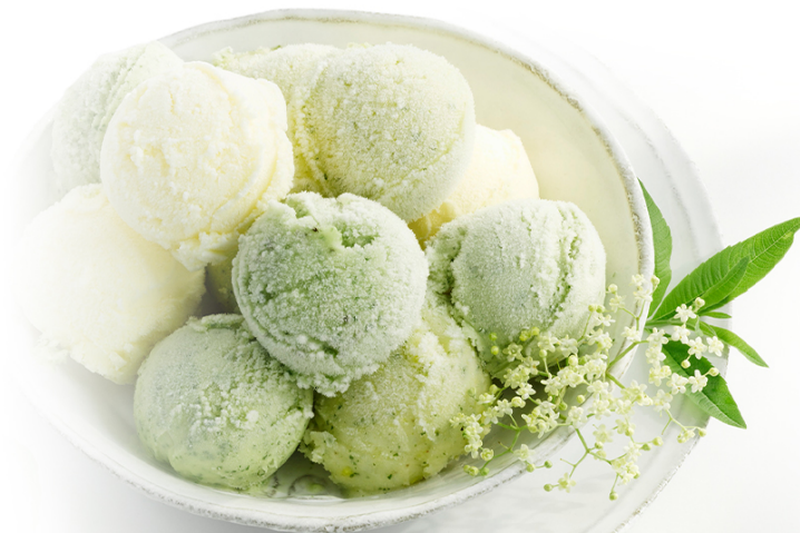
Image: Power Freeze feature for faster ice making.