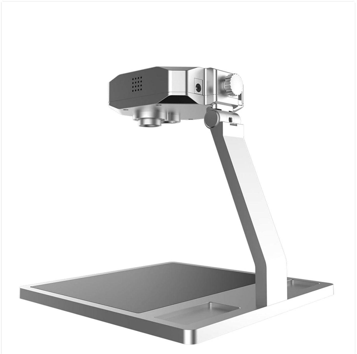
Figure 1: LAUREII ShortCam Thermal Imaging Analyzer AD11.