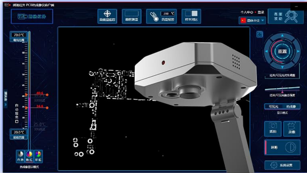
Figure 4: Dual Vision Imaging for Instant Diagnosis of Leakage, showing the software interface with a PCB view.