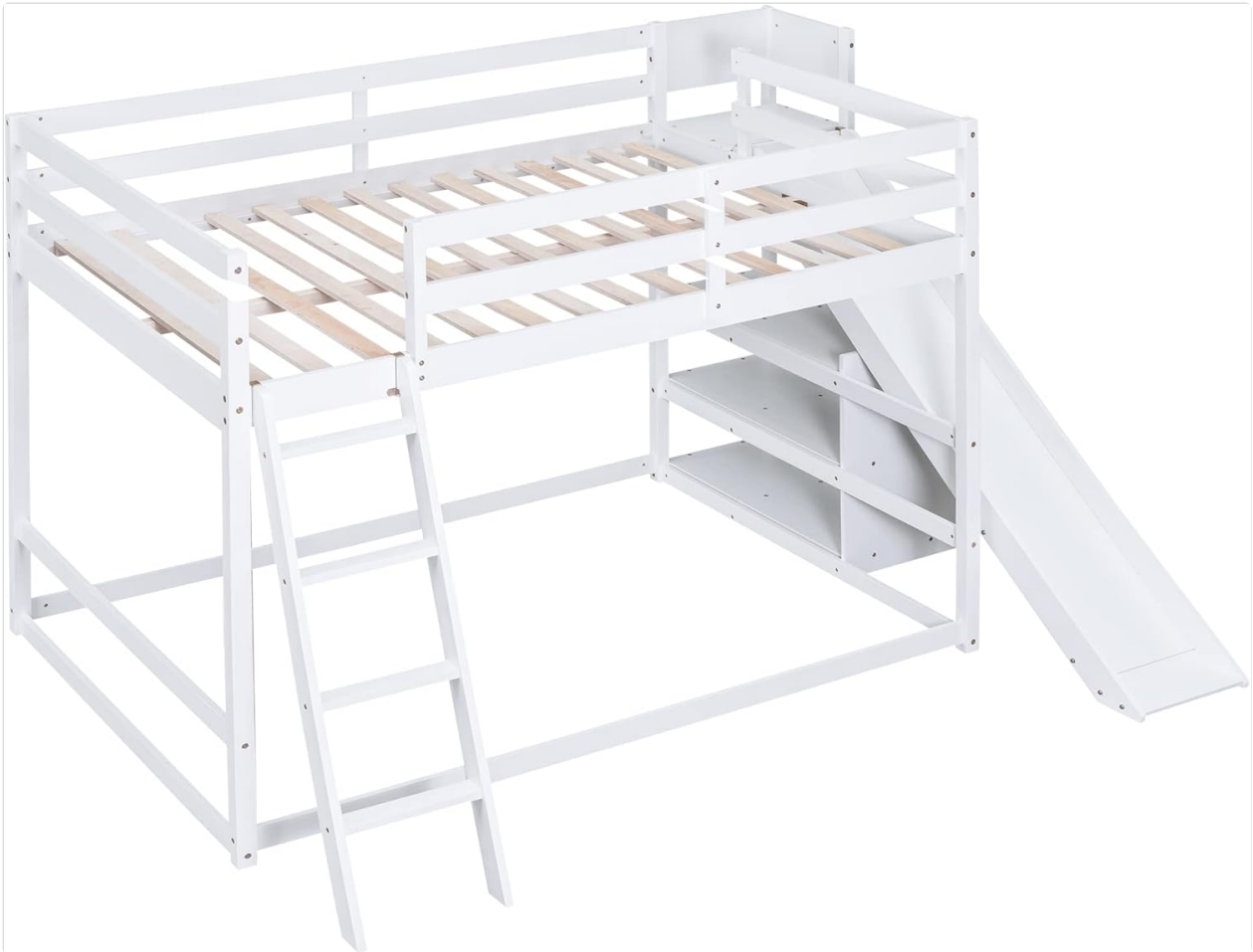
Image: Overview of the bunk bed frame, showing the upper and lower bunks, ladder, slide, and integrated storage shelves.