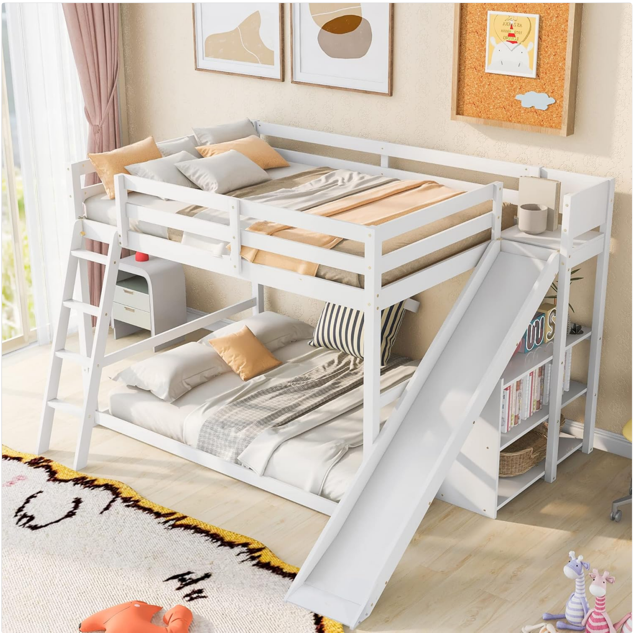
Image: The assembled bunk bed in a room setting, demonstrating its use with bedding and accessories.