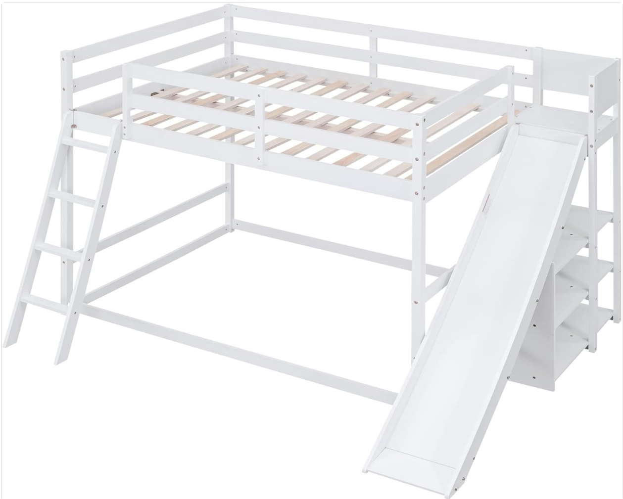
Image: Another view of the bunk bed frame, highlighting the slide and ladder attachment points.