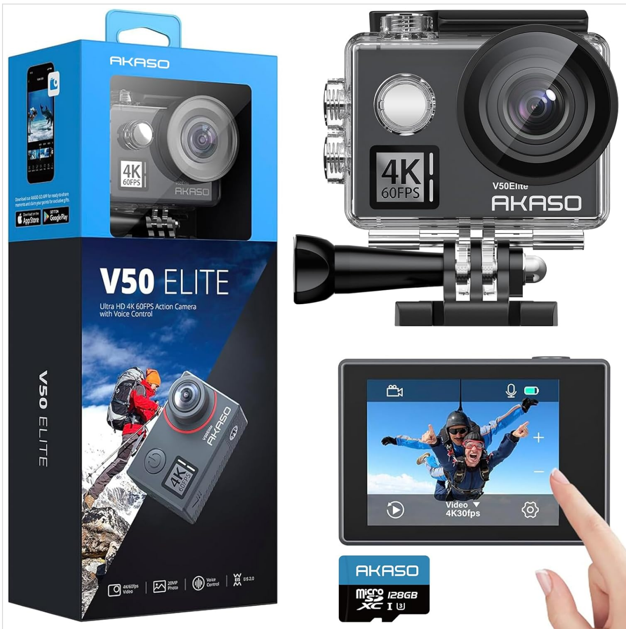
Figure 1: AKASO V50 Elite Action Camera and included components.