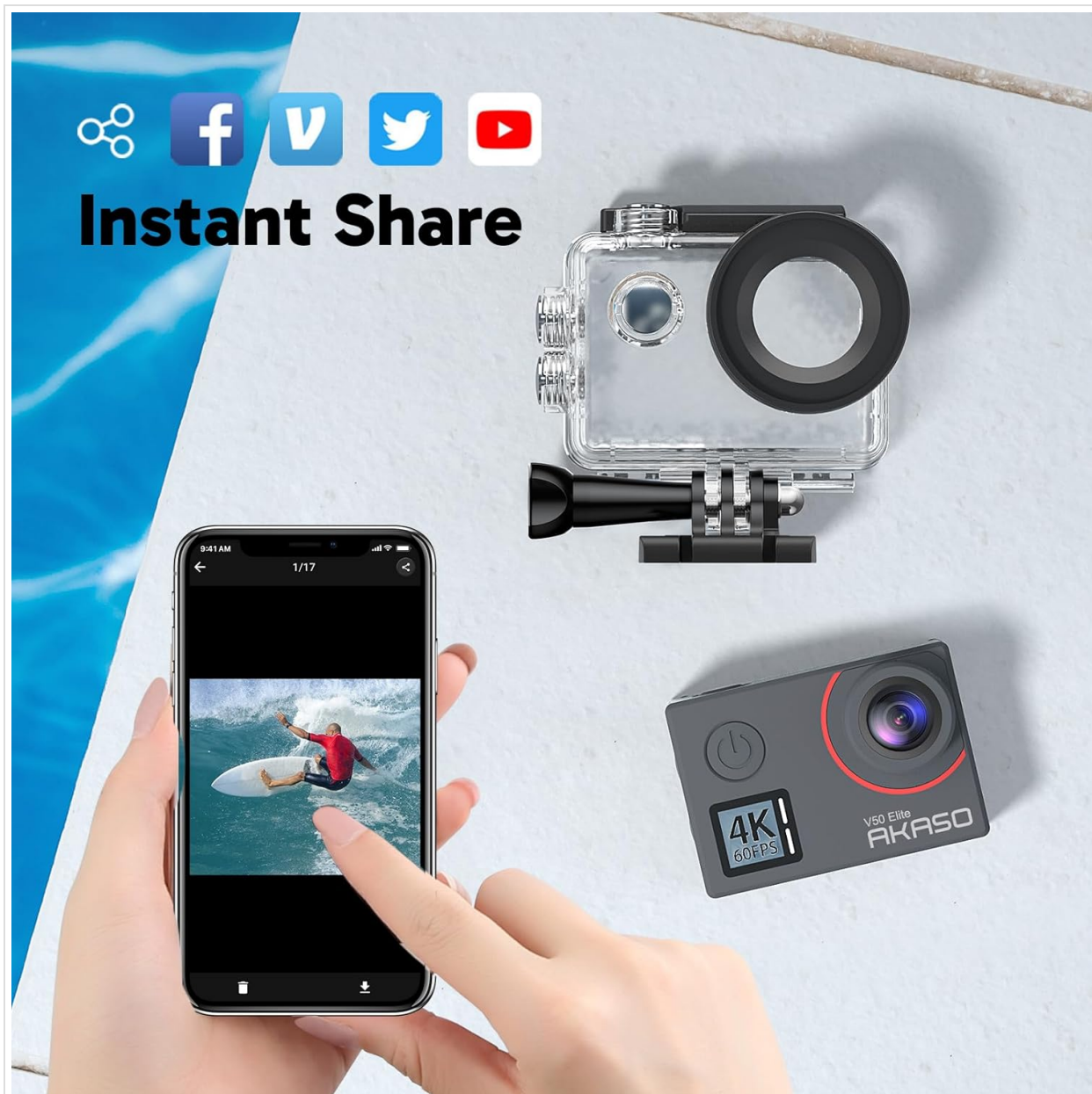
Figure 8: Seamless sharing of content directly from the camera via the mobile app.