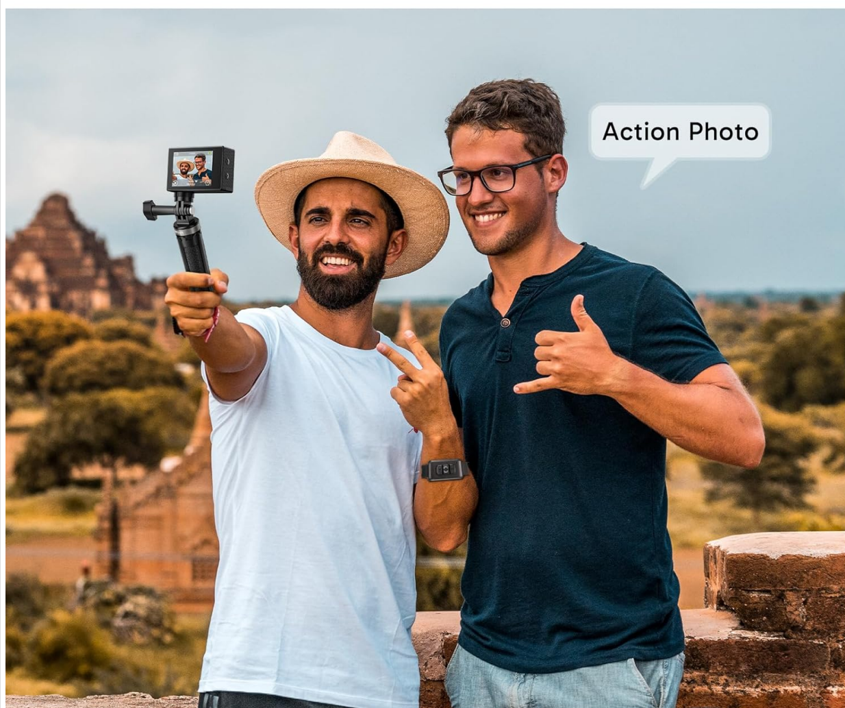
Figure 5: Hands-free operation with voice commands for photo and video capture.

Control your V50 Elite hands-free with voice commands