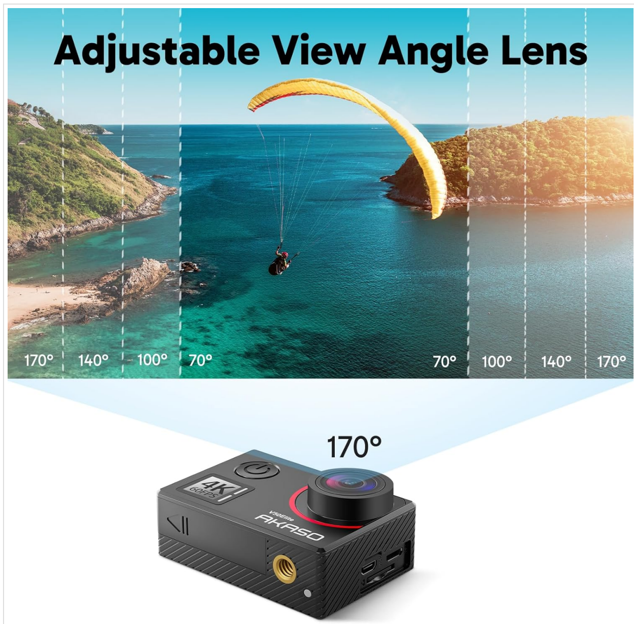
Figure 7: The camera offers multiple field-of-view options for diverse shooting scenarios.