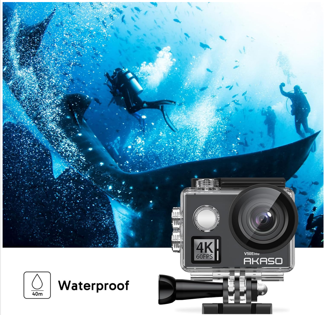
Figure 3: The AKASO V50 Elite in its waterproof housing, suitable for underwater activities.

submerging it for 30 minutes. If the tissue remains dry, the case is ready for use. Ensure the camera is securely placed inside the case and all latches are firmly closed before submerging.