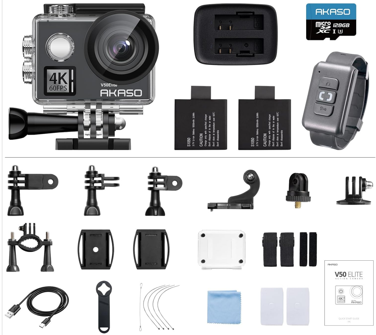
Figure 2: Detailed view of all accessories and the camera included in the package.