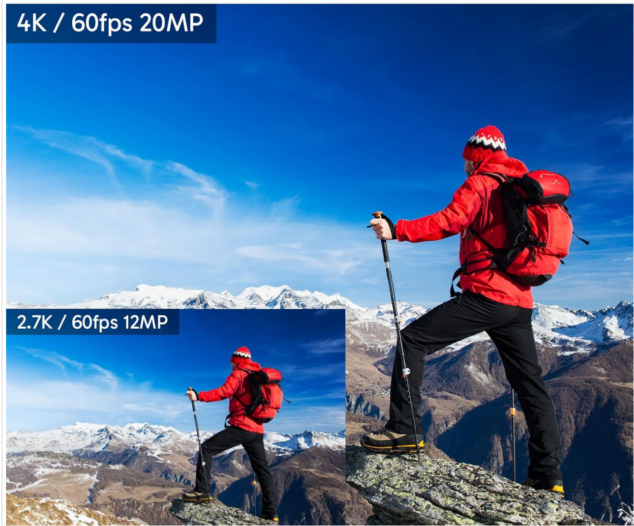
Figure 4: The camera supports native 4K 60fps video recording for sharp and clear footage.