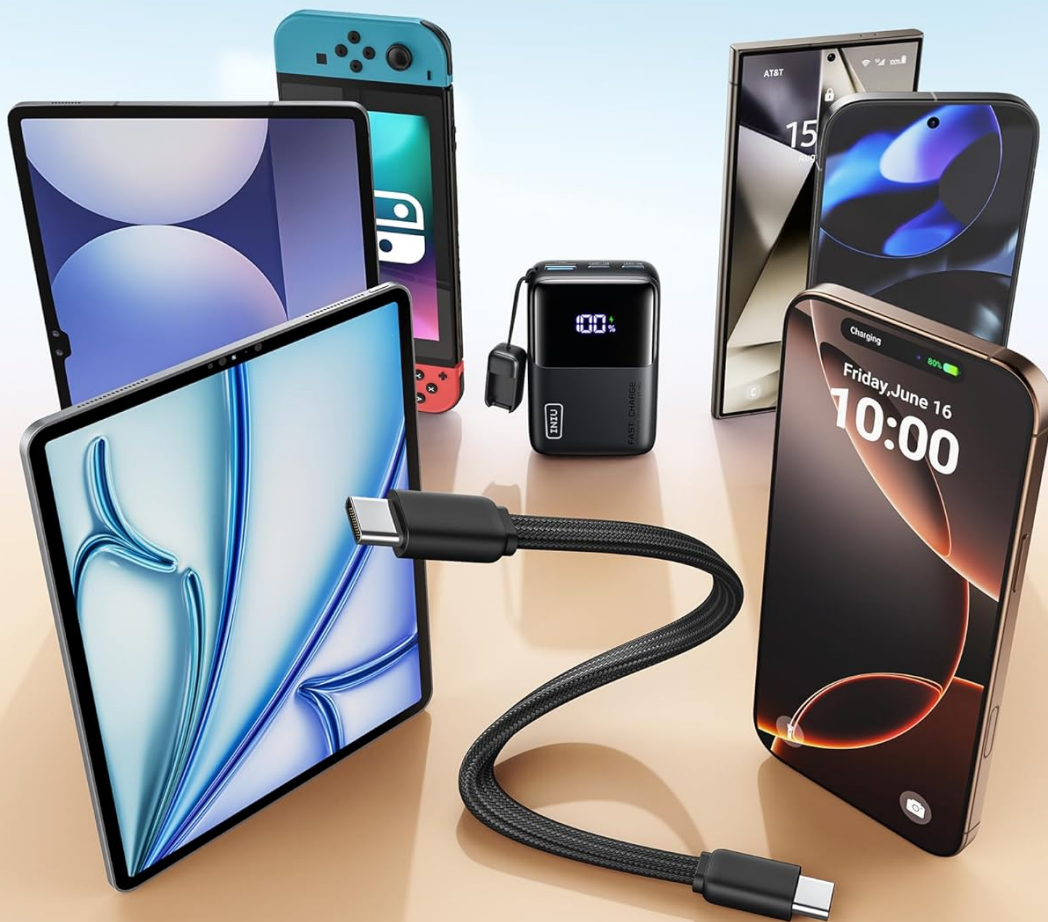
Figure 4.1: The detachable lanyard USB-C cable in use with various devices.