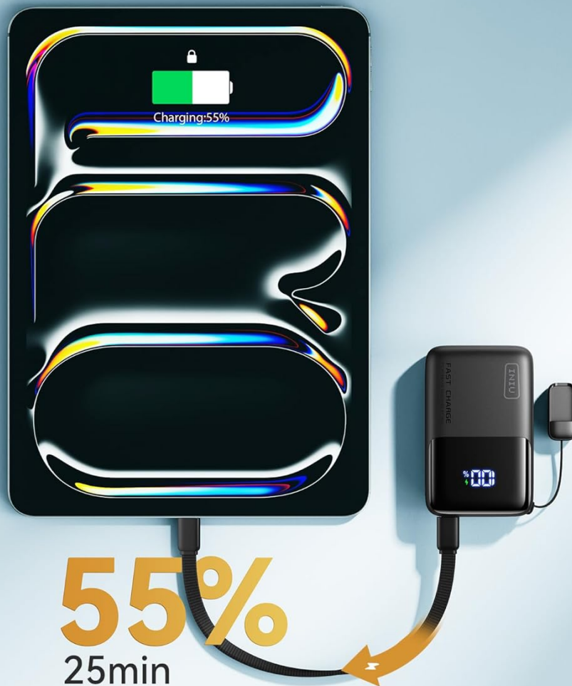
Figure 2.3: The power bank charging an iPad Pro to 55% in 25 minutes.