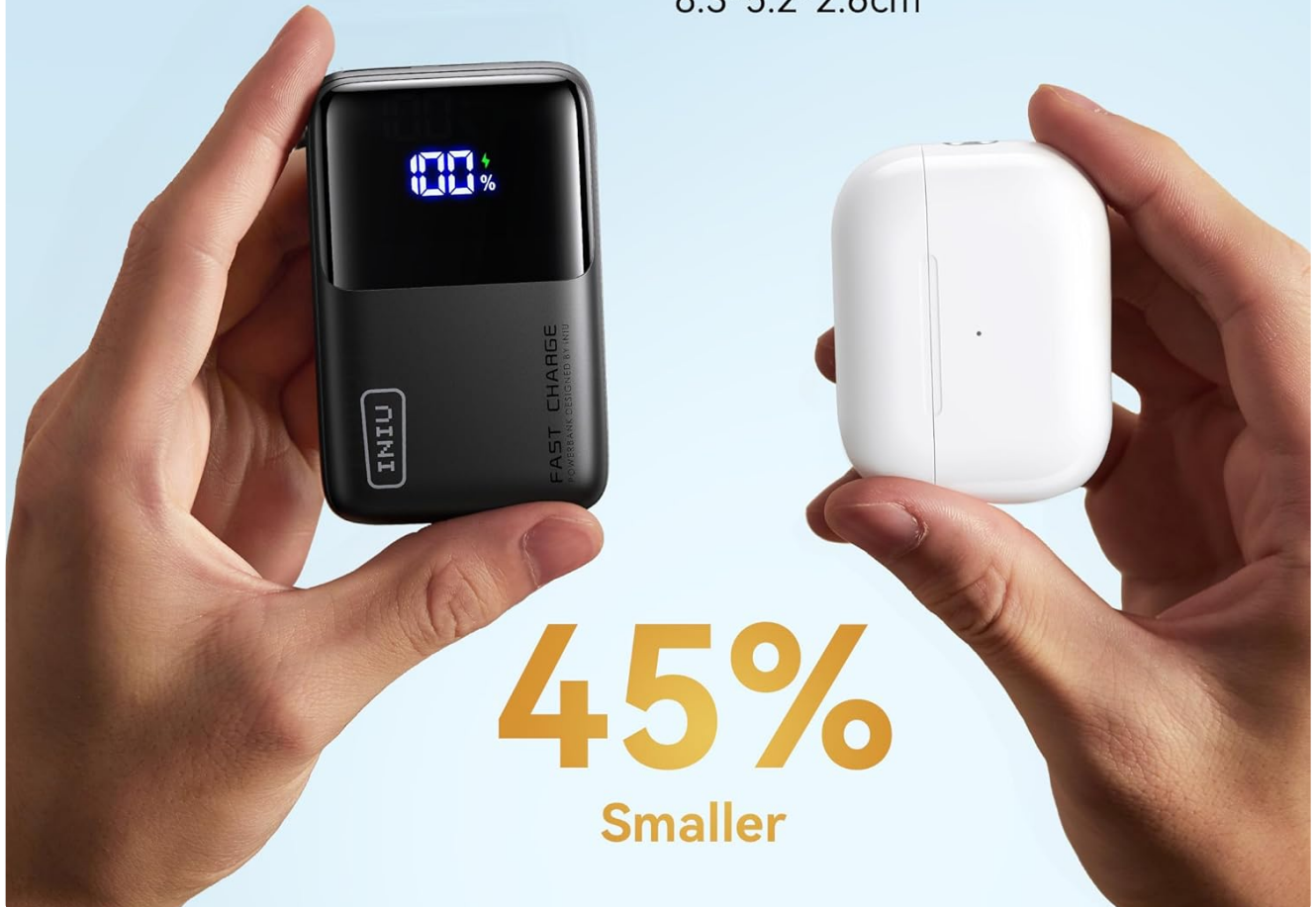
Figure 2.1: The INIU Power Bank P50's compact size, comparable to AirPods Pro.