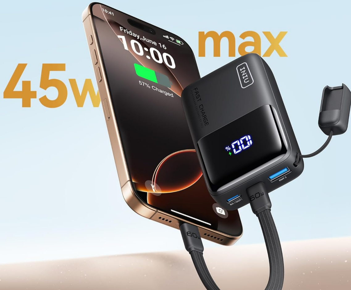
Figure 2.2: Illustrates the 45W full-speed charging capability for iPhone 16 and Samsung S24.