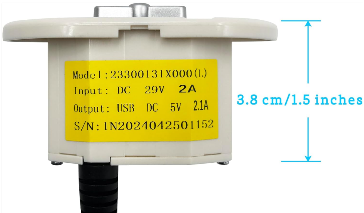
Figure 2.1: Overview of the Kariwust 5-Button Power Recliner Hand Control, showing the control unit, USB port, and attached cables.