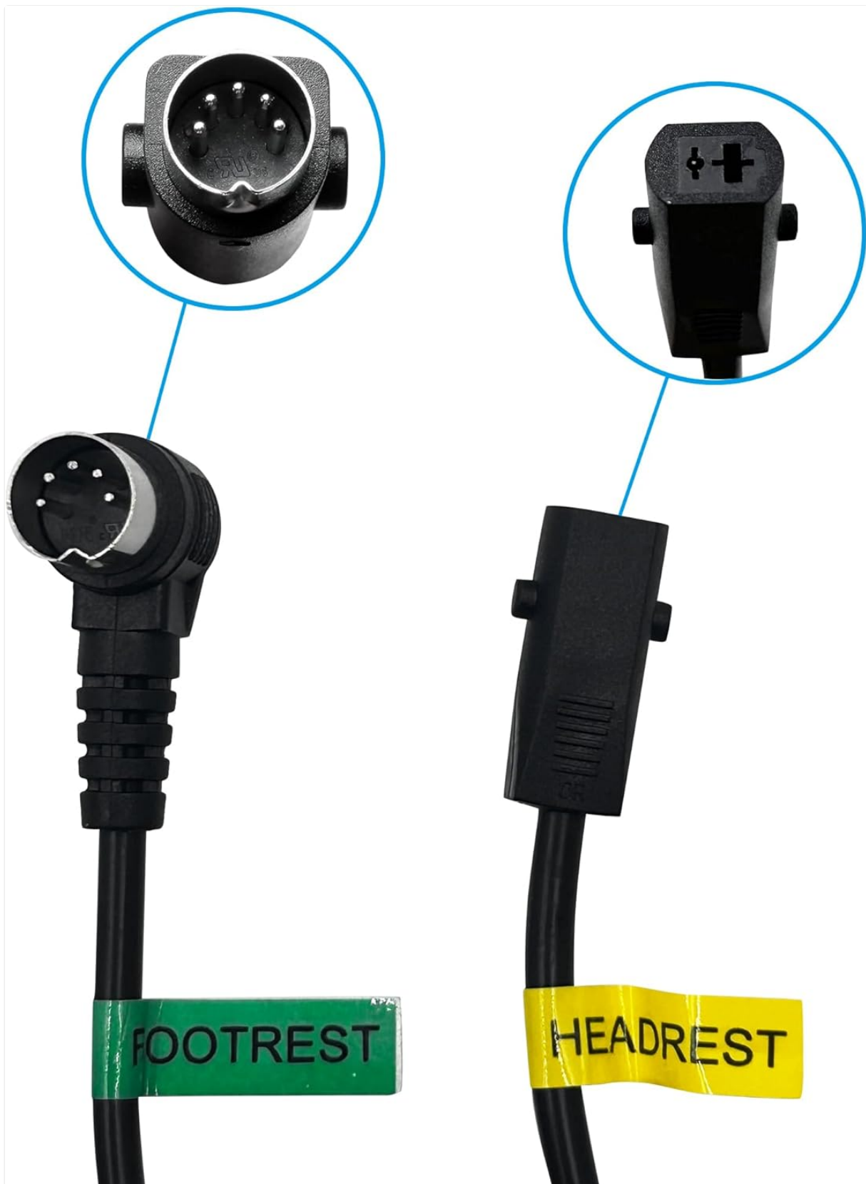
Figure 3.1: Detailed view of the 5-pin (footrest) and 2-pin (headrest) connectors. Ensure these match your recliner's existing connections.