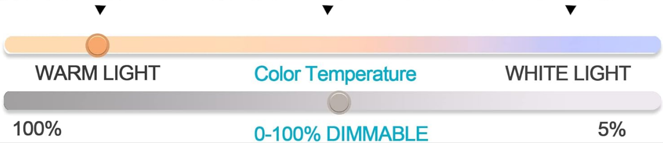
Image: Illustration demonstrating the adjustable color temperature settings (Warm, Neutral, Cool) of the fan's LED light.