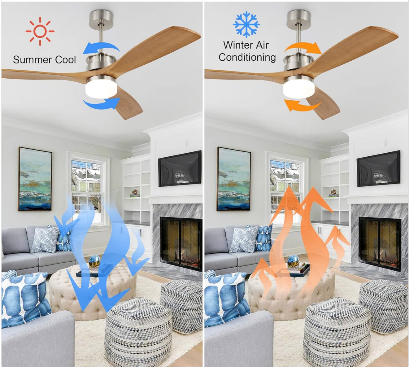
Image: Visual explanation of the fan's dual-use functionality, showing downward airflow for summer cooling and upward airflow for winter air circulation.