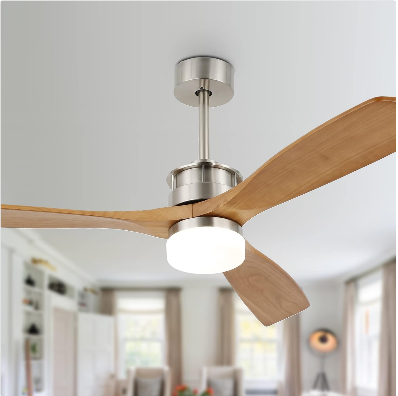
Image: The Bella Depot 52 Inch Wood Ceiling Fan, showcasing its light wood blades and integrated LED light.