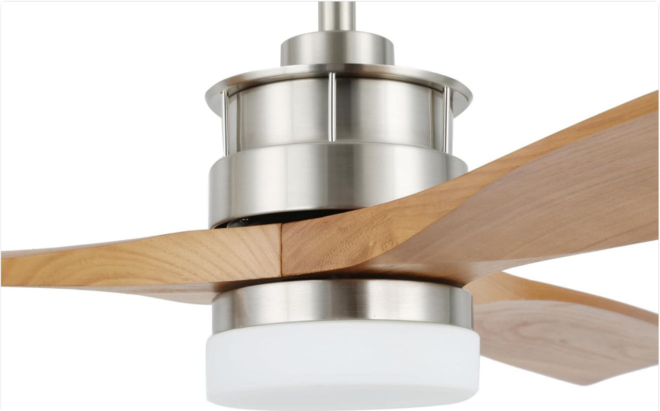
Image: A detailed view of the fan's motor housing and integrated LED light fixture.

The fan consists of a robust DC motor housed in a sleek metal casing, three precisely balanced solid wood blades, and an integrated LED light kit with a frosted diffuser. The remote control provides full functionality for fan and light settings.