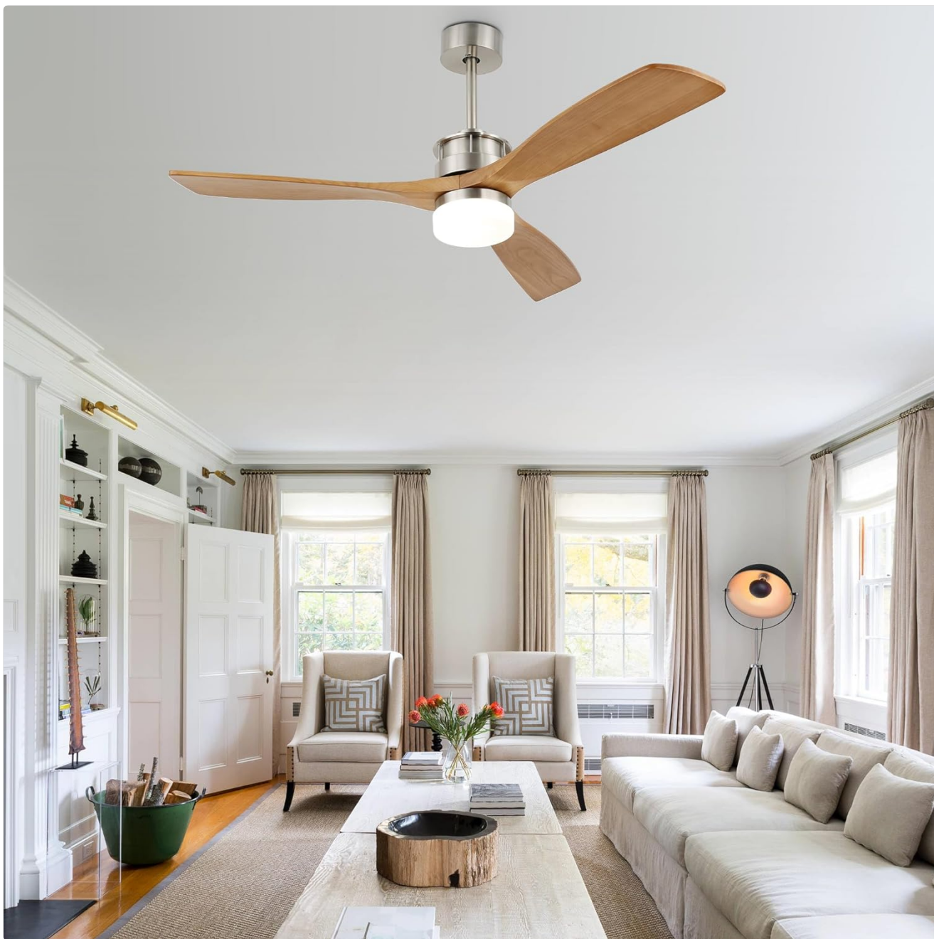
Image: The Bella Depot 52 Inch Wood Ceiling Fan elegantly installed in a modern living room setting.