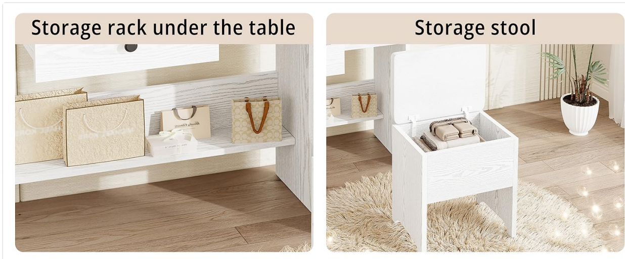
Image Description: This image shows the storage rack located beneath the main table surface and the stool, which features a lift-up lid for internal storage.

The vanity also includes a storage rack under the table and a storage stool for extra organization.