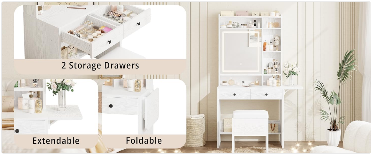
Image Description: The image displays the two storage drawers of the vanity and illustrates the foldable side shelf in both its extended and compact, folded states.