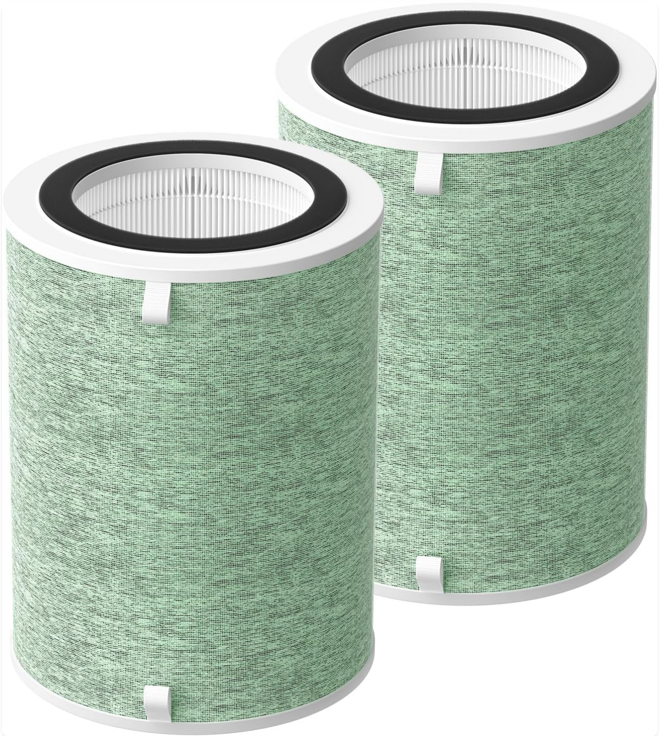
Image: A pair of iSingo MR7566 replacement filters, clearly displaying the integrated cloth tabs designed to simplify the installation and removal process.