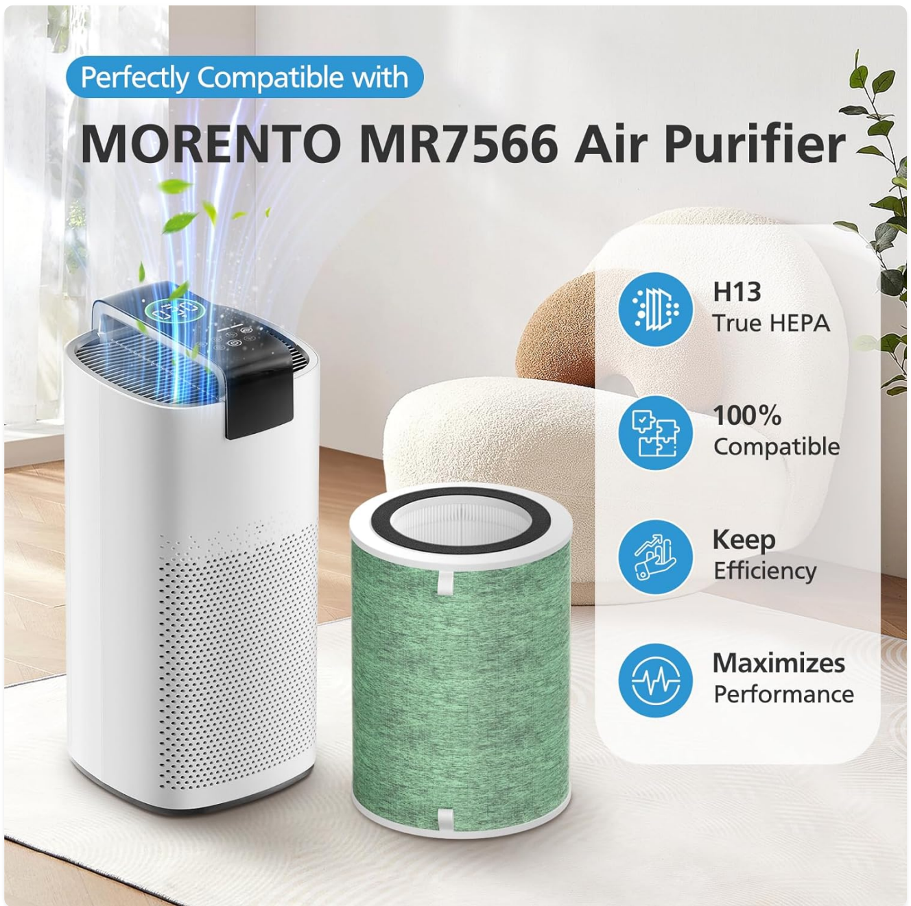
Image: The iSingo MR7566 filter shown alongside the compatible MORENTO MR7566 air purifier, highlighting its perfect fit and design for maintaining optimal air quality.