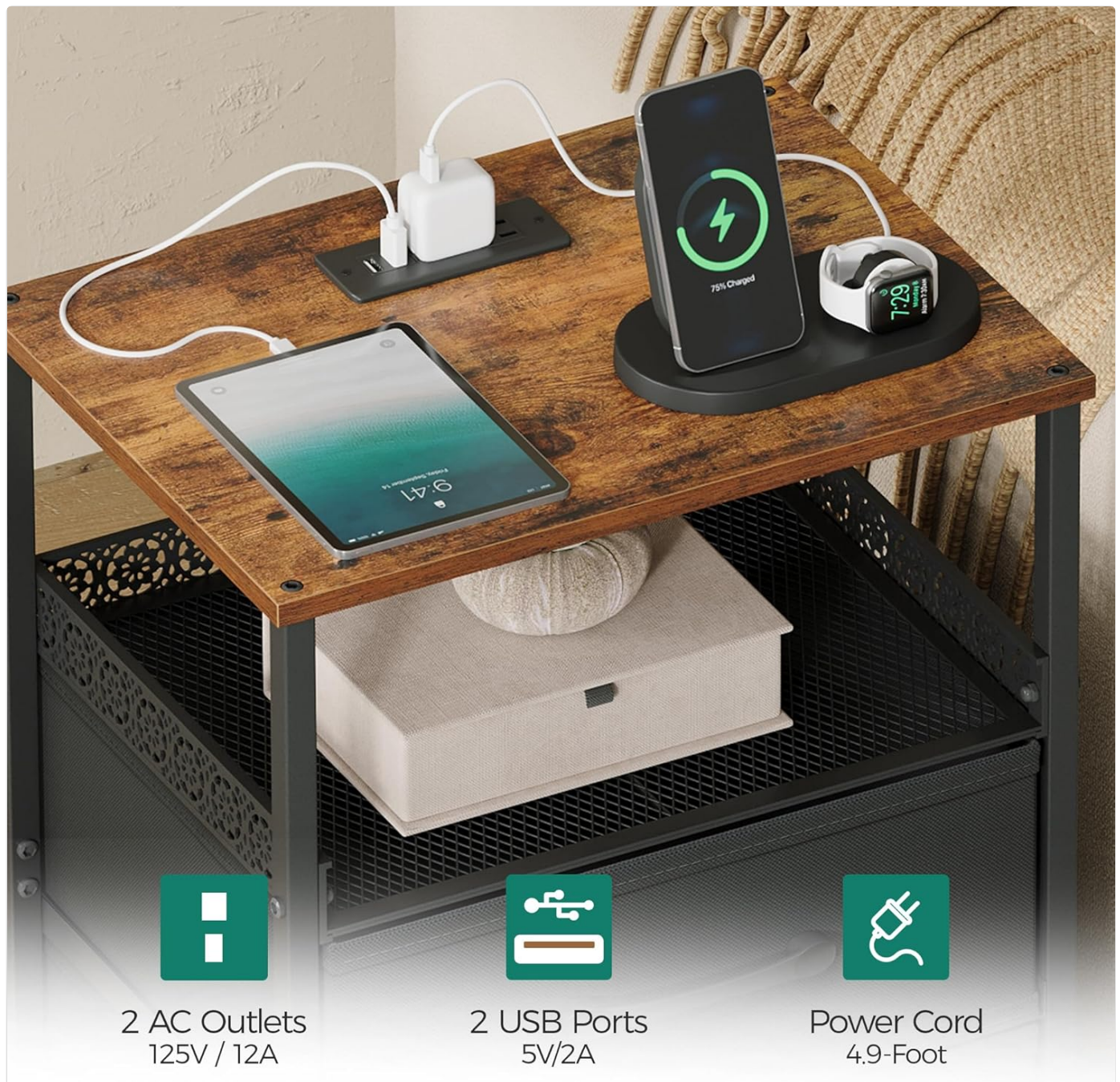
Figure 4: Integrated charging station with AC outlets and USB ports.