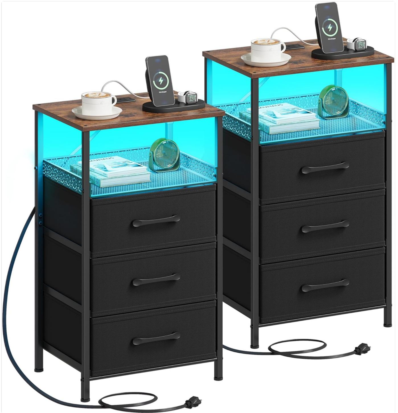
Figure 1: Assembled JARHETUN Night Stand Set.