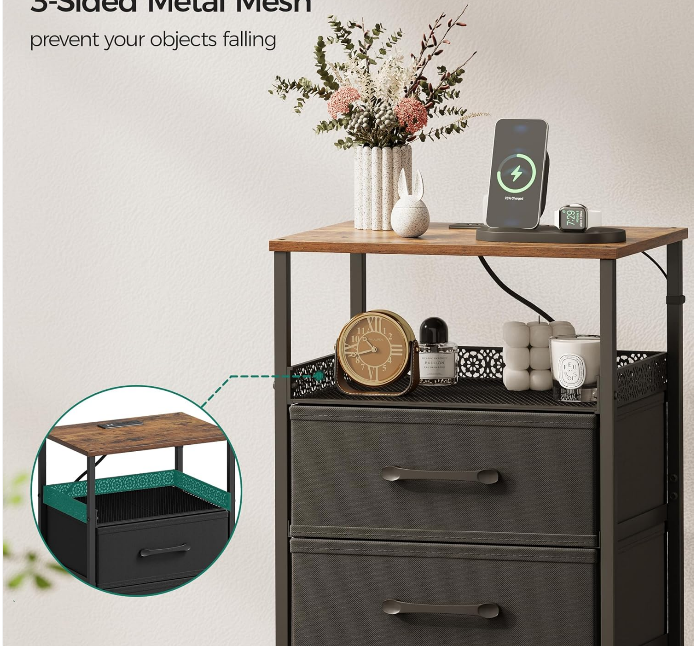
Figure 6: Open compartment with security fence.