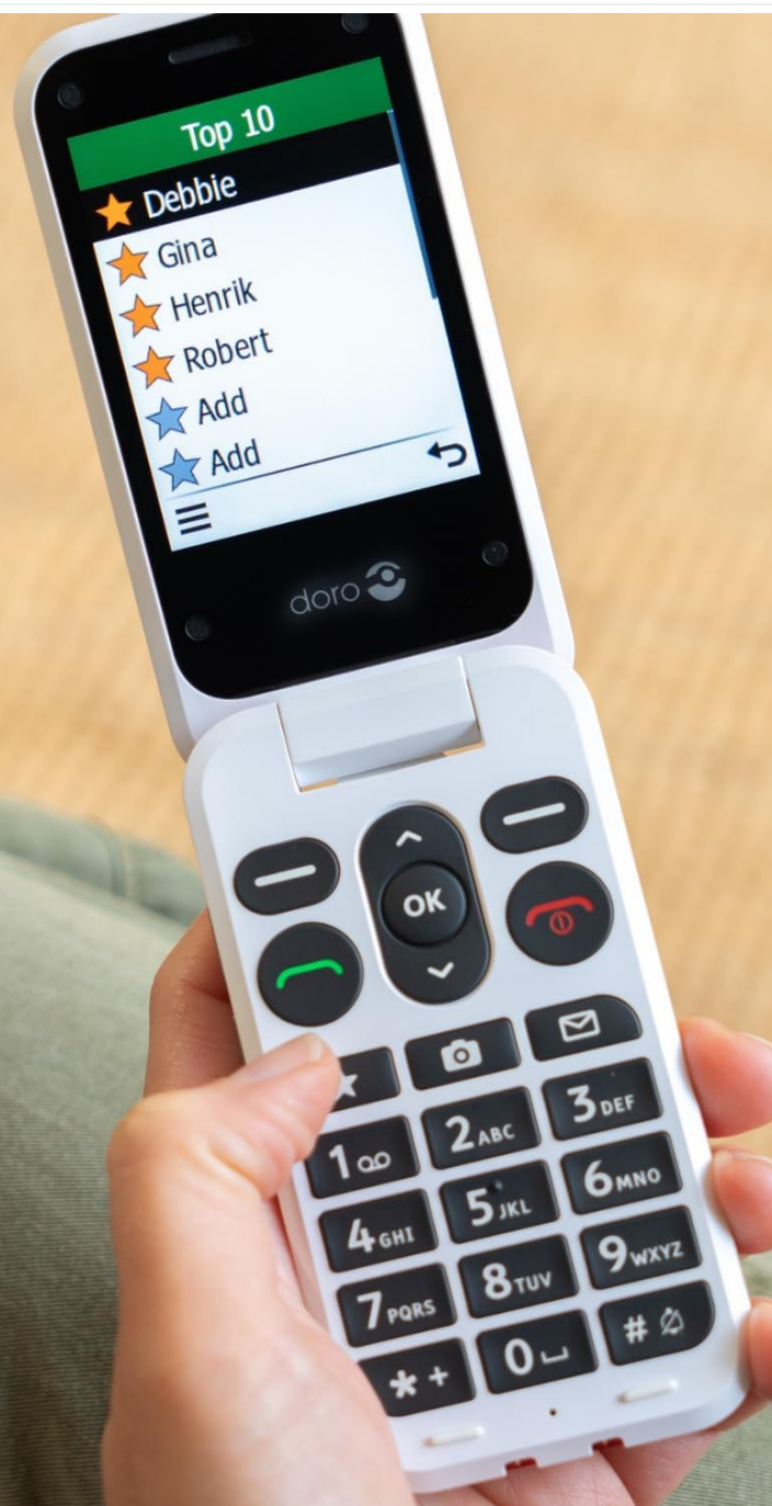
Image: A person holding the Doro Leva L20 phone, with the screen displaying a list of "Top 10" favourite contacts, illustrating the use of shortcut keys.