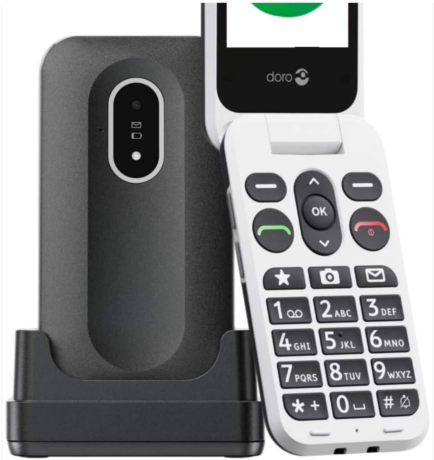
Image: The Doro Leva L20 mobile phone, a black flip phone with large white keys, shown alongside its black charging dock.