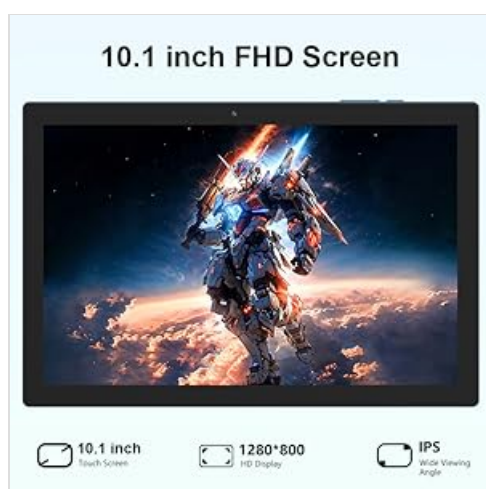
Image: The tablet screen showing a video playing, with icons for 10.1-inch screen size, Widevine L1, and IPS resolution, emphasizing media consumption capabilities.