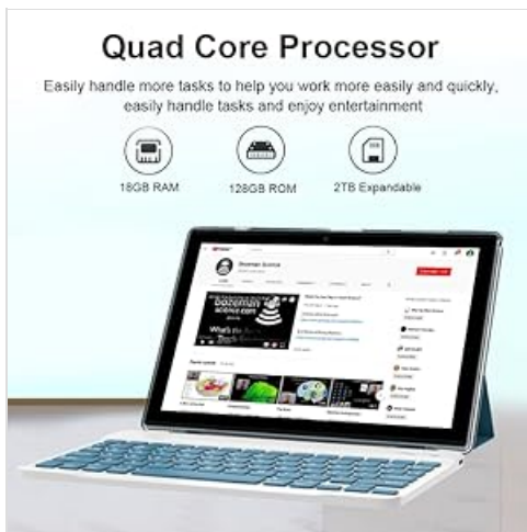
Image: A visual representation of the tablet's storage capacity, highlighting 128GB ROM and the option for 2TB expandable storage.