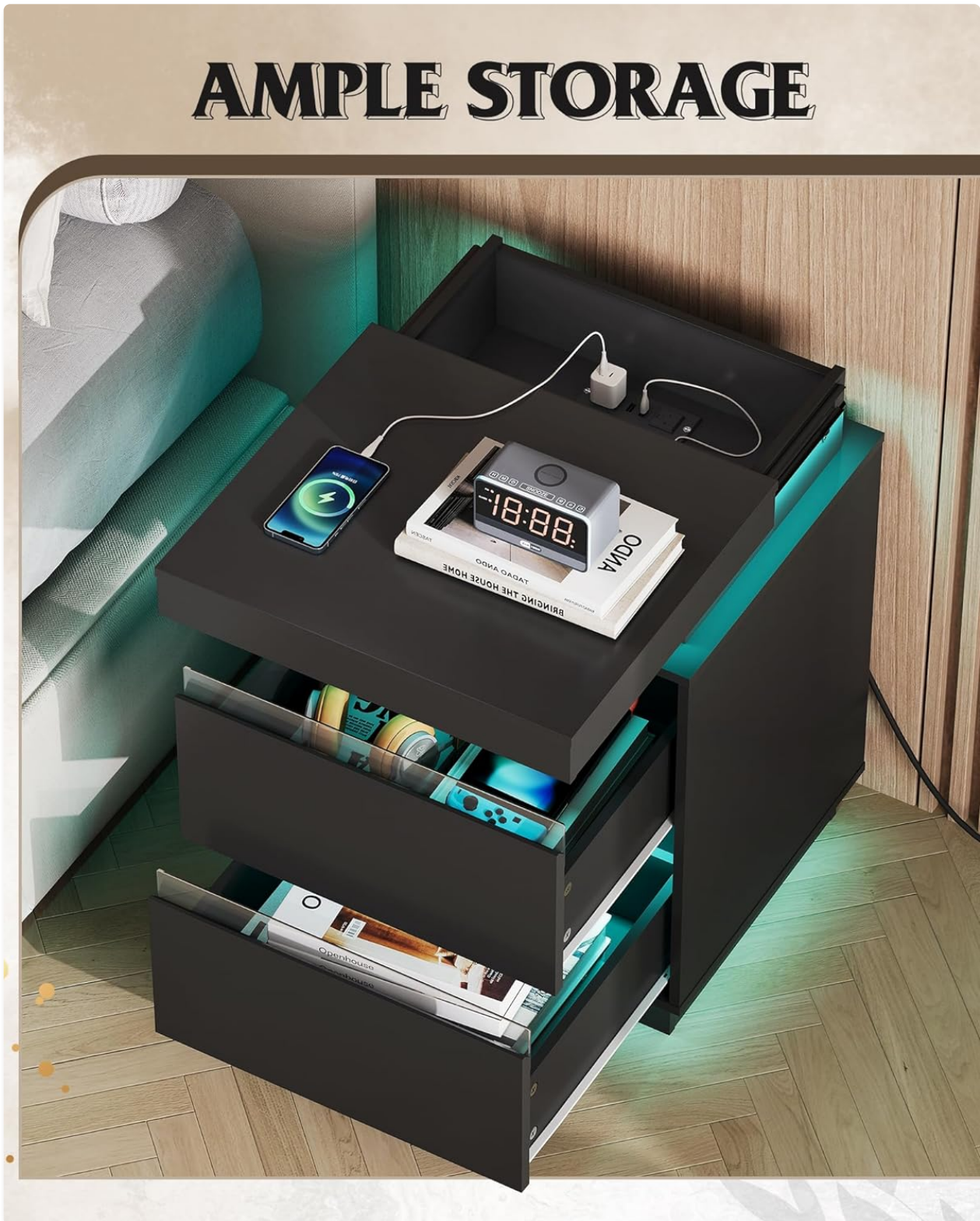
Image 4.3: The WLIVE Nightstand with its two drawers and sliding top compartment open, illustrating the ample storage