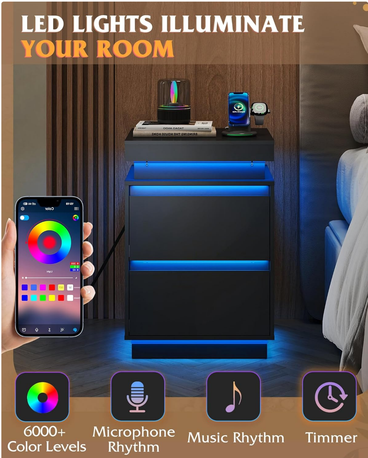
Image 4.1: The WLIVE Nightstand illuminated by its LED lights, demonstrating the color customization options available through a mobile application. Icons represent features like color levels, microphone rhythm, music rhythm, and timer.

3. Remote Control (if included): If a physical remote control is provided, insert a CR2025 battery (not included) to operate the lights. The lights may default to 'on' until turned off via the remote or app.