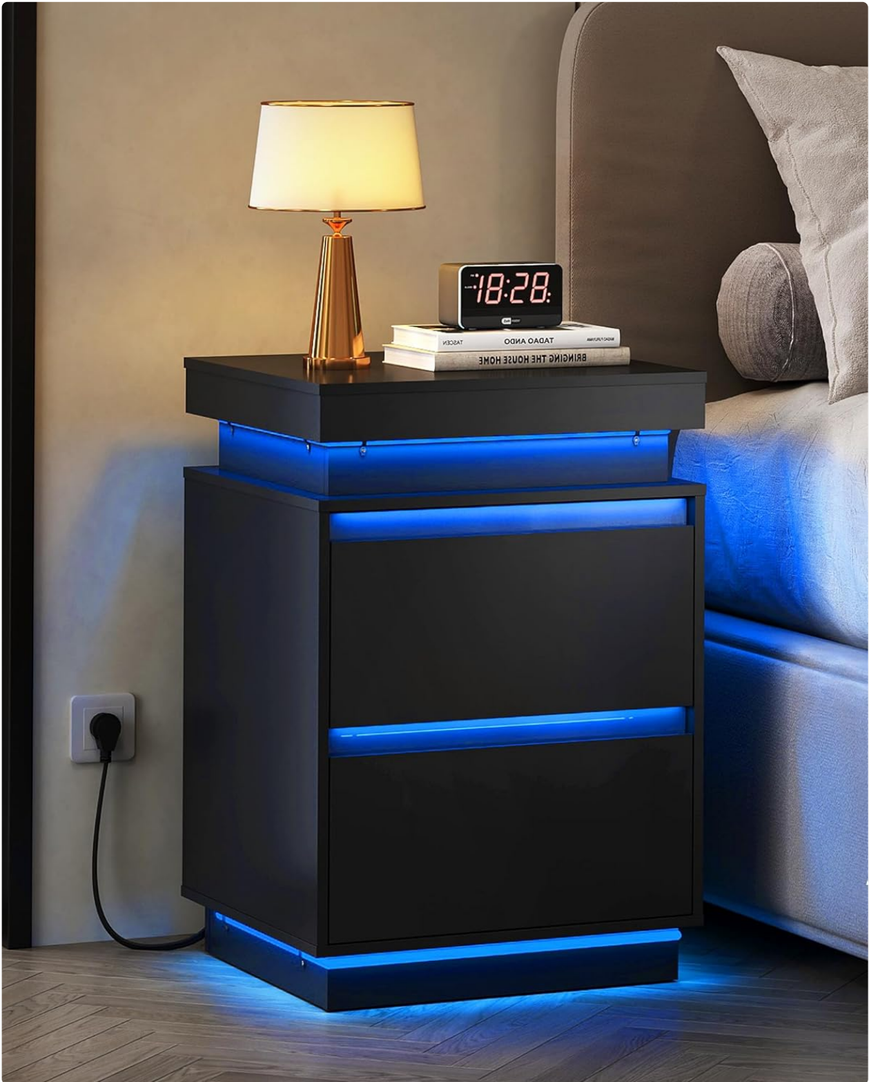
Image 1.1: The WLIVE Black Nightstand, showcasing its modern design with integrated LED lighting and a sleek black finish. This nightstand is designed to complement various bedroom decors while offering practical features.