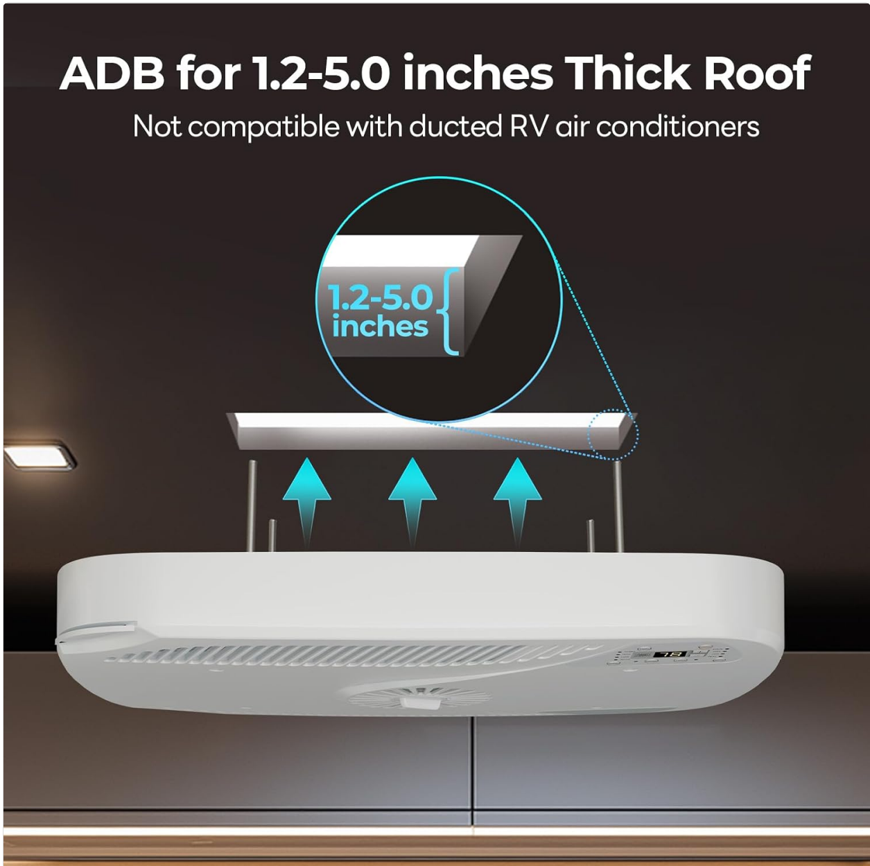
Figure 4: ADB Roof Thickness Compatibility (1.2-5.0 inches)

Video 1: General RV Air Conditioner Indoor Unit Setup. This video demonstrates the general setup process for an RV air conditioner indoor unit, which can provide context for ADB installation.