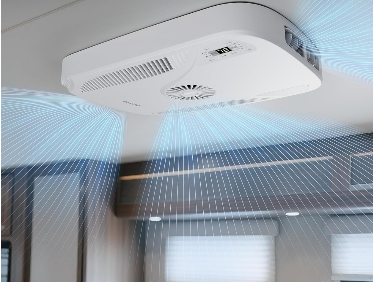
Figure 7: Multi-directional Air Supply