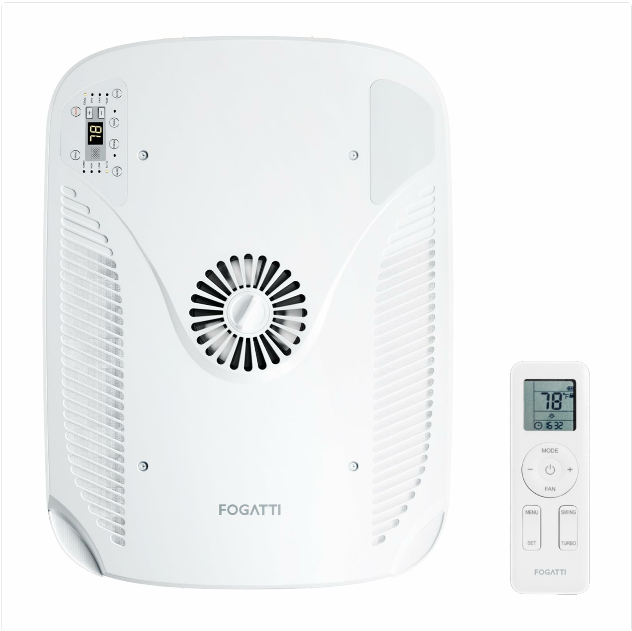
Figure 1: FOGATTI Air Distribution Box (ADB)