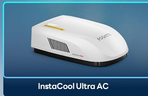
Figure 2: FOGATTI InstaCool Ultra AC unit and compatible Air Distribution Box