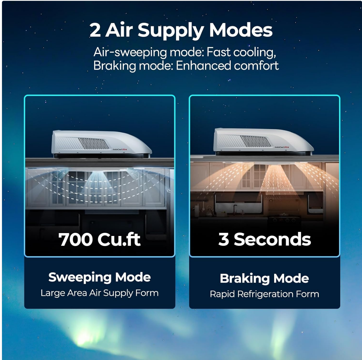
Figure 6: Two Air Supply Modes