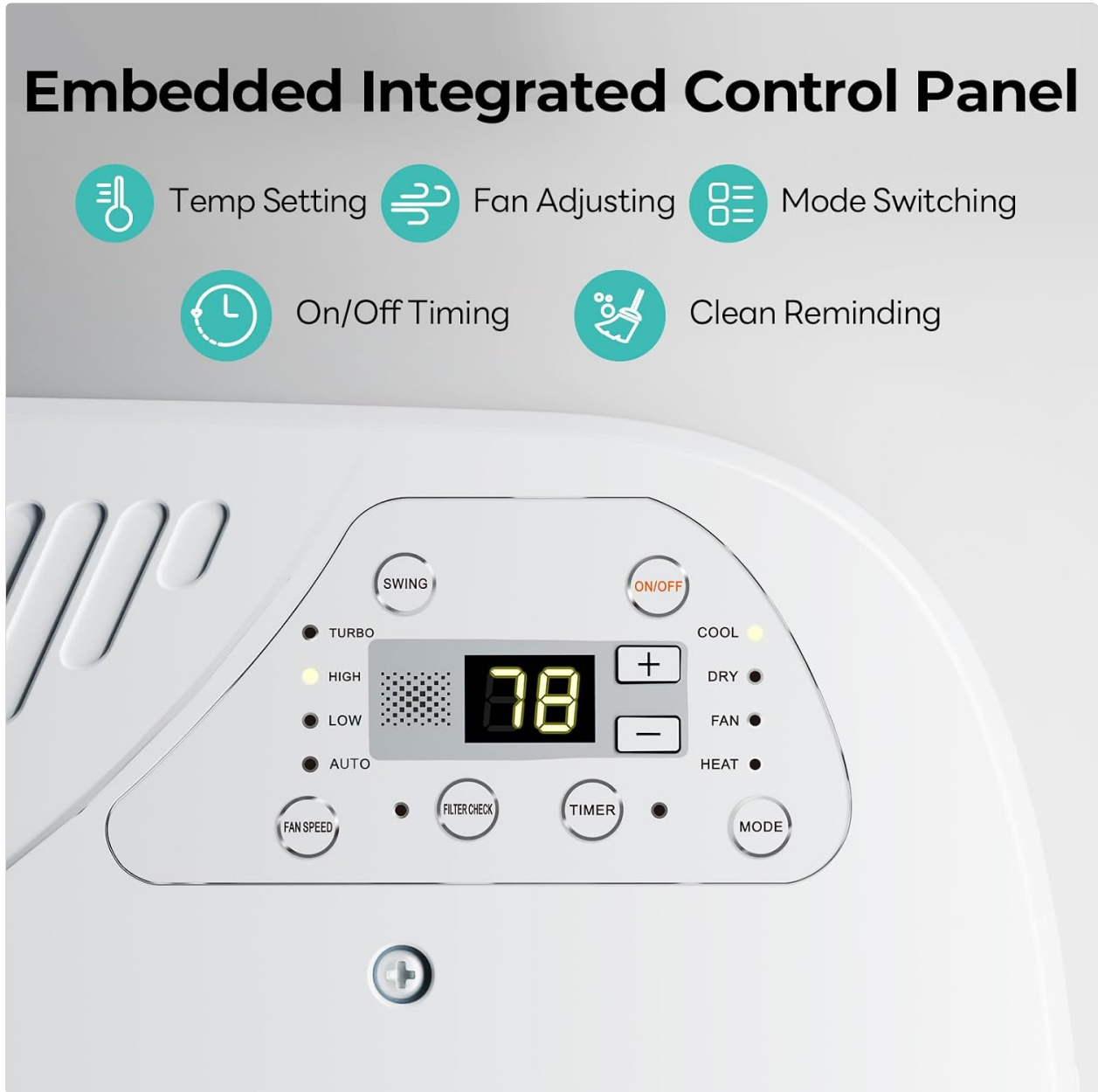
Figure 5: Integrated Control Panel

The ADB features an integrated control panel for direct adjustments. This panel allows you to set temperature, adjust fan speed, switch modes, set on/off timers, and receive clean reminders.