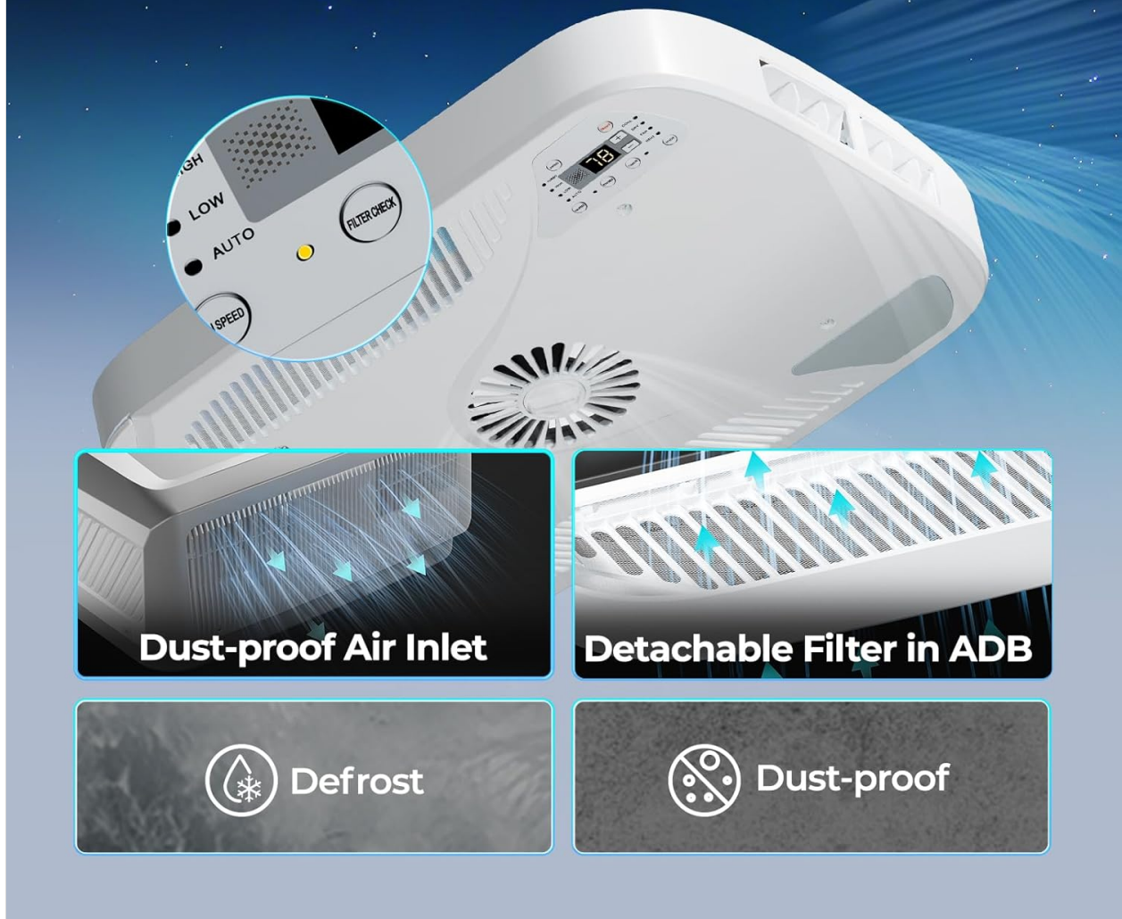
Figure 8: Automatic Filter Cleaning Reminder and Detachable Filter

Prevent dust from mixing into the air conditioner