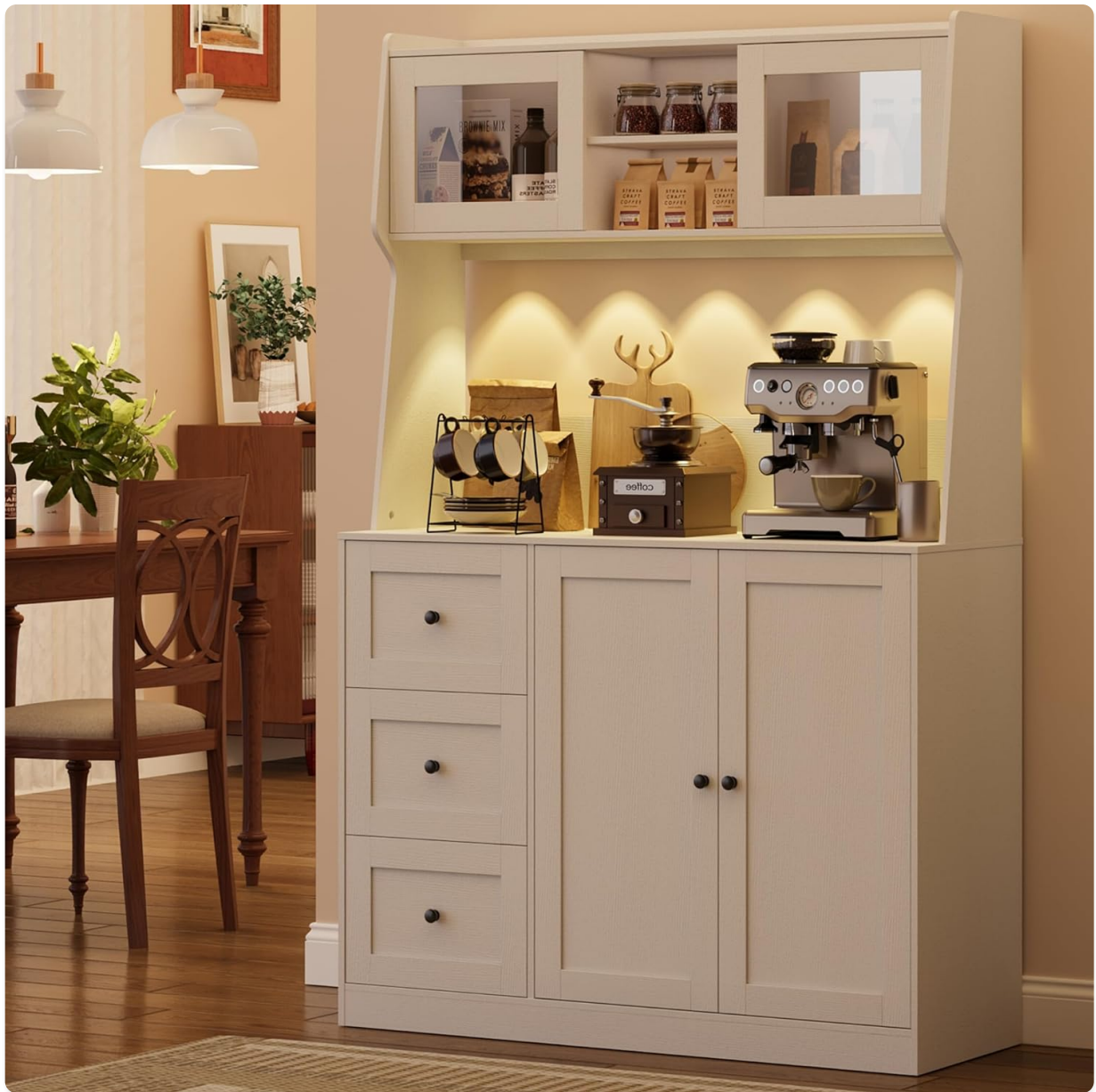
Image: The GarveeHome 66-inch Kitchen Pantry Cabinet, showcasing its design and functionality within a home environment.