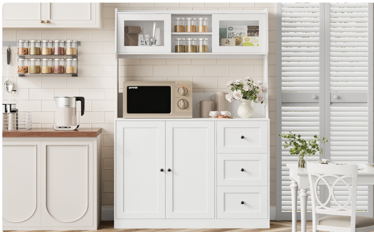
Image: An annotated diagram highlighting the various storage components of the cabinet, such as 2-tier open shelves, double glass doors, a large open worktop, closed storage areas, and three drawers.

Before beginning assembly, carefully unpack all components and verify that all parts are present. Refer to the parts list included in your package for a complete inventory. If any parts are missing or damaged, please contact GarveeHome customer support immediately.