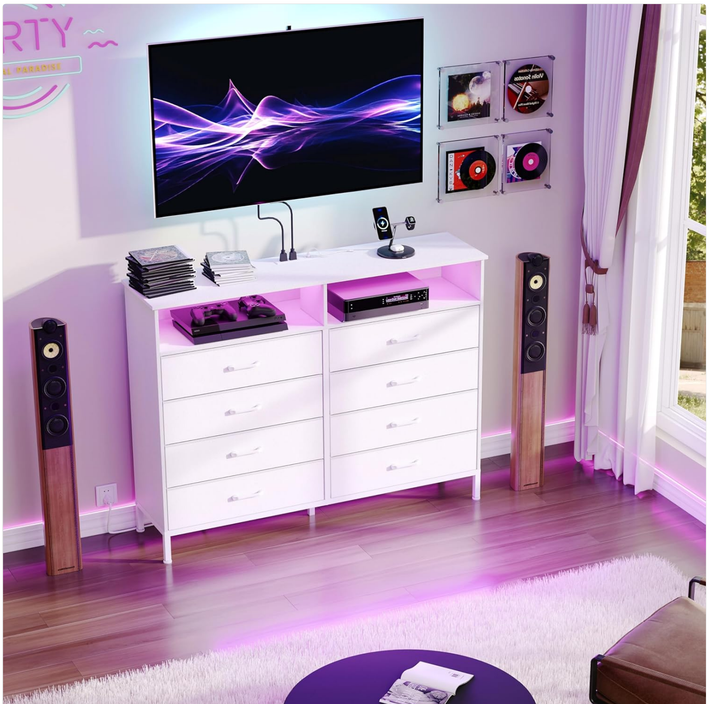
Figure 6: Dresser as a Living Room TV Stand. This image demonstrates the dresser's versatility, showcasing it as a functional and stylish TV stand in a modern living room setting, complemented by ambient purple LED lighting.