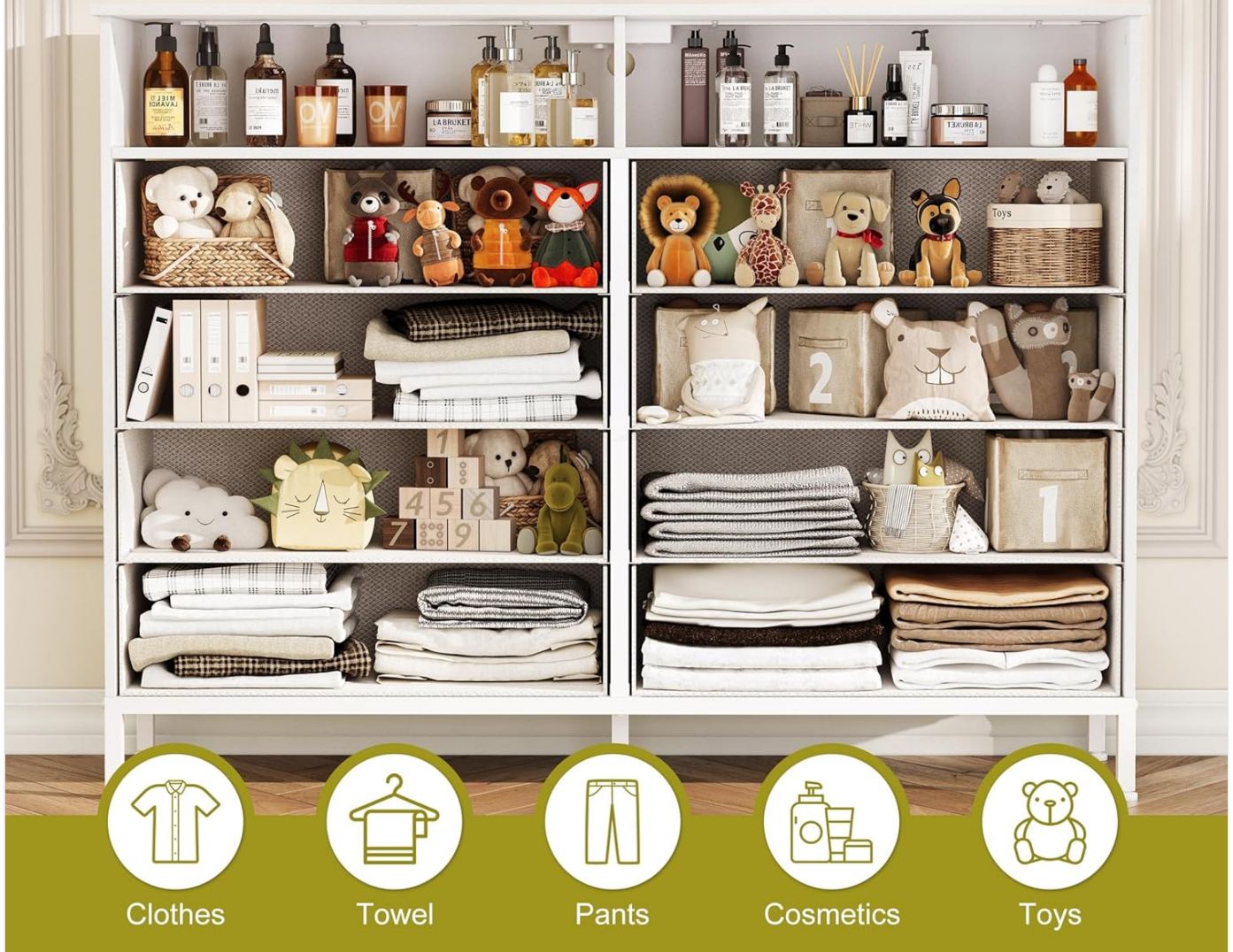
Figure 3: Ample Storage Space. This image illustrates the significant storage capacity of the dresser, with all eight fabric drawers open and filled with various household items, showcasing its organizational potential.