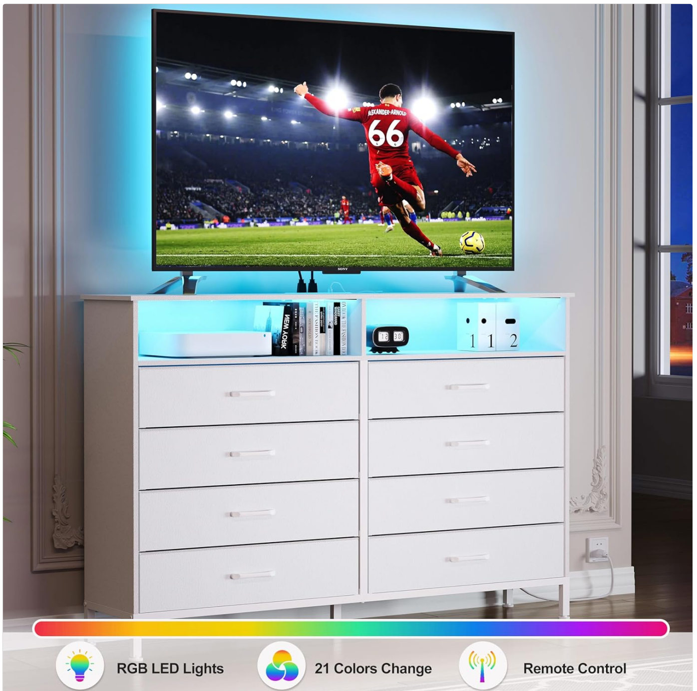
Figure 4: LED Lights and TV Stand Functionality. This image shows the dresser with its LED lights illuminated in blue, serving as a media console for a television. The presence of a remote control icon highlights the customizable lighting features.