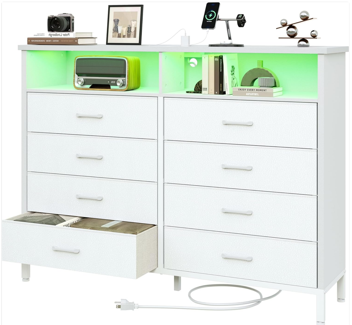
Figure 5: Dresser with Charging Station and LED Lights. This image provides a clear view of the dresser's top section, highlighting the integrated charging station in use with a smartphone, and the ambient green LED lighting in the open cubbies.