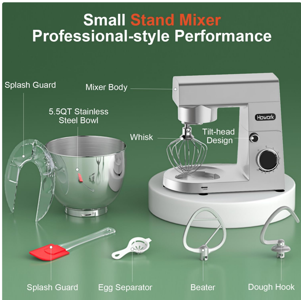
Image 3.1: Exploded view of the HOWORK SM-1588 Stand Mixer components.

The HOWORK SM-1588 Stand Mixer includes the following main components: