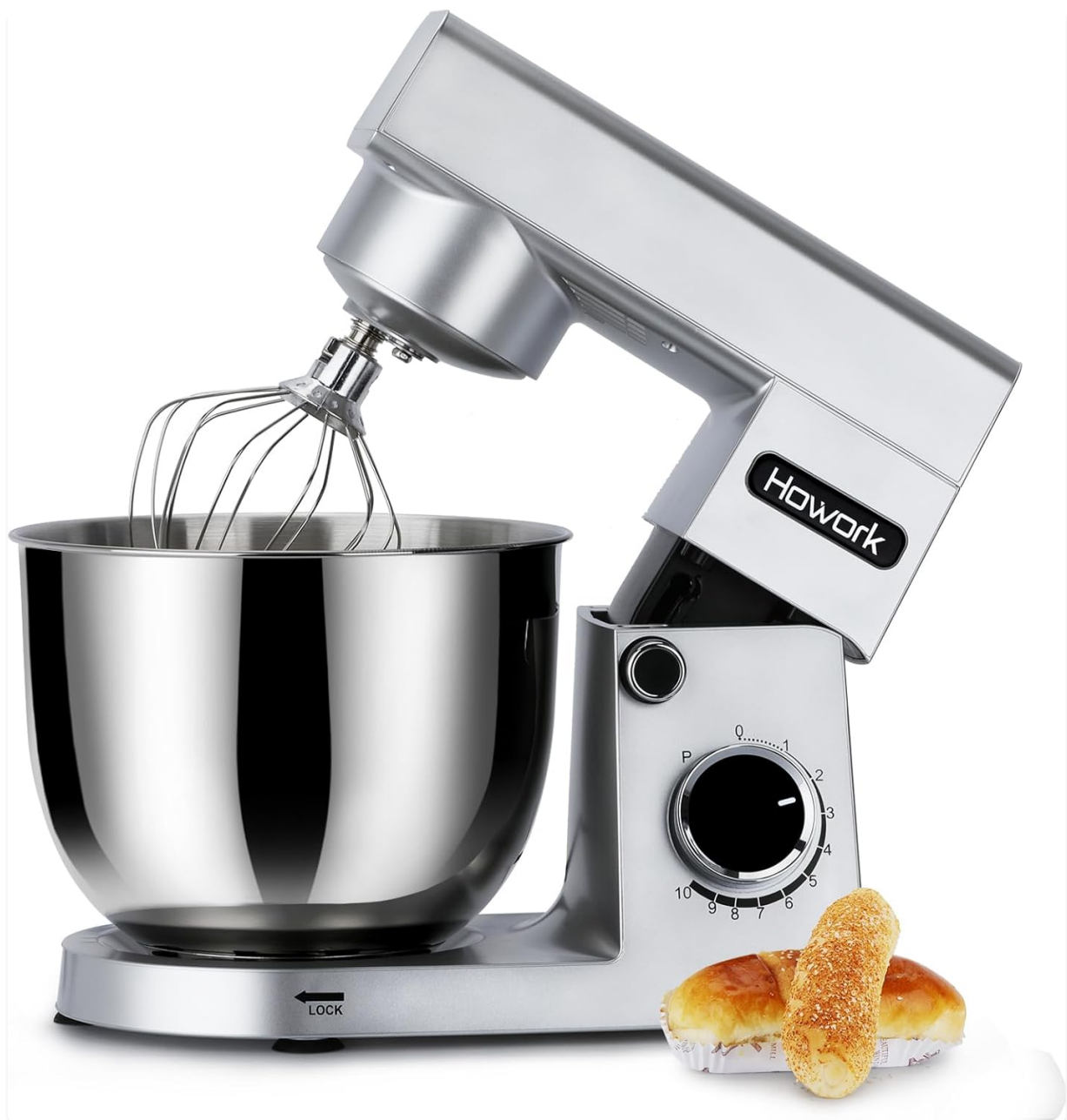
Image 1.1: The HOWORK SM-1588 Stand Mixer with its main components.