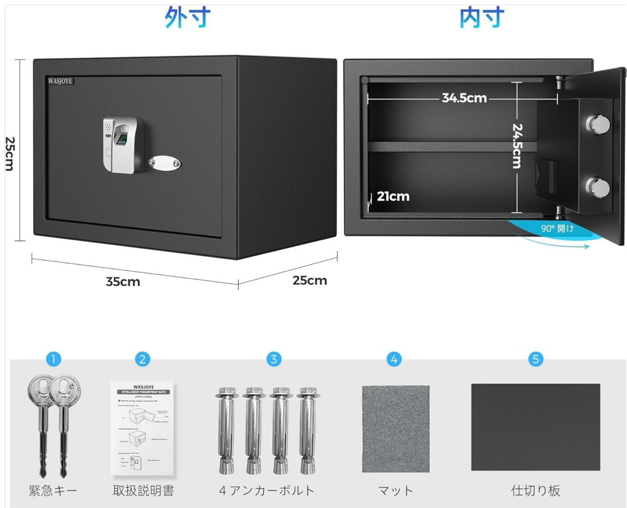
Image: All components included with the WASJOYE Fingerprint Safe BXX.