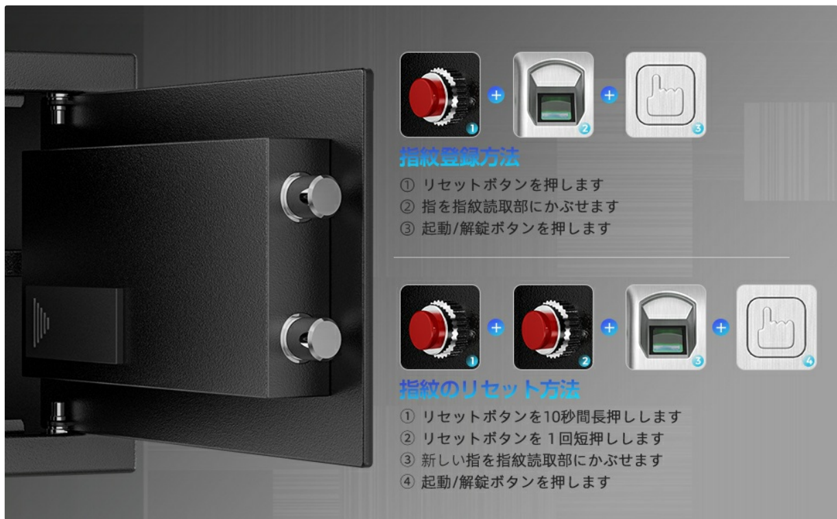
Image: Visual guide for registering and resetting fingerprints.