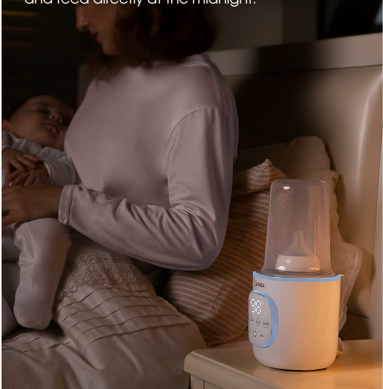
Image: The 24H Keep Warm function in use, providing warm milk for convenient night feedings.

Set the temperature before sleeping and feed directly at the midnight.