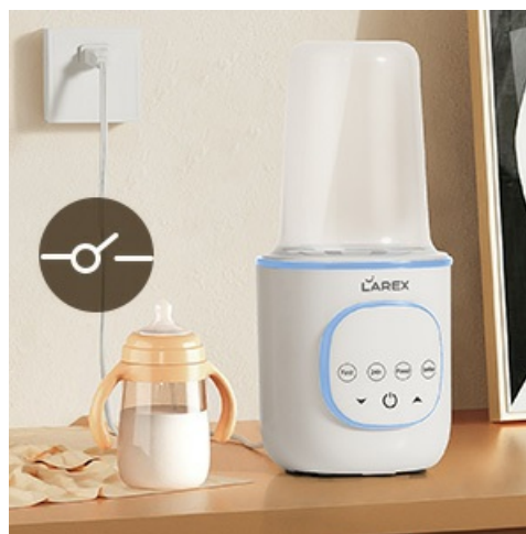
Image: The bottle warmer performing steam sterilization.