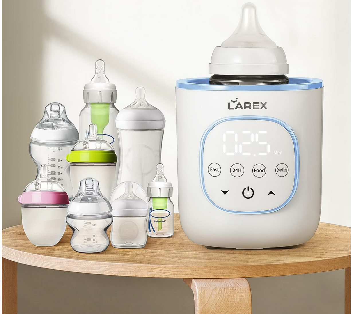
Image: The LAREX Bottle Warmer is compatible with all major bottle brands and sizes.

Video: A demonstration of the LAREX Baby Bottle Warmer's various functions and ease of use.