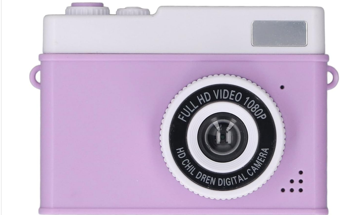
Front view of the Zopsc Digital Camera, highlighting the lens and built-in flash.

Restore the real color, and the picture is more charming.