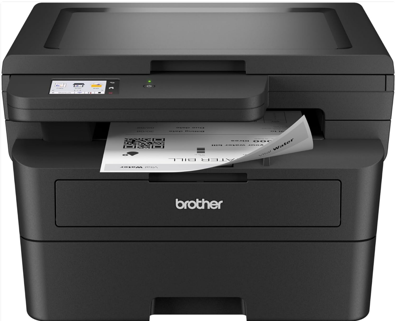
Figure 4: The printer in operation, demonstrating paper output.