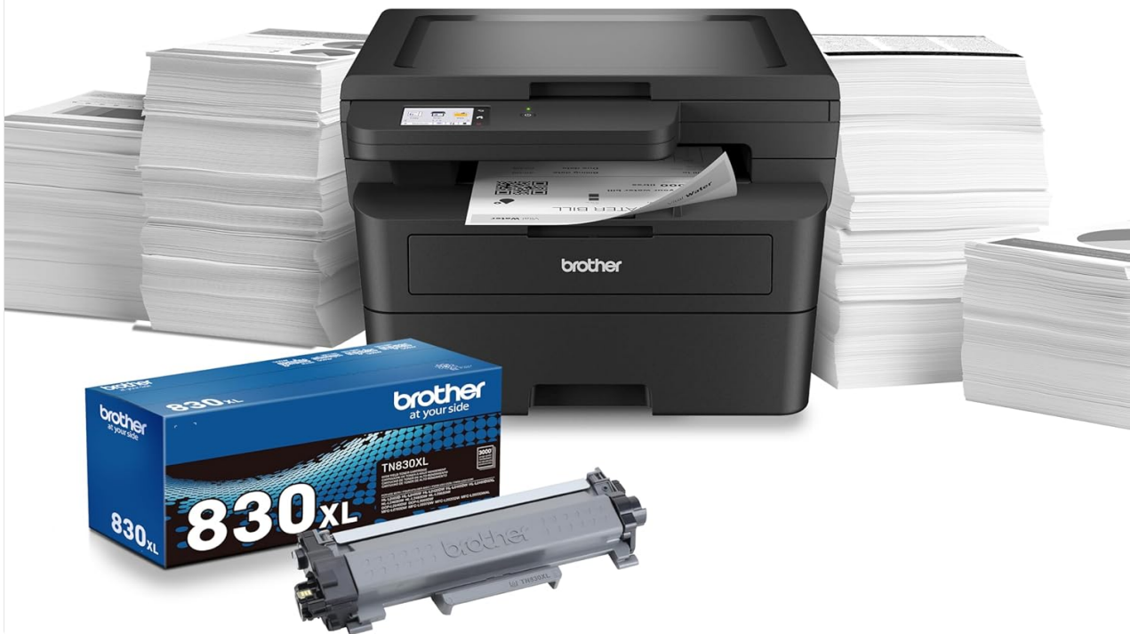
Figure 7: Brother Genuine Toner and Drum Unit for the HL-L2480DW.

Reliable compatibility & superior performance.