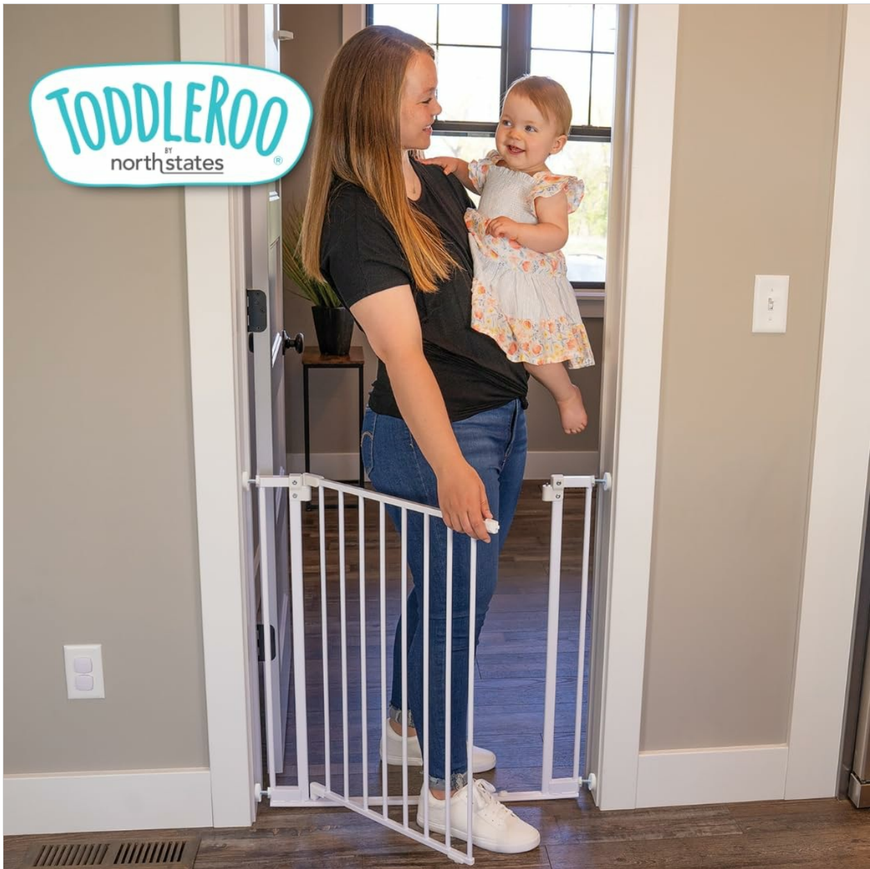
Image: An adult carrying a baby easily passes through the open gate, demonstrating the convenience of the one-hand operation and wide door.