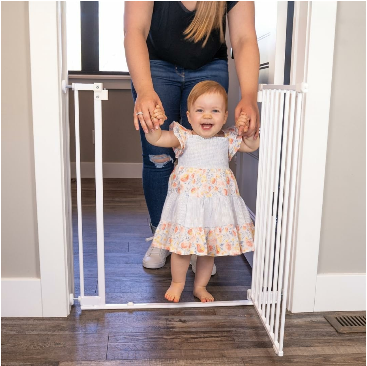
Image: The Toddleroo by North States StepSafe Auto Close Baby Gate installed in a doorway, with an adult and a baby demonstrating its use.