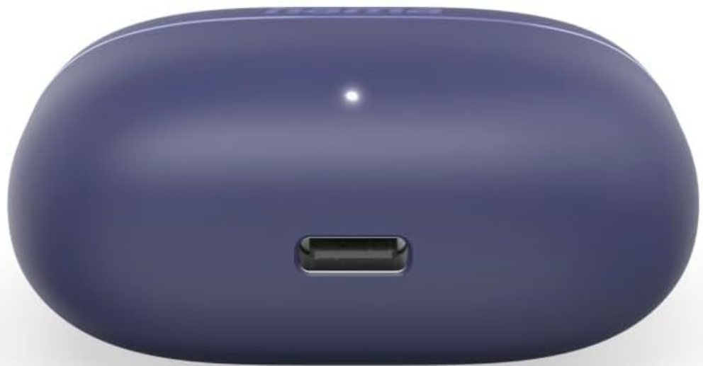
Image: A close-up view of the charging case, highlighting the USB-C charging port at the bottom.