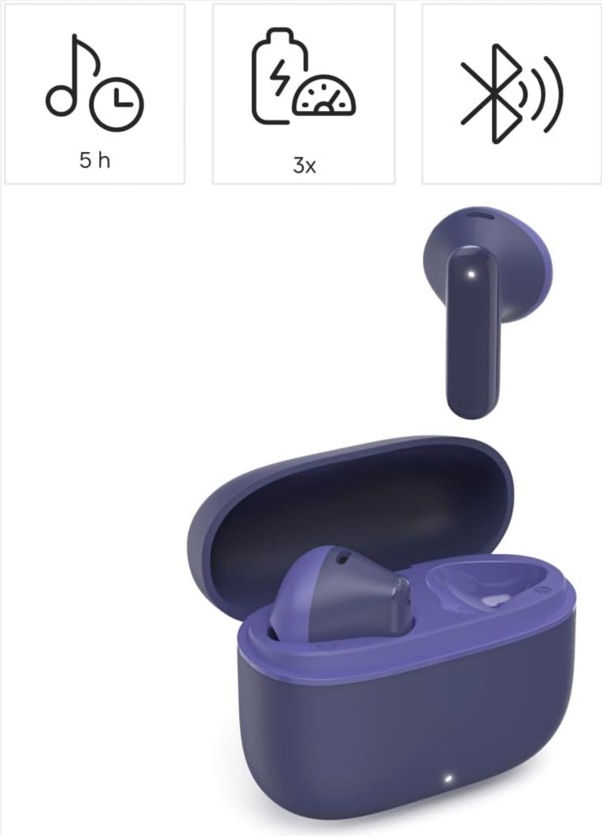
Image: Icons illustrating key features: 5 hours of playtime per charge, 3 additional charges from the case, and Bluetooth connectivity.