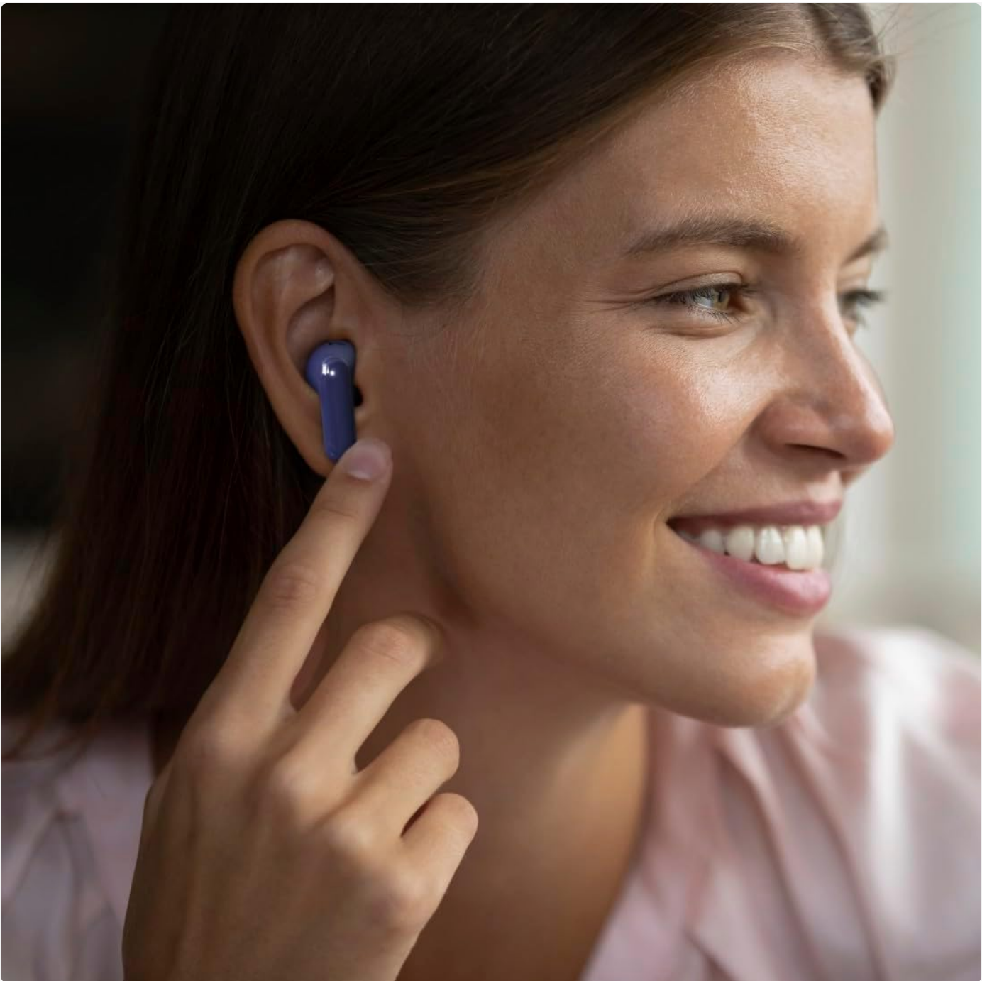
Image: A user demonstrating the touch control feature on the earbud while wearing it.