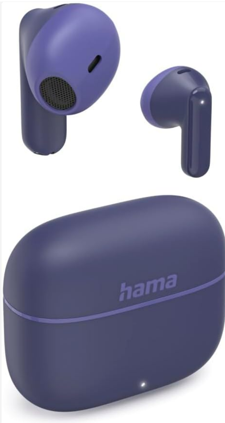
Image: The Hama Freedom Light II Bluetooth Earbuds shown with their compact charging case. The earbuds are a deep blue color, designed for in-ear comfort.