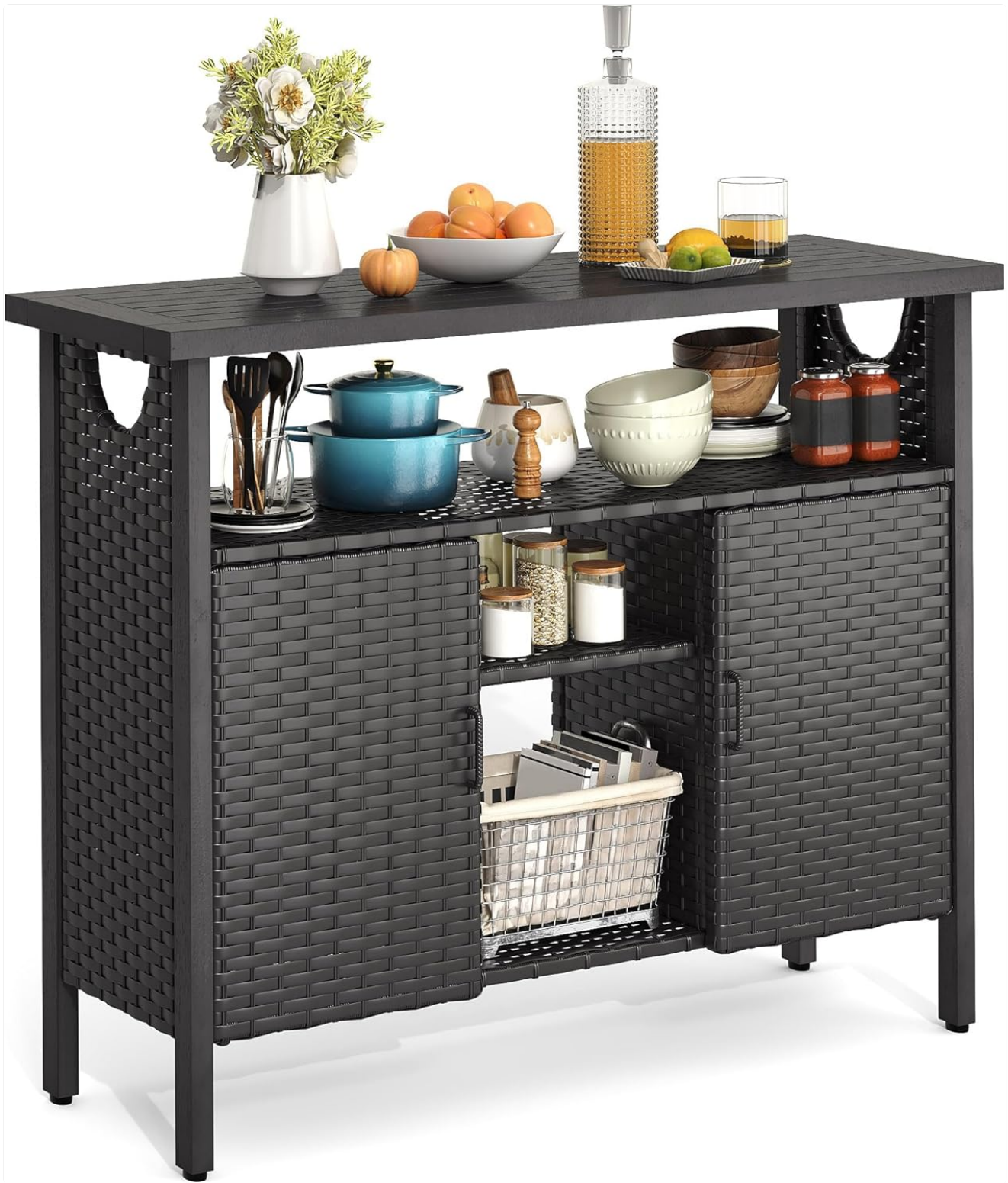
Figure 6: The cabinet functioning as an elegant sideboard in an indoor setting, highlighting its versatility.