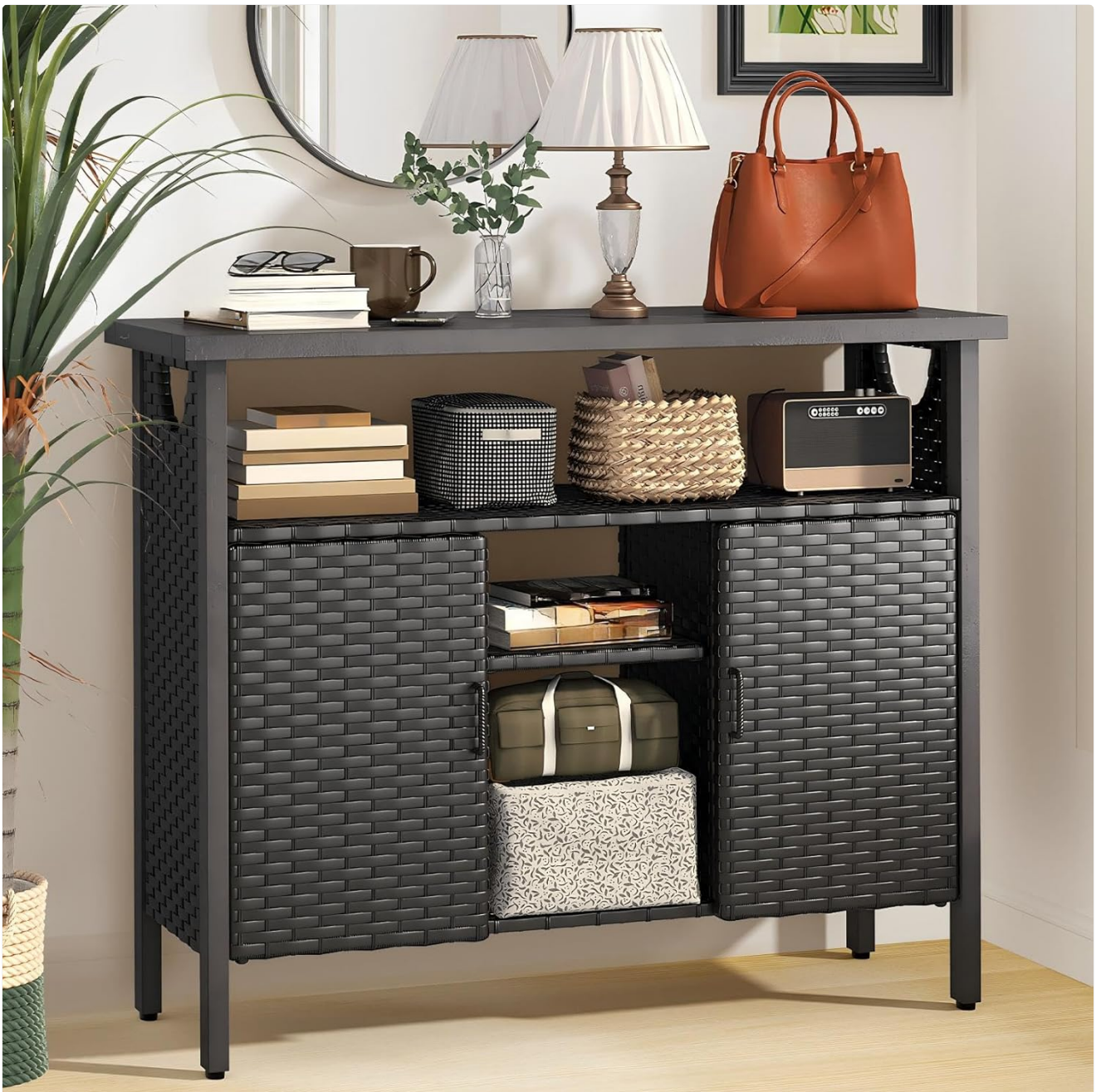
Figure 1: YITAHOME XXL Outdoor Storage Cabinet in an indoor setting, showcasing its design and storage capabilities.