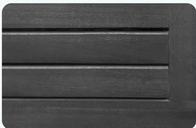
Acacia wood tabletop Solid wood panel for stability.