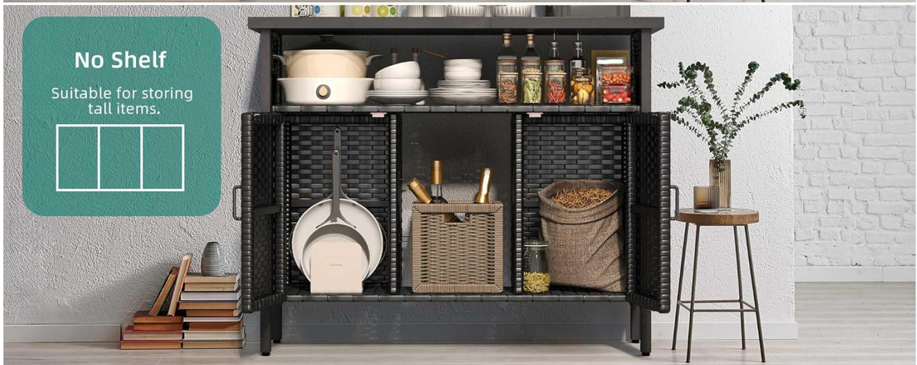
Figure 3: Illustration of the removable shelf feature, allowing flexible storage configurations for various items.