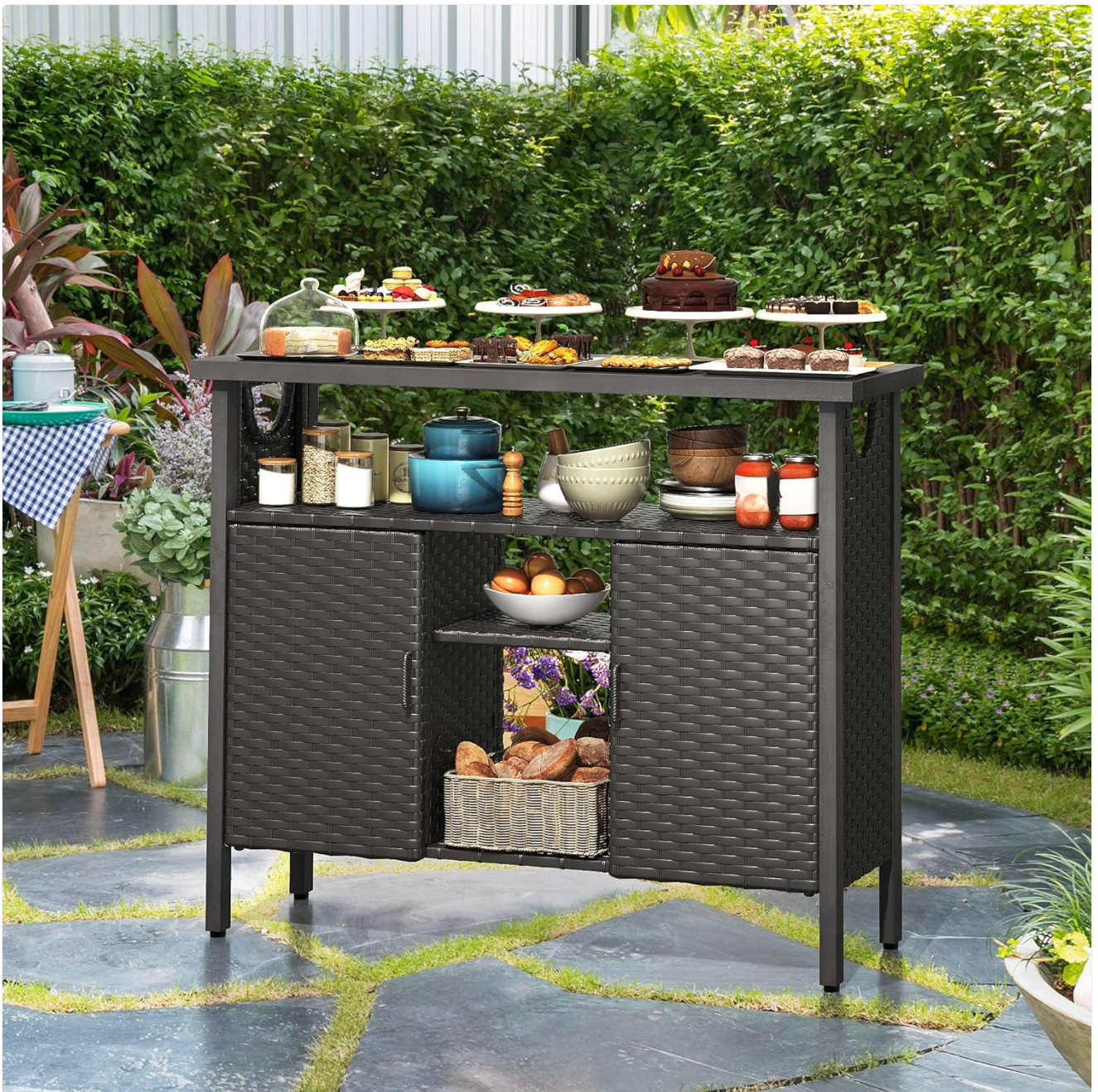
Figure 4: The cabinet serving as a buffet table in an outdoor garden setting, demonstrating its utility for entertaining.