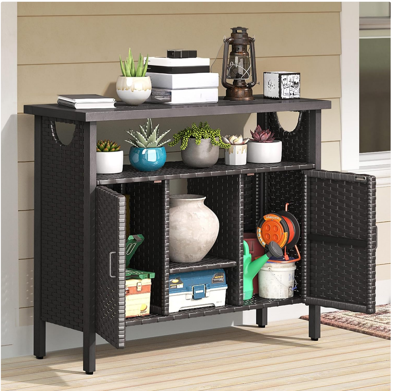
Figure 5: The cabinet used for outdoor storage, neatly organizing garden tools and other supplies.