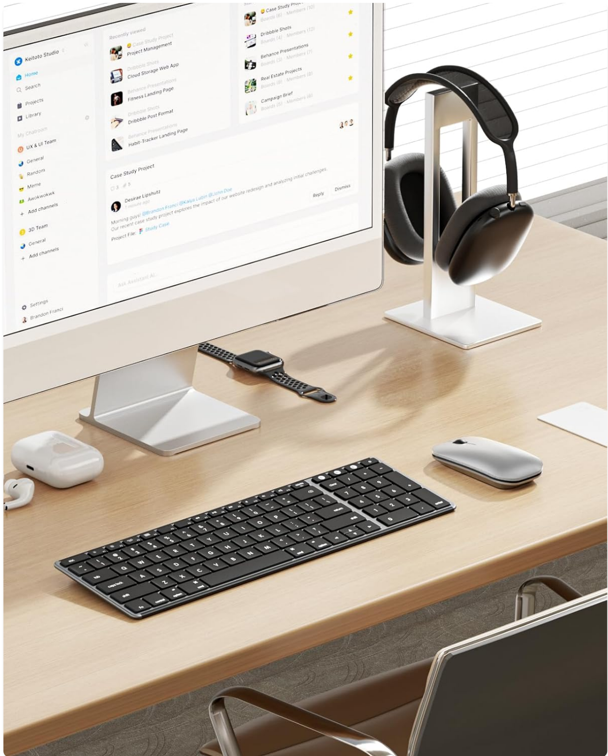
The seenda Bluetooth keyboard shown with its clear silicone protective cover, designed to shield against dust and spills.