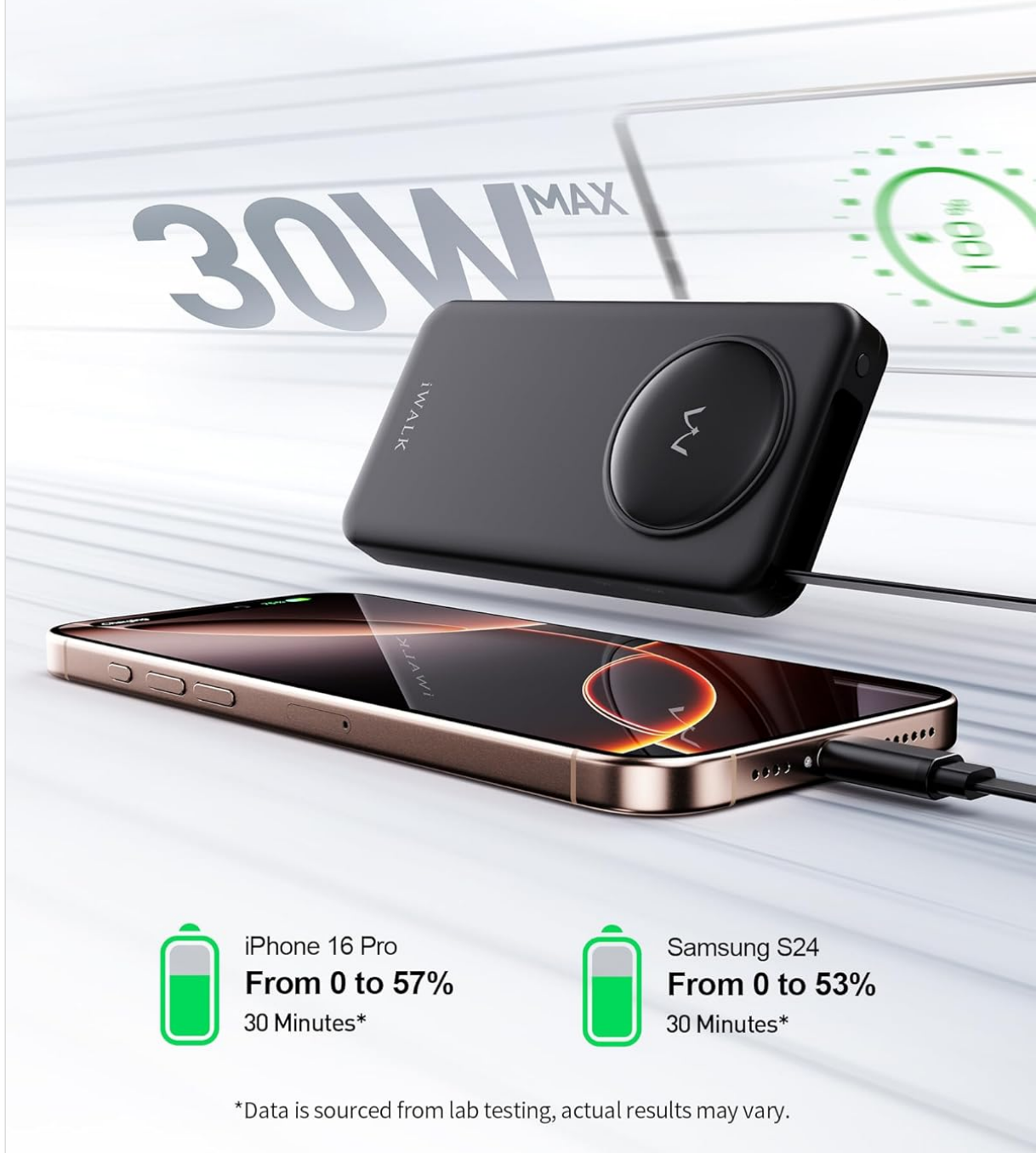
Figure 4: Illustrates the 30W PD bi-directional fast charging capability, showing rapid charging for both the power bank and connected devices.