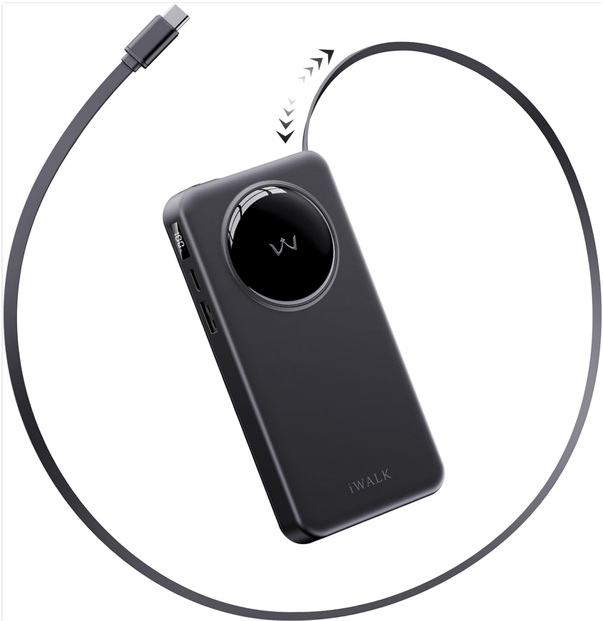
Figure 1: Front view of the iWALK 10000mAh Slim Portable Charger, showcasing its compact design and integrated retractable USB-C cable.