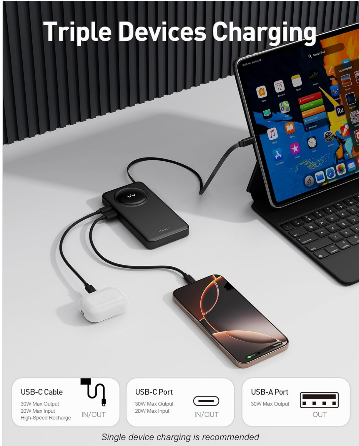
Figure 5: Illustrates the capability to charge three devices simultaneously using the built-in USB-C cable, USB-C port, and USB-A port.

The power bank supports simultaneous charging of multiple devices, but for optimal fast charging performance, single device charging is recommended.